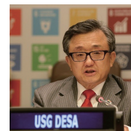
Mr. Liu Zhenmin