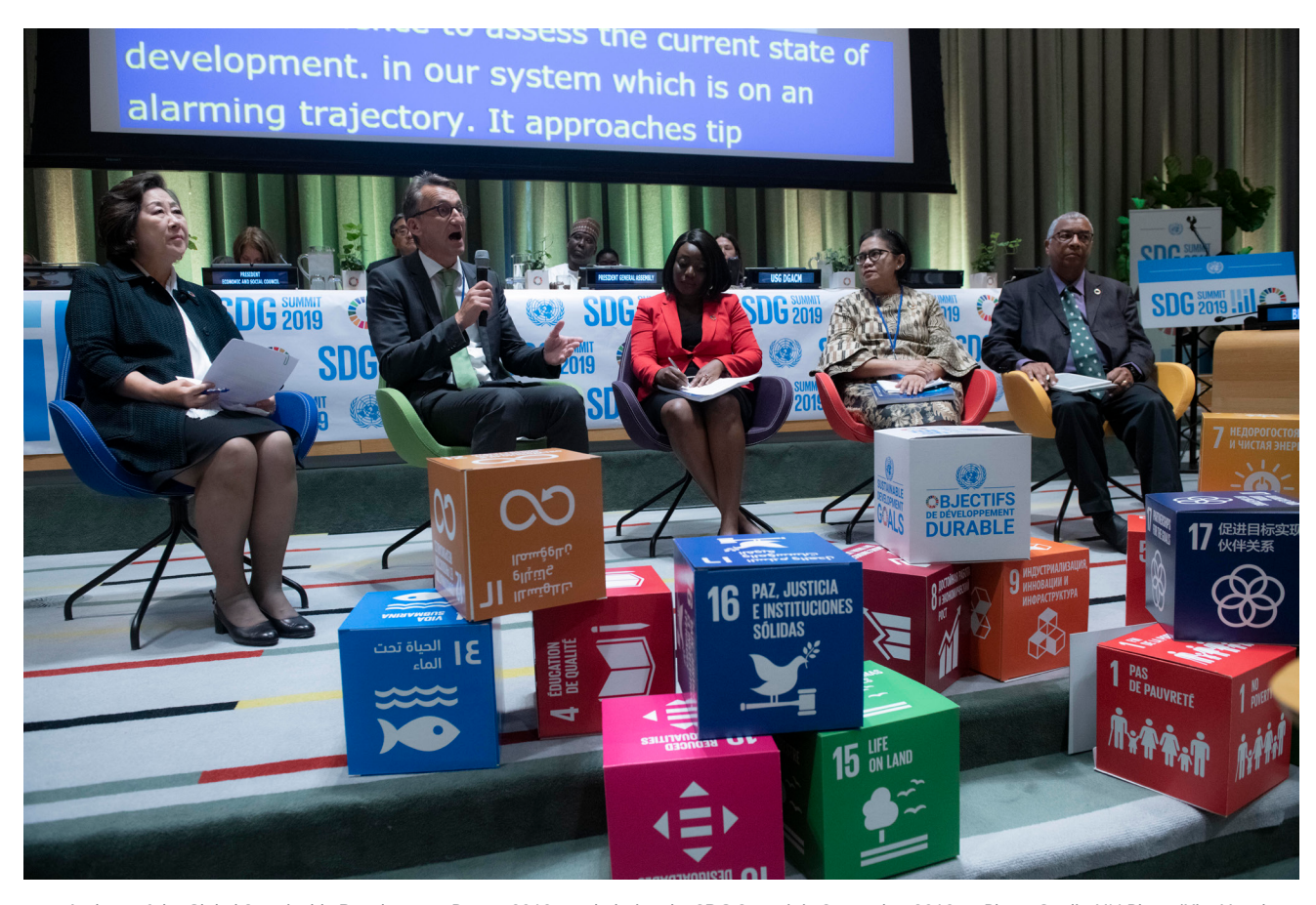
Authors of the Global Sustainable Development Report 2019 speak during the SDG Summit in September 2019.

July 2020, including a three-day ministerial meeting of the forum from 14 to 16 July 2020. Discussions focused on the theme Accelerated action and transformative pathways: realizing the decade of action and delivery for sustainable development. The meeting attracted more than 125,000 live online viewers on UN WebTV.