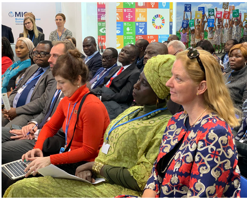
Participants listen and participate in sessions at UN DESA's SDG Pavilion at COP 25 in Madrid.