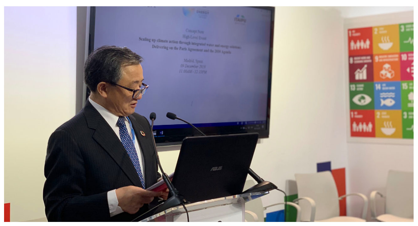
USG Liu Zhenmin delivers remarks at an event at UN DESA's SDG Pavilion at COP25 in Madrid.

2020 was meant to be a landmark year for climate action and the SDGs. While ushering in a decade of ambitious action to deliver the SDGs by 2030, governments were also preparing to enhance their climate ambitions through updated nationally determined contributions under the Paris Agreement. The onset of the COVID-19 pandemic, and the deepening of inequities it has left in its wake, have heightened the urgency of effectively mitigating the climate crisis. The 2030 Agenda and the Paris Agreement can serve as a compass to help policy makers meet urgent needs while aligning short-term solutions to medium and long-term climate and sustainable development objectives. UN DESA is moving the needle forward for harnessing synergies across development and climate action.