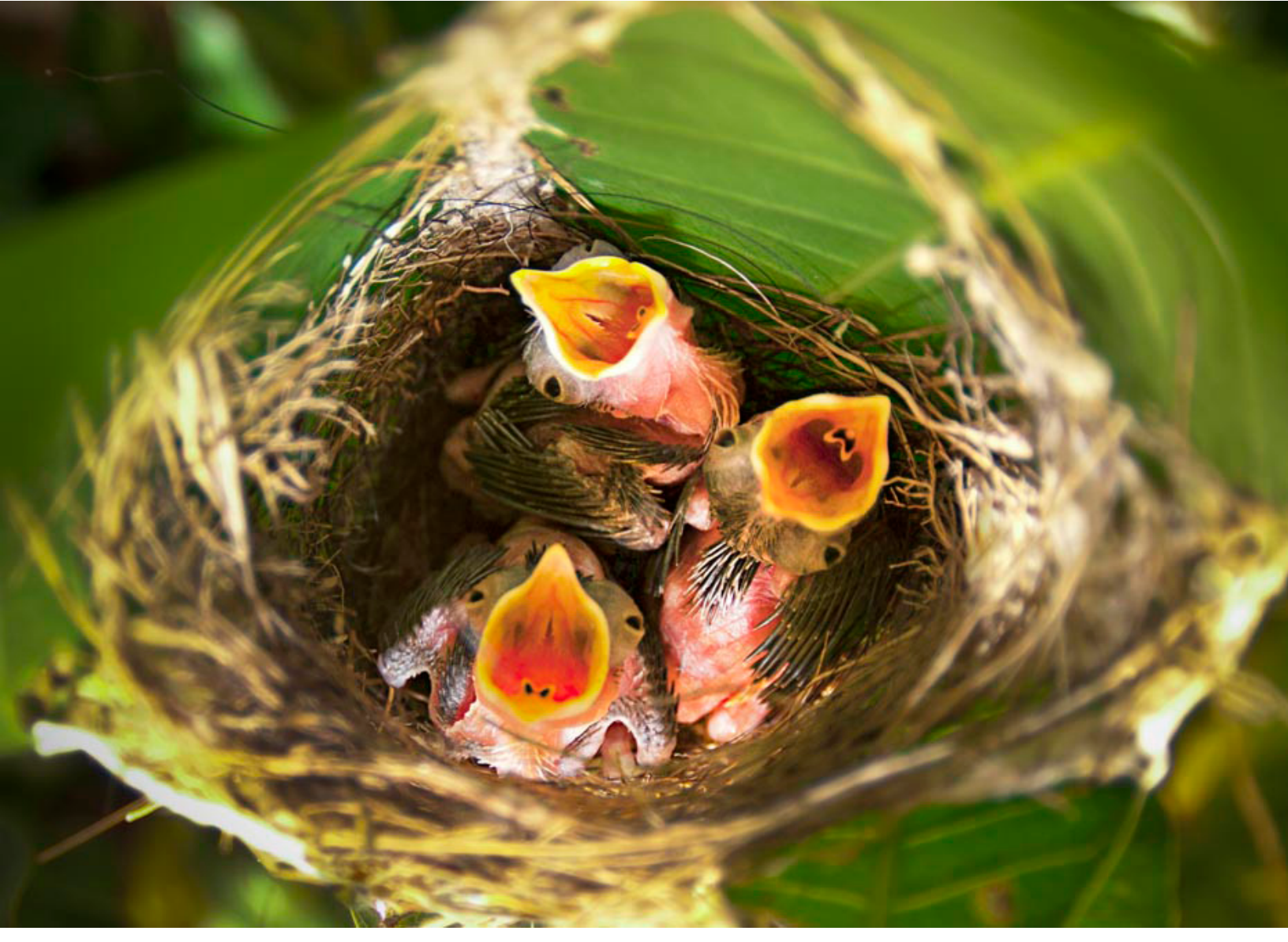
Baby Birds in Nest