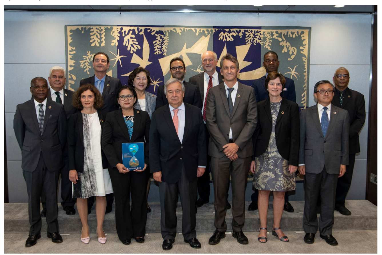
A panel of independent scientists authored the GSDR, with support from a UN DESA-led UN-System Task Team.

UN DESA has continued to support the important work of the ECOSOC High-level Segment, in its focus on future trends and scenarios. To support the discussions in the 2020 Segment UN DESA prepared a report on Accelerated action and transformative pathways: realizing the decade of action and delivery for sustainable development. UN DESA's report on Long-term future trends and scenariosimpacts in the economic, social and environmental