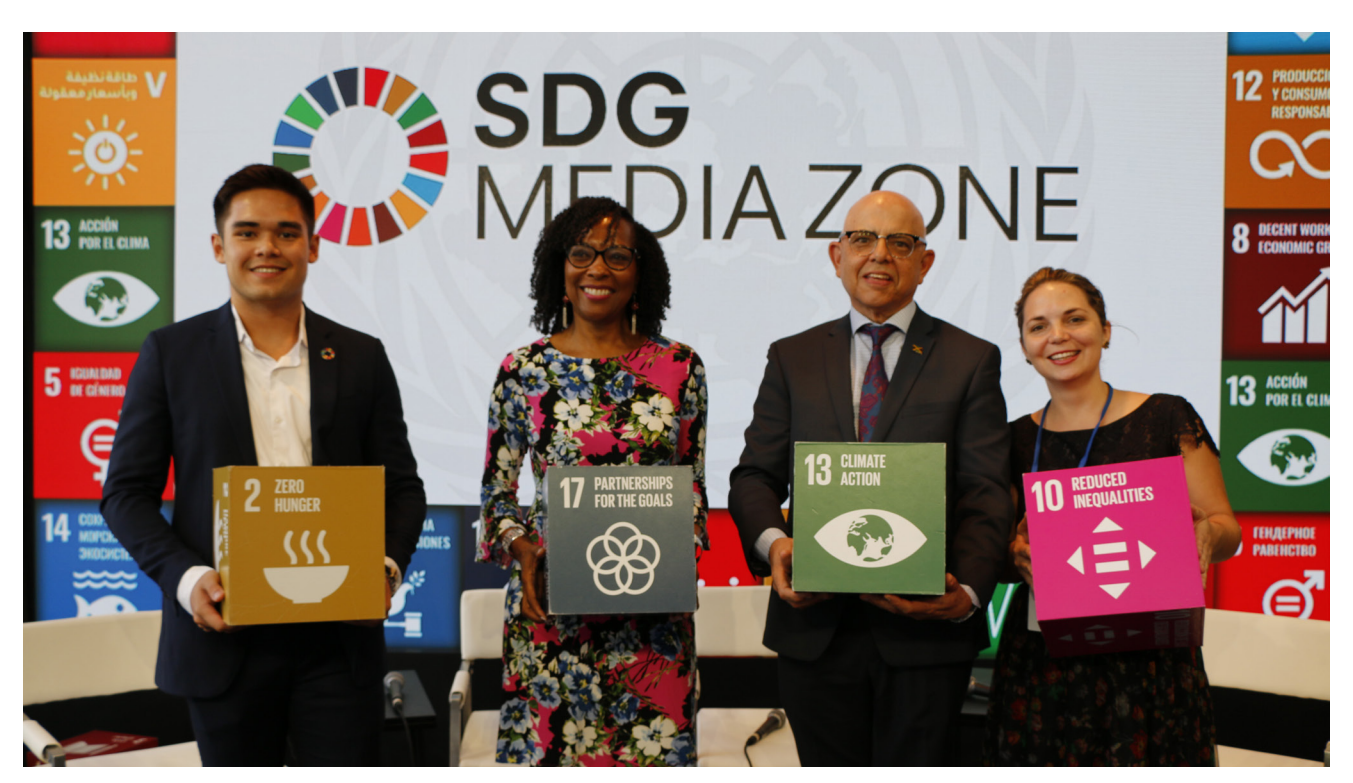
Representatives of the Caribbean Philanthropic Alliance, a regional partnership for SDG implementation, announce their initiative in the SDG Media Zone on the margin of the UN General Assembly on 27 September 2019.

The achievement of the 2030 Agenda will require an unprecedented level of cooperation and collaboration among all levels of government, civil society, businesses, foundations, academia, and others, and finding new ways of working. Through its normative, analytical and capacity-building work, UN DESA continues to engage diverse stakeholders at all levels around the follow-up and implementation of the 2030 Agenda and to provide platforms – both in person and virtual - to discuss and foster multi-stakeholder partnerships in support of the SDGs.