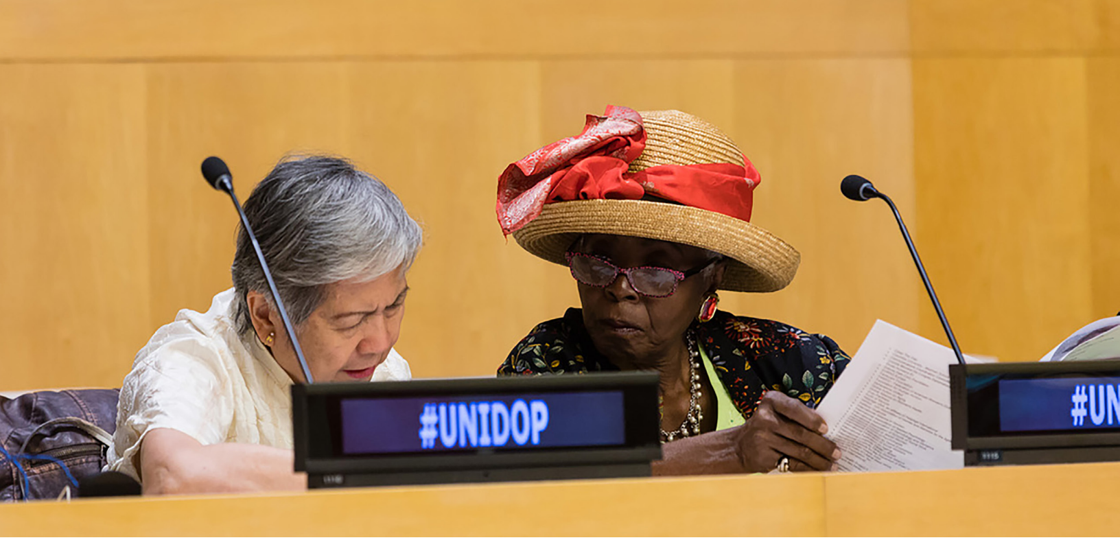
Participants at the International Day of Older Persons 2019.

technologies can be used to help youth succeed. The report offers policy guidance for developing enabling, responsive and sustainable national ecosystems for young social entrepreneurs.