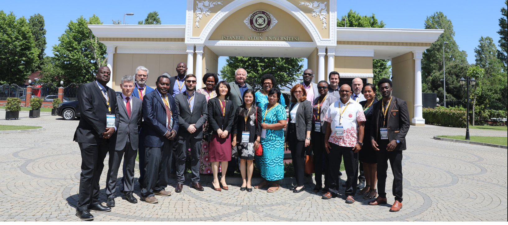
Training Workshop on Cooperative Healthcare, Istanbul, 21-23 May 2019 - UN DESA and Istanbul Aydin University

Protection, aims to assist Cambodia and Pakistan in improving their social protection systems. In 2019, Cambodia proposed a more comprehensive social security system, which is currently with Parliament for approval. UN DESA trained civil servants in the country on governance and management of their social protection system.