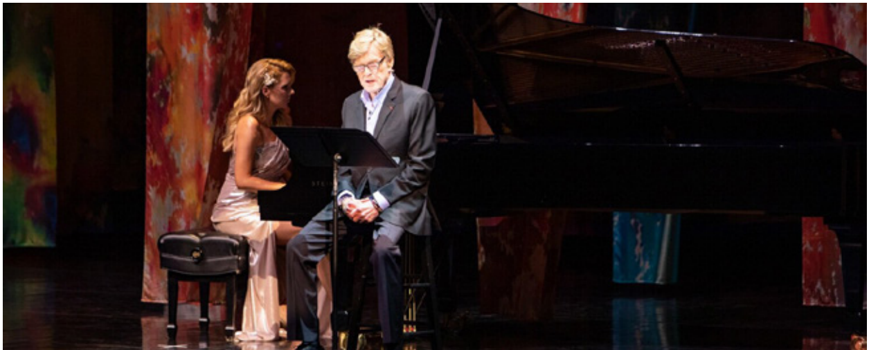
Robert Redford's Spoken Word at The Way of the Rain performance on 26 August 2019.