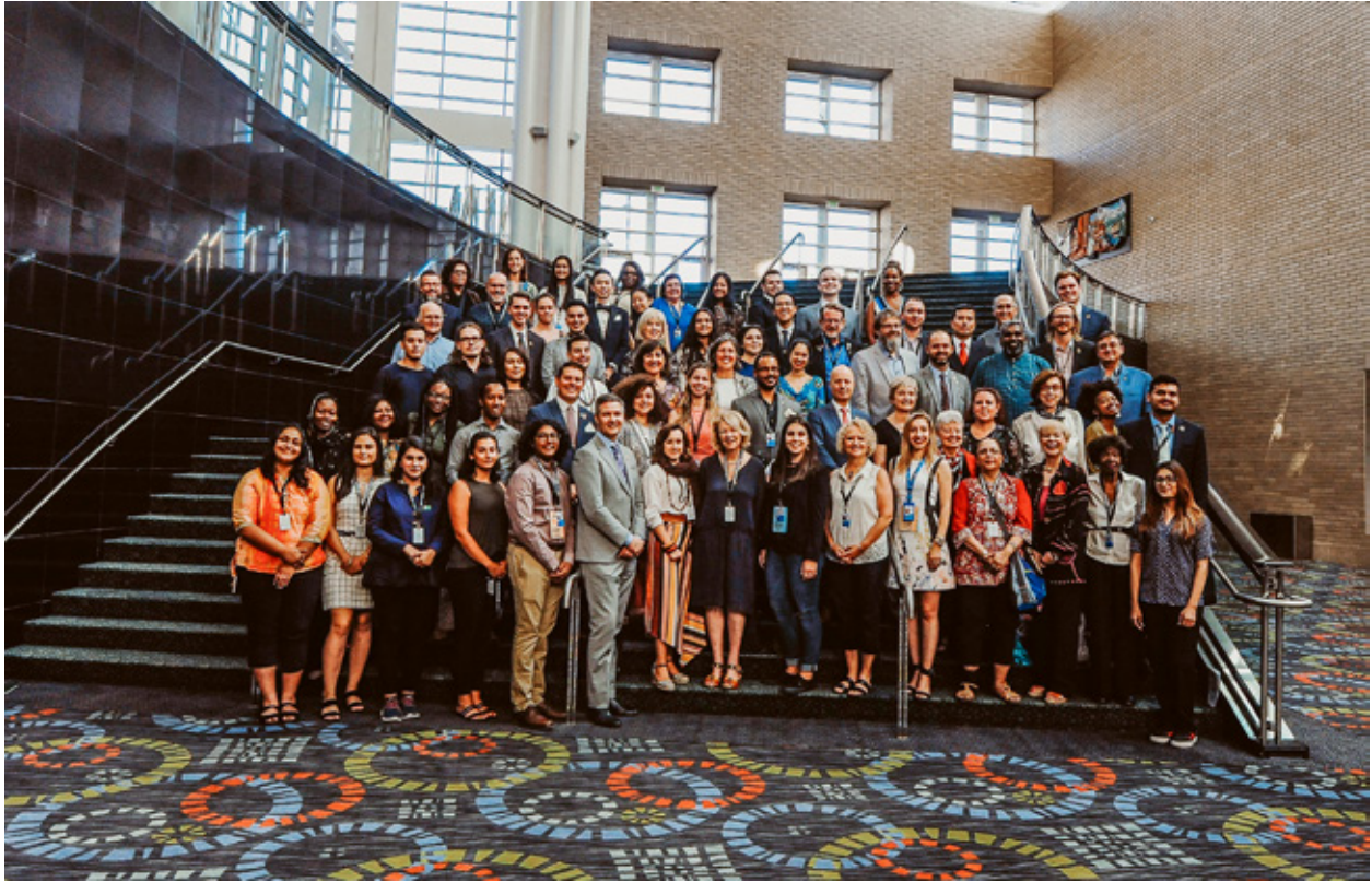
40 Planning Committee of the 68th UN Civil Society Conference.