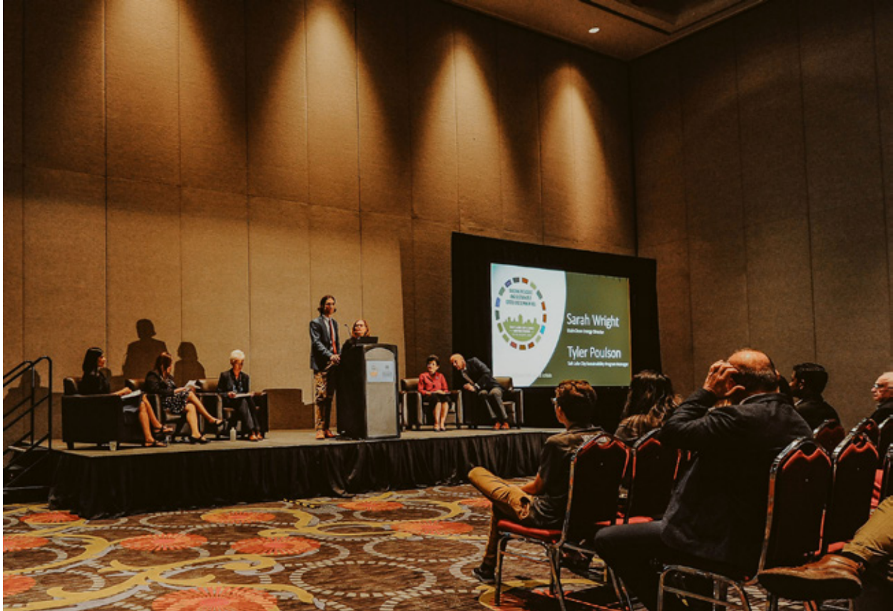
Panelists of the Thematic Session “Local and Regional Governments Leading the Way to Sustainable Communities”.