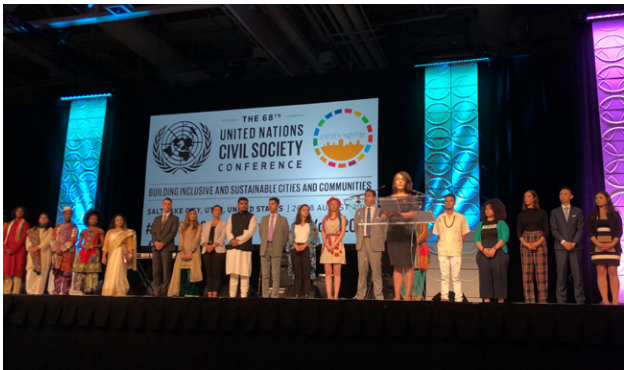
Civil Society Youth Representatives Reading the Youth Climate Compact at the Closing Plenary Session of the 68th UN Civil Society Conference.