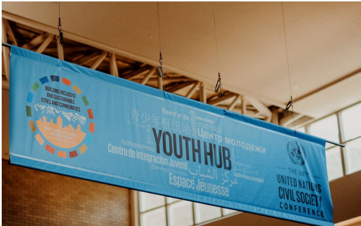
Sign of the Youth Hub at the 68th UN Civil Society Conference.