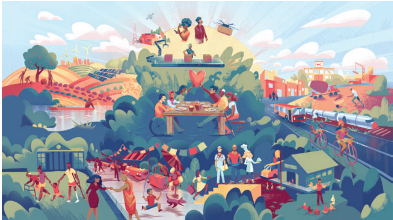
The visual component of the 68th UN Civil Society Conference Outcome presented in an animation. With thanks to Digital Gravy