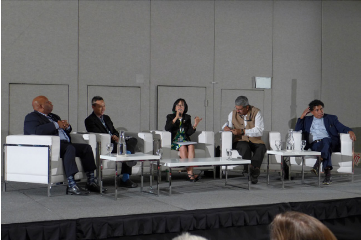
Thematic Session “Building Inclusive Communities Through Education”.

Mr. Damodaran noted two important phrases are often used in the United Nations realm: 1. The dignity and worth of the human person. 2. Unite our strength. We begin with the individual and then combine our strength to make great accomplishments. How does education fit into this? The UN is rich in the use of acronyms. When he saw the word “UTAH,” he said he thought it might stand for: “Unleashed Truth and Hope.” Truth and hope are the two things we need today which education can provide -- truth in what is and can be, to counter ignorance, error, deception and hate; and hope for progress and a better future.