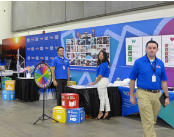
Exhibit of We Love U Foundation at the 68th UN Civil Society Conference.