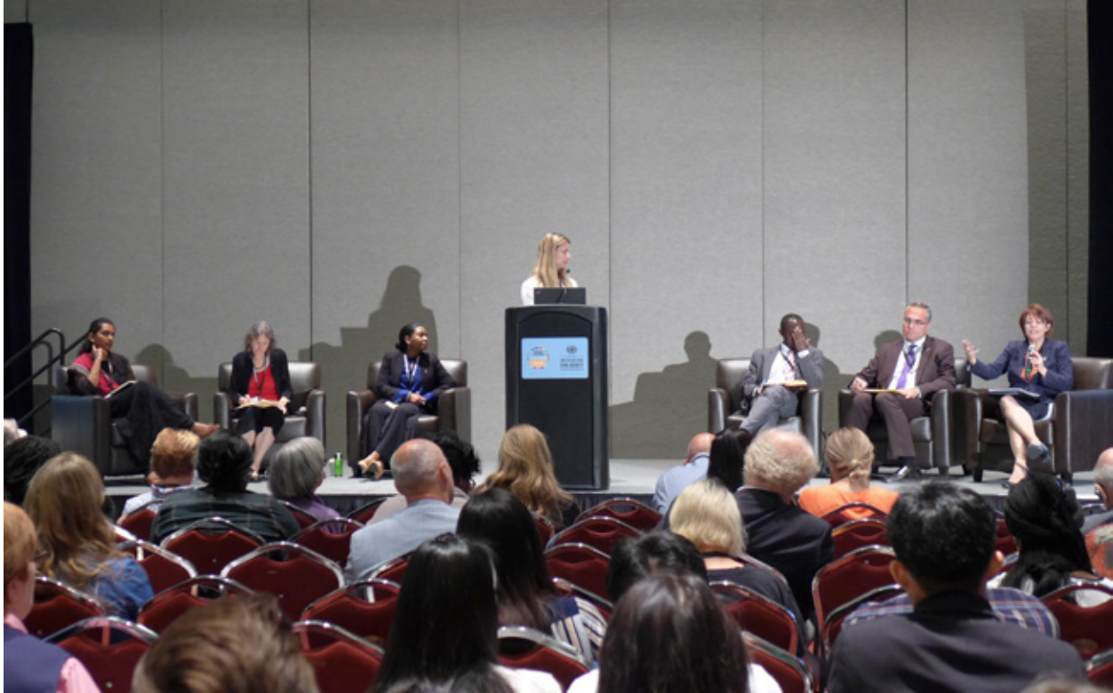
Thematic Session “Enhancing the Role of Civil Society to Monitor Implementation of SDG 11”.