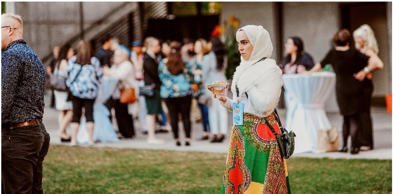
Reception organized by the City of Salt Lake for the participants of the 68th UN Civil Society Conference.