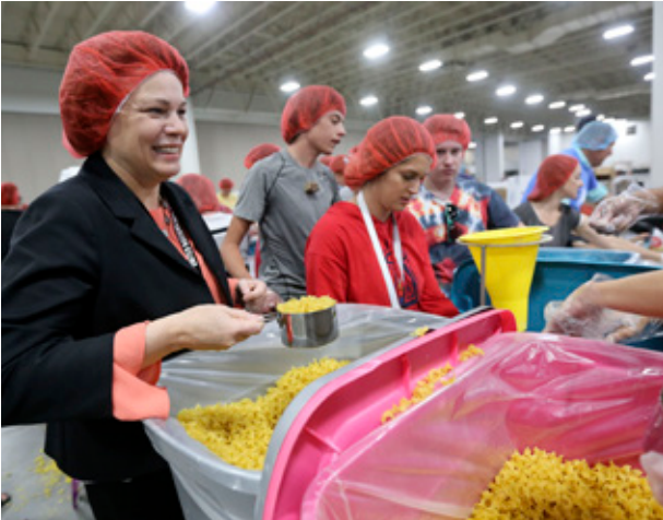
Sister Sharon Eubank, first counselor in the Church of Jesus Christ of Latter-day Saints Relief Society General Presidency, packages pasta dinners for a service project during the 68th United Nations Civil Society Conference at the Salt Palace Convention