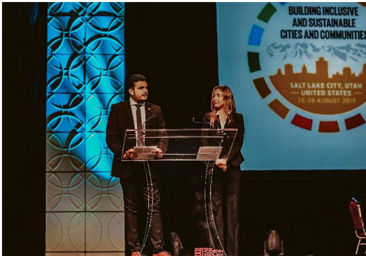
Civil Society Youth Representatives Reading the Youth Climate Compact at the Closing Plenary Session of the 68th UN Civil Society Conference.