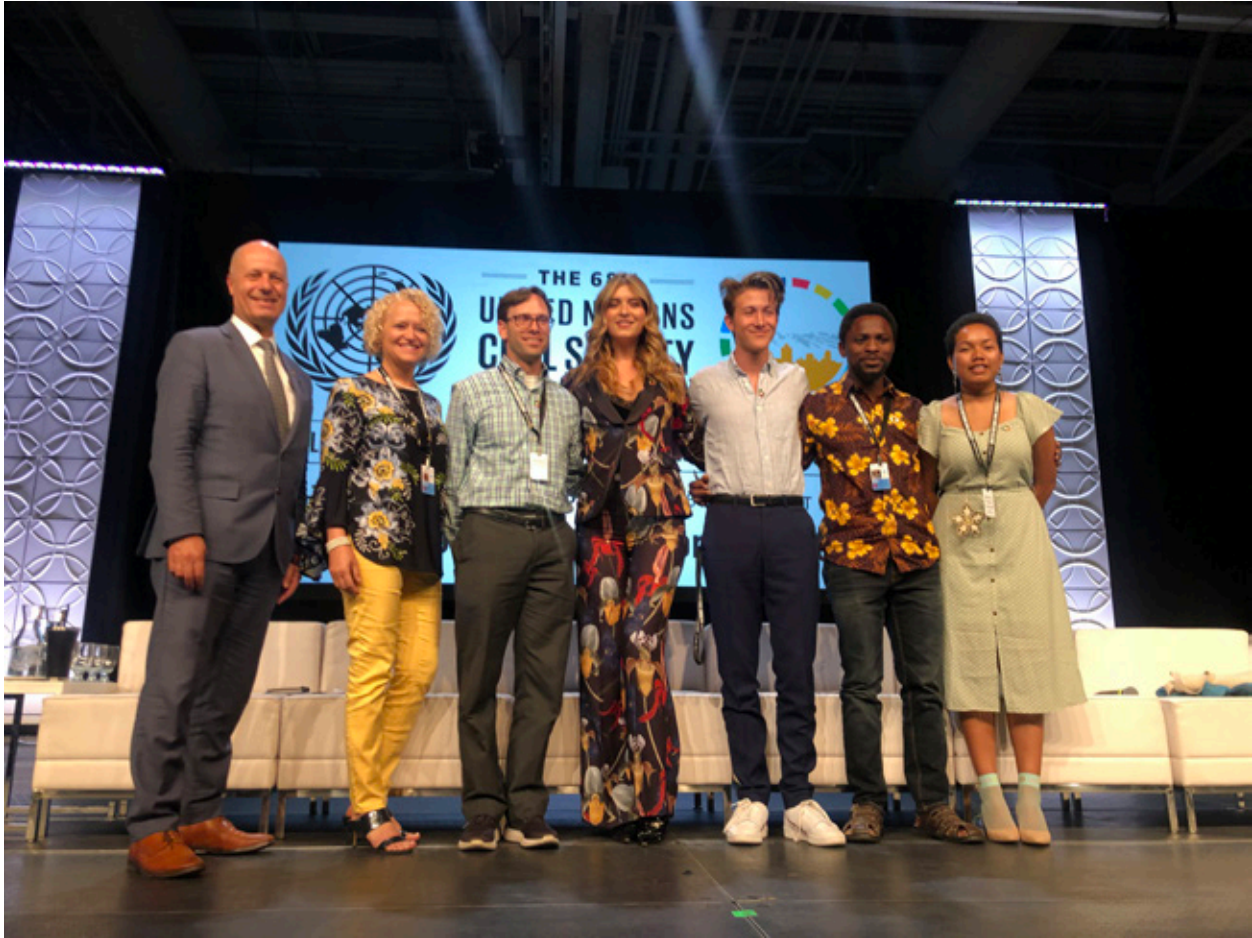
Panelists of the Thematic Session “Climate Change - Cities and Communities in Action.”