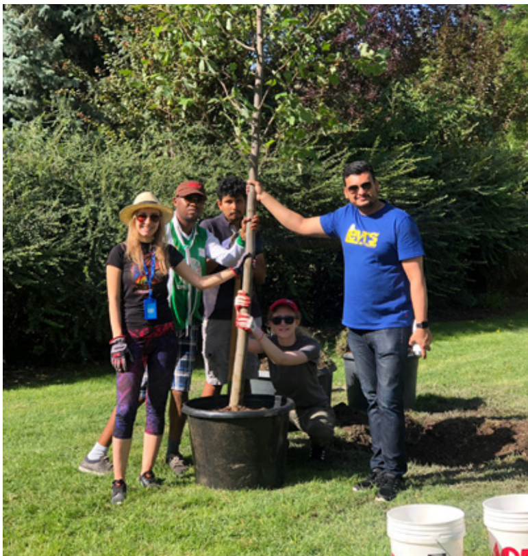
Pre-Conference Activity - Tree Planting, 24 August