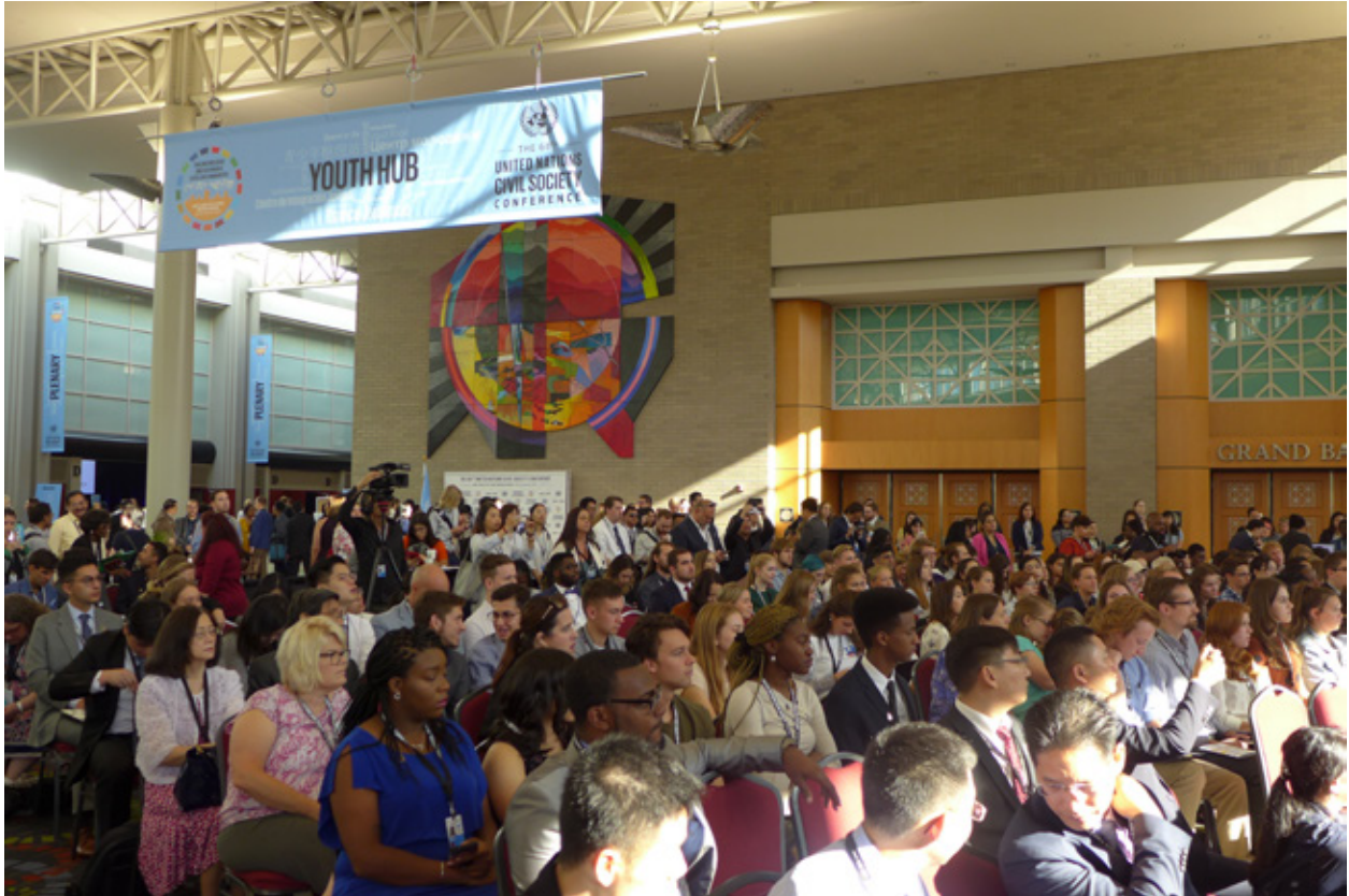
Audience at the Youth Hub of the 68th UN Civil Society Conference.