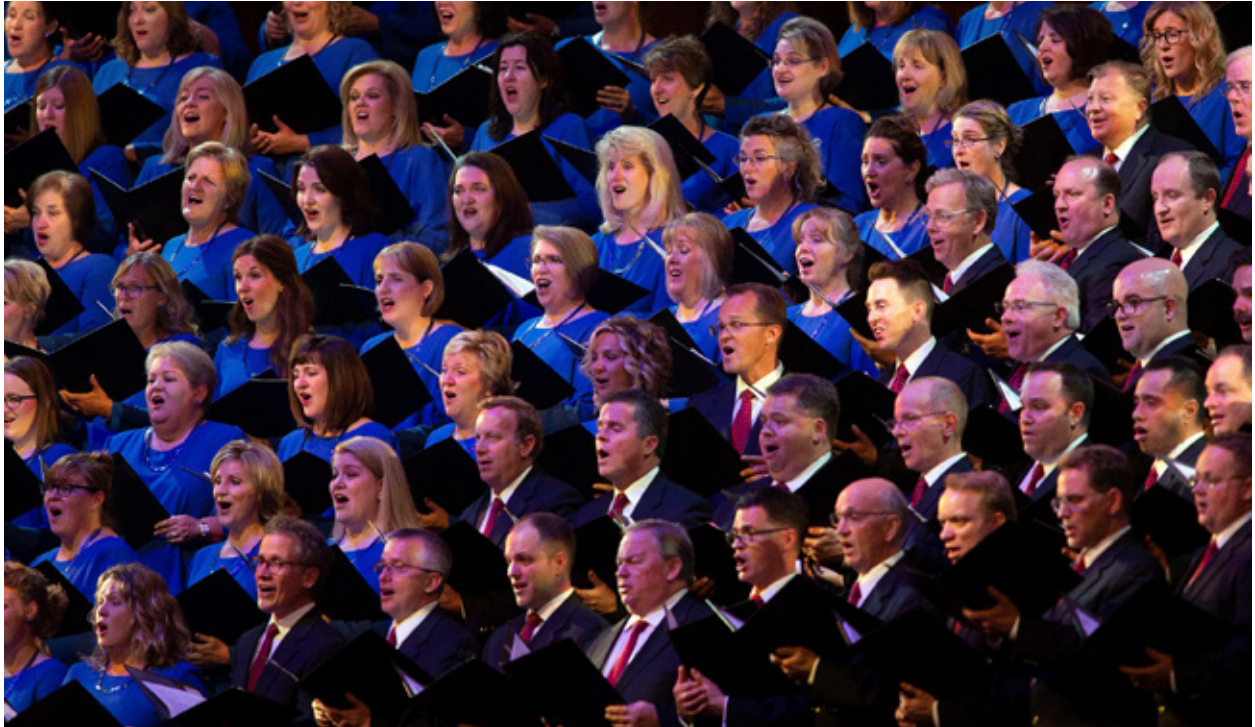
The Tabernacle Choir and Orchestra at Temple Square perform a concert for people attending the 68th United Nations Civil Society Conference in Salt Lake City, August 27, 2019.