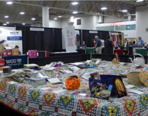
Exhibit at the 68th UN Civil Society Conference.