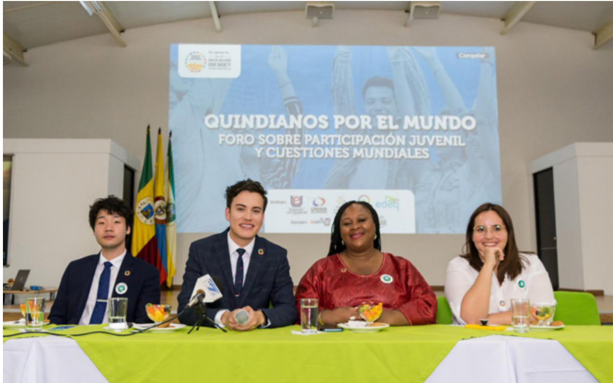
Youth Participation Colombia Pre-Conference.