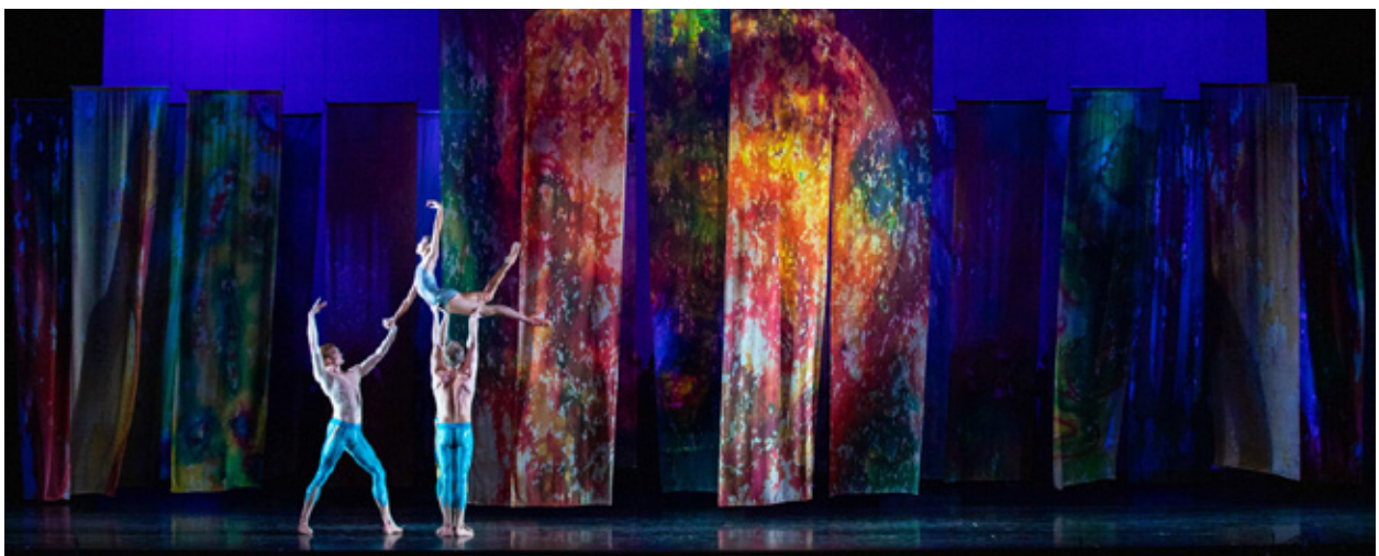
The Way of the Rain performance on 26 August 2019.