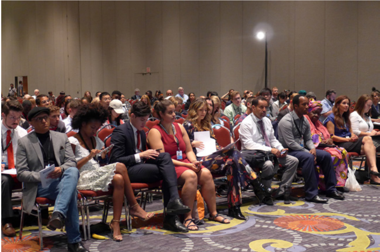
Audience at the Youth-led Thematic Session “Creating Opportunities and Economic Success for Youth.”

for marketing or influencing, for example, whereas youth wield these tools to great effect in influencing ideas and creating constituencies.