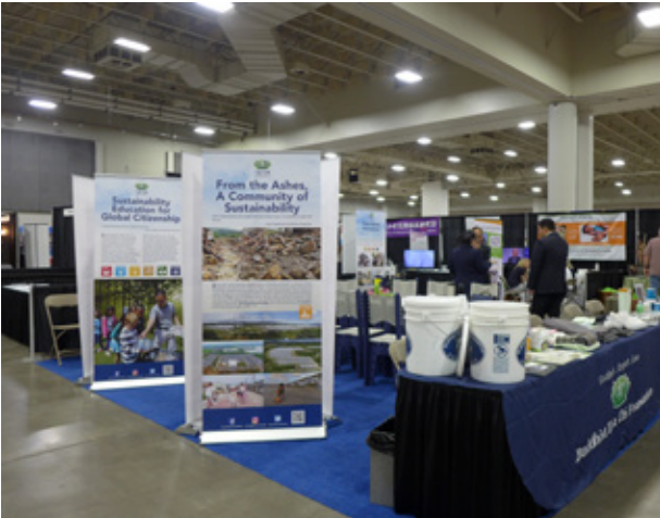
Exhibit of Tzu Chi Foundation at the 68th UN Civil Society Conference.

☰ Click here for a complete list of exhibits.