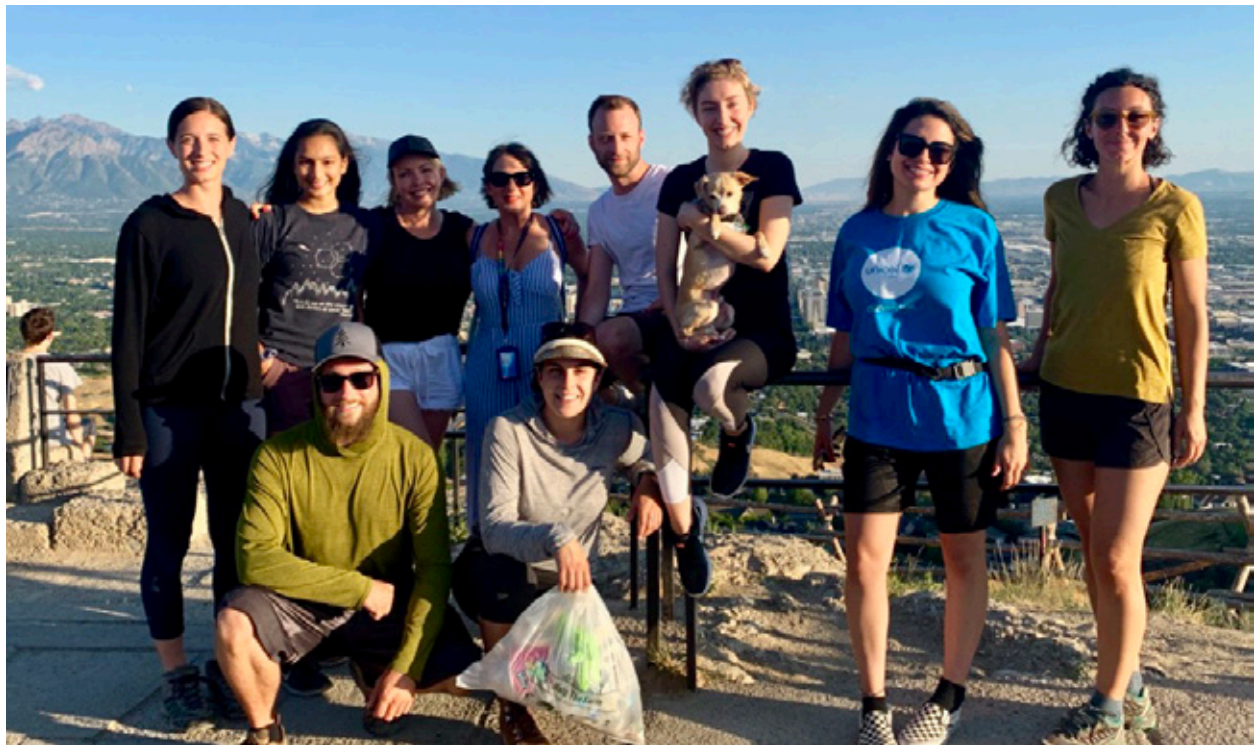
Salt Lake City Hike and Clean-up, 20 June.