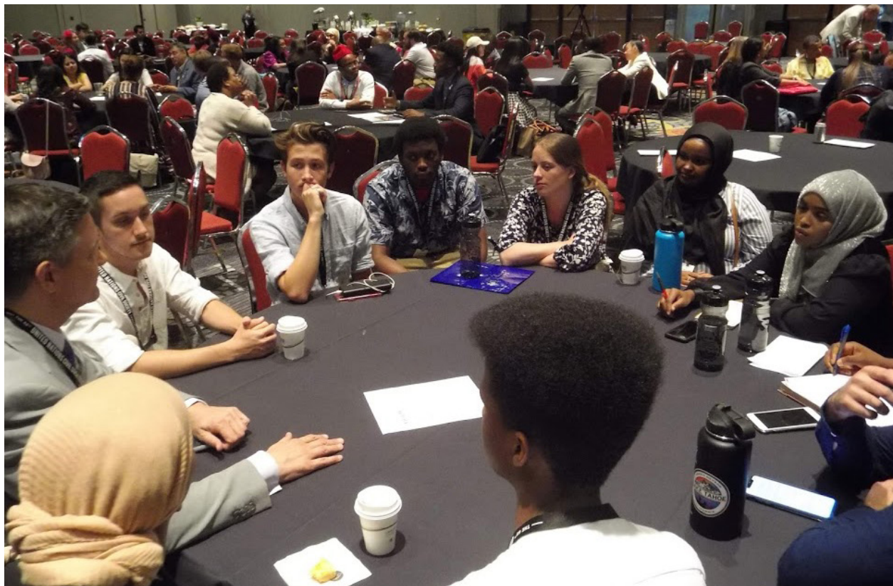
Youth Leadership Circles.