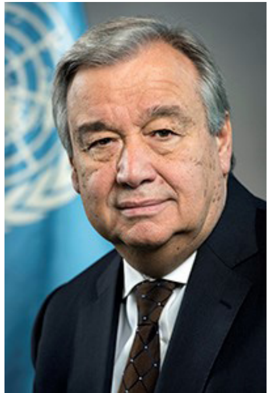
United Nations Secretary-General, António Guterres.

I am pleased to greet this United Nations Civil Society Conference. I welcome your conference focus on building inclusive and sustainable cities and communities. Well planned and managed cities can steer us towards inclusive growth and service models of harmony among diverse people. Cities are also well placed to help combat the global climate emergency and point the way towards sustainable low emission development. The United Nations and I look to you for ideas and solutions and we will also continue to stress the vital role of civil society in solving all global challenges especially at a time when civic space is shrinking worldwide, and intolerance is on the rise in the spirit of strong partnership. I wish you a fruitful conference, thank you.