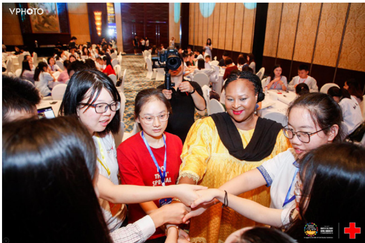
China Pre-Conference Youth Forum, Chengdu, Sichuan Province.

Following the conclusion of the conference, the Youth Climate Compact served as the basis for the programming of the SDG Action Zone, held on the margins of the September UN Youth Climate Summit and UN Climate Action Summit 2019. COP 25 also provided a platform to further expose young people and their constituencies the pledges of the Compact. Plans are now underway to follow up action on how the Compact is being further shared and implemented. Moving forward, it is hoped that the Compact will serve as a viable framework to engage youth on climate action within their networks and in local actions.