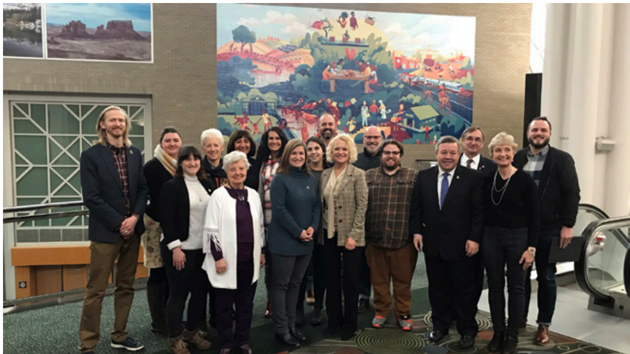
The illustration of the Outcome Statement of the 68th UN Civil Society Conference was presented as a mural now displayed in the Salt Palace Convention Center on 30 December 2019, where it will be on permanent display.

We thank the people and the governments of the United States of America, the State of Utah, and Salt Lake City for the kind welcome and gracious hosting they have given to the 68th United Nations Civil Society Conference and for their efforts to achieve the United Nations Sustainable Development Goals.