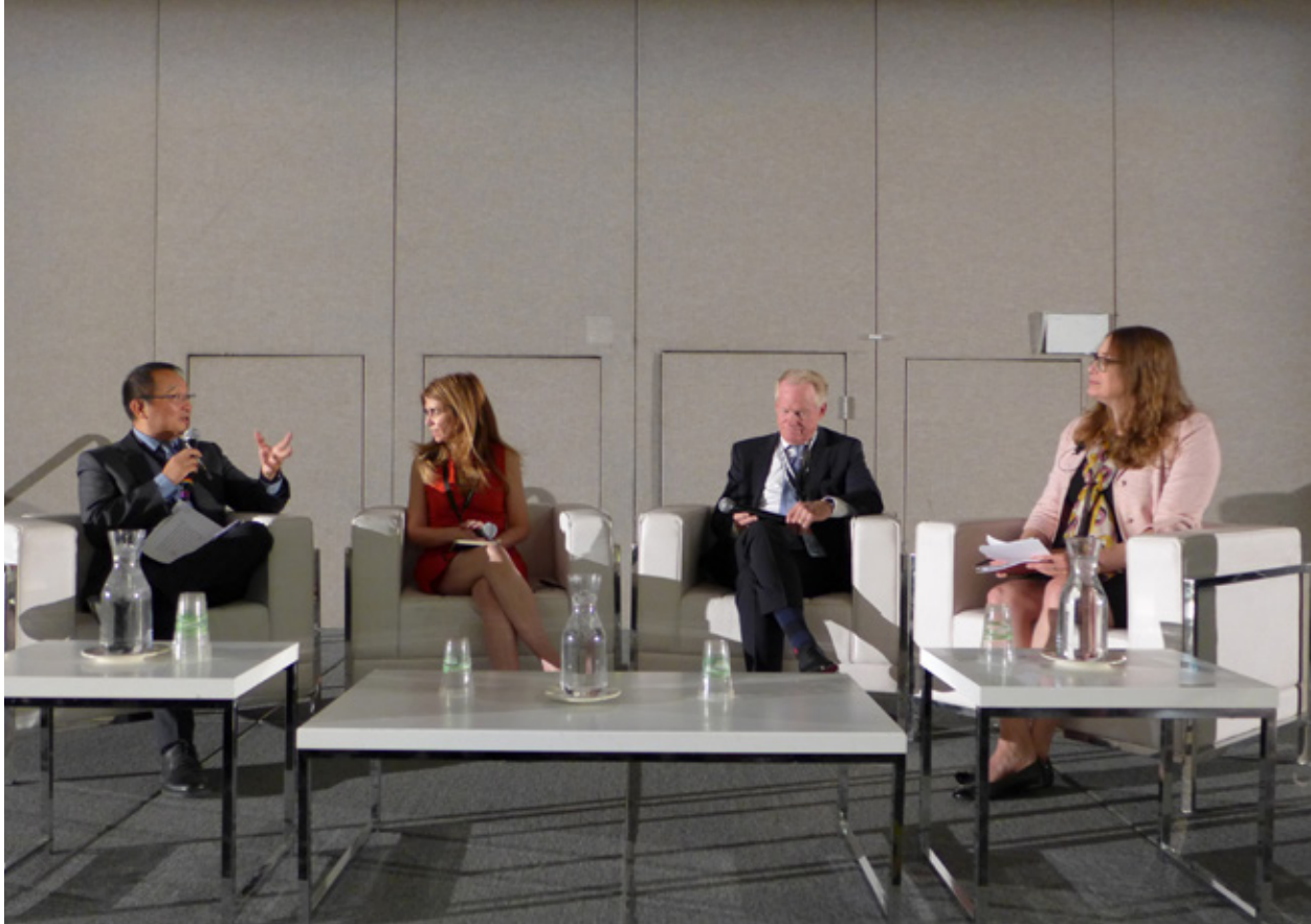
Thematic Session “Impact Investing: Financing the SDGs”.