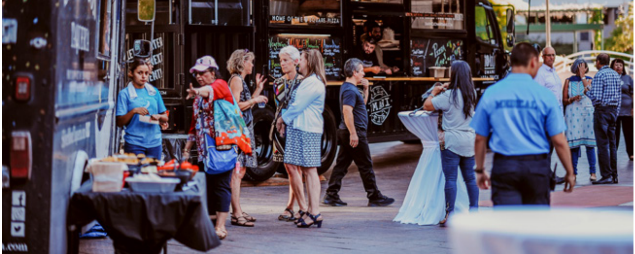
Reception organized by the City of Salt Lake for the participants of the 68th UN Civil Society Conference.