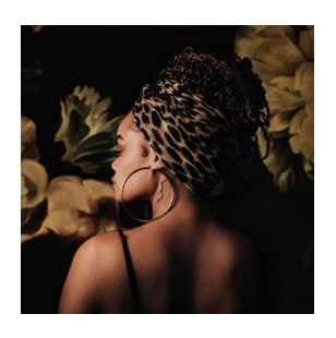
Andra Day Award-winning Singer, Songwriter, Actor, and Advocate for the COVID-19 response.

Rise up. Because anything is possible – <u>68 million views</u> since this powerhouse released Rise Up in 2015.