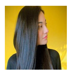
Muniba Mazar<u>i</u> National UN Women Ambassador, Pakistan