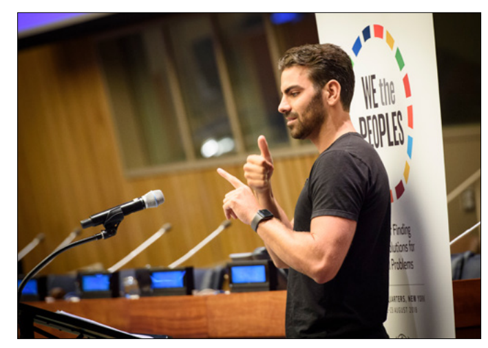
Mr. Nyle DiMarco, Model, Actor and Deaf Activist, addresses the participants at the Opening Plenary Session.

education system. He emphasized the importance of validating the needs and experiences of people with disabilities and empowering them to shape their societies. He argued that limited access to education leads to limited access to employment, resulting in social exclusion. Young people who are facing exclusion lack a means for employment opportunities. Therefore, he said, our duty as global citizens is to consider the needs of those with disabilities. In conclusion, he condemned the marginalization of people with disabilities and urged greater inclusion.