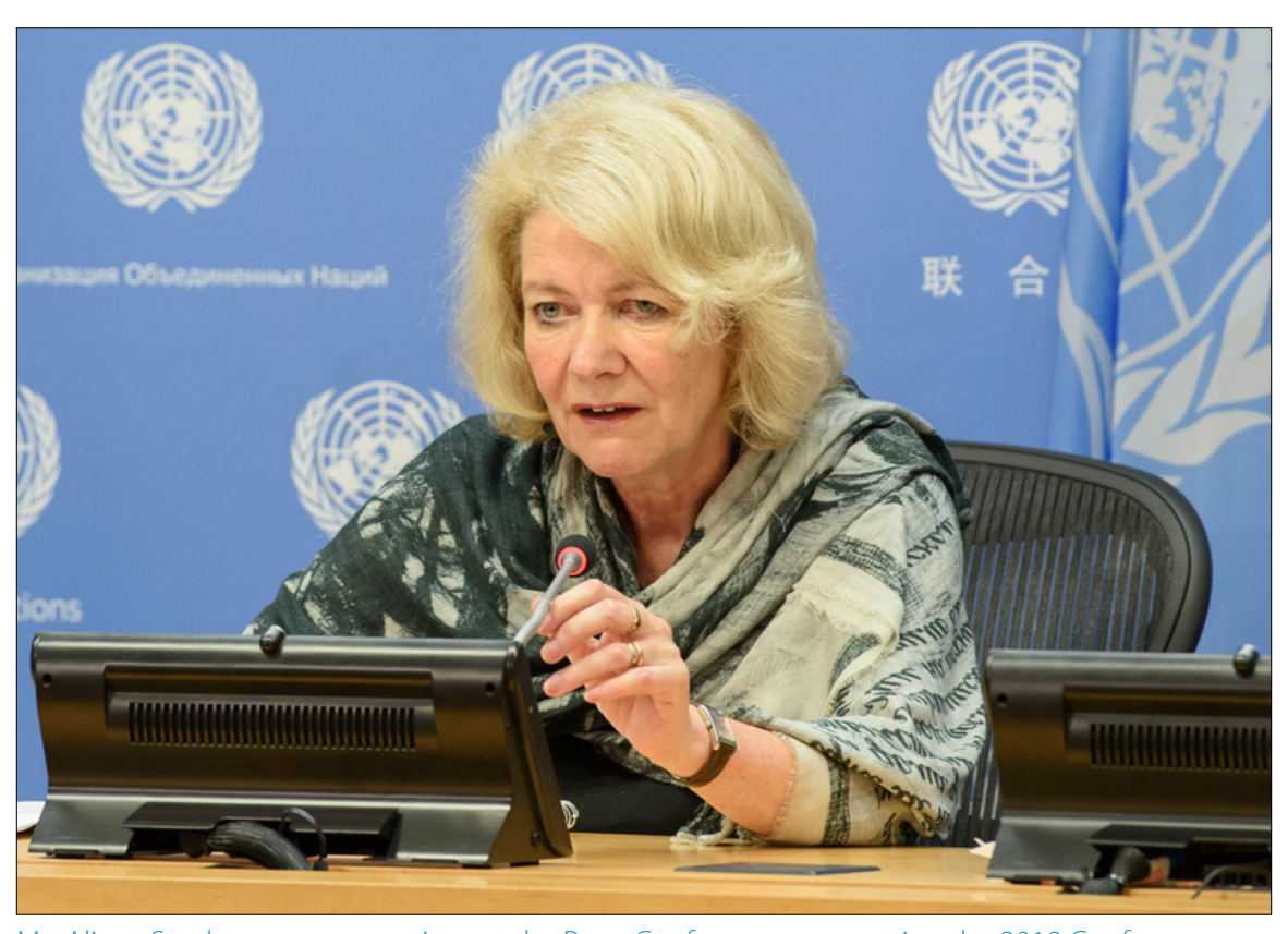
Ms. Alison Smale, answers questions at the Press Conference announcing the 2019 Conference that took place directly following the conclusion of the 67th UN DPI/NGO Conference.

This year we, and our civil society co-hosts, the NGO/DPI Executive Committee, felt it was appropriate and indeed crucially necessary to face head-on the skepticism about the value of multilateralism that we have seen in some countries, and to explore what the UN can do to better live up to the promise of its Charter. The title of the conference, "We the Peoples...Together Finding Global Solutions for Global Problems," expressed the