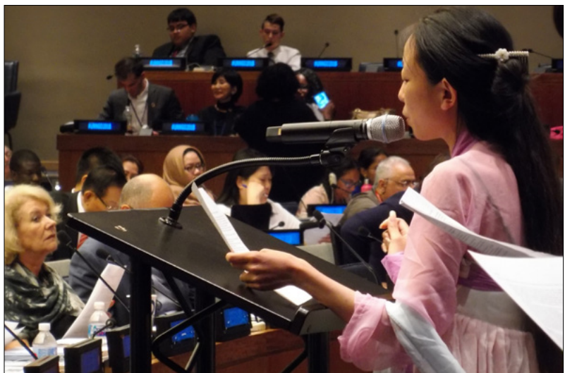
Participants of the Youth Hub session during the 67th UN DPI/NGO Conference.