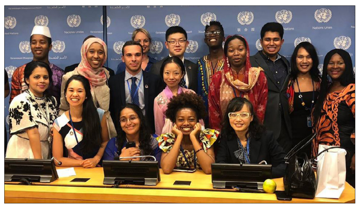
Youth Participants and Members of the NGO Youth Steering Committee following the press conference at the end of the 67th UN DPI/NGO Conference.

Over one-third of participants at the 67th UN DPI/NGO Conference were youth and young people played a leadership role in planning this conference as well as molding