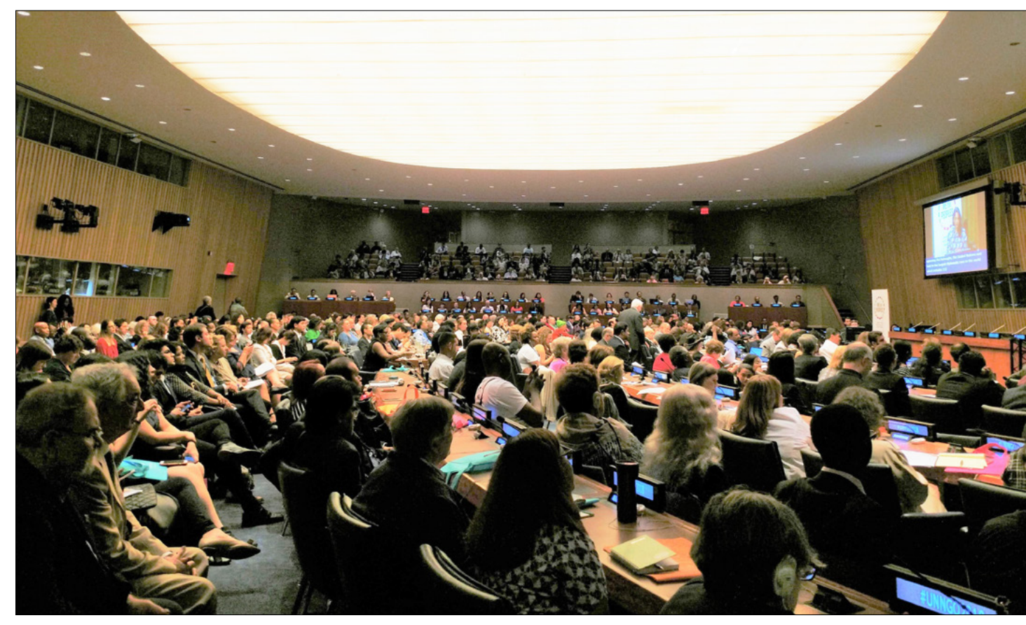
View of Conference Room 4 during the Opening Plenary Session of the 67th UN DPI/NGO Conference.

by the voices of ordinary people. This work, she stated, means that NGOs must push against governments and other powers, when necessary, and refuse to be relegated to the role of cheerleaders of government. While acknowledging that NGOs focus on different problems, she also noted that there are many challenges they share, including increasingly extreme politics and governments' attempts to limit the voice of the people. She paid tribute to the late Kofi Annan and the humility and humanity of his leadership style. Finally, she emphasized the importance of NGOs pushing for justice and peace.