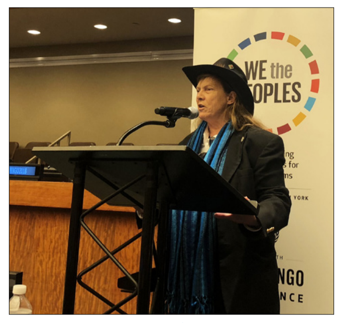
Ms. Hunter Lovins, Founder of Natural Capitalism Solution, speaks during the Opening Plenary session of the 67th UN DPI/NGO Conference.

Ms. Hunter Lovins, Founder of Natural Capitalism Solutions, had three points in her address: the severity of the climate crisis, civil society's capacity to solve it, and the need to create a new story. She argued that the elimination of subsidies on fossil fuels and the increased usage of sustainable energy sources is possible,