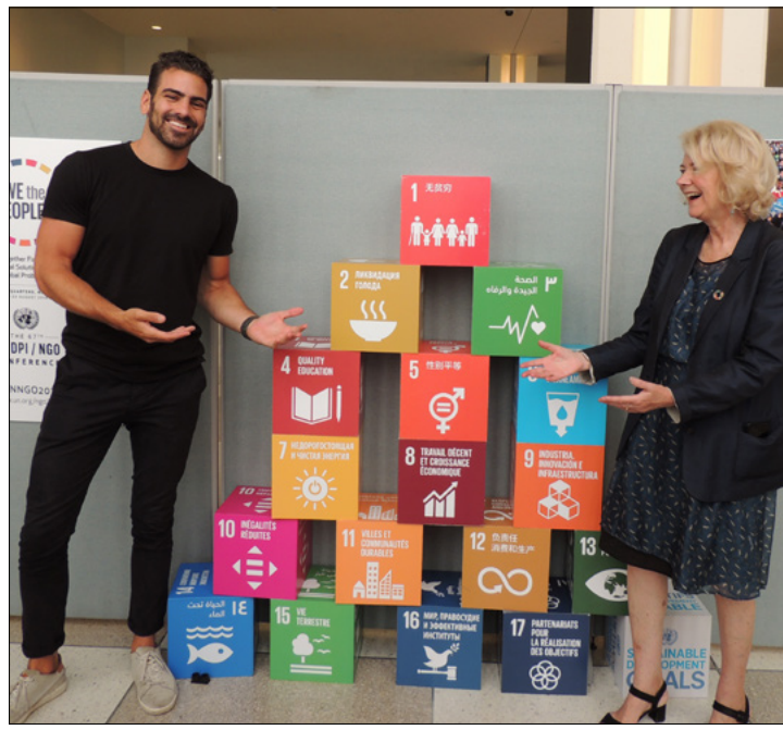
Nyle DiMarco, American Model, Actor and Deaf Activist and Alison Smale, Under-Secretary-General for Global Communications at the Conference Youth Hub promoting youth involvement with the UN Sustainable Development Goals (SDGs).