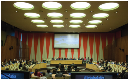
ECONOMIC & SOCIAL COUNCIL