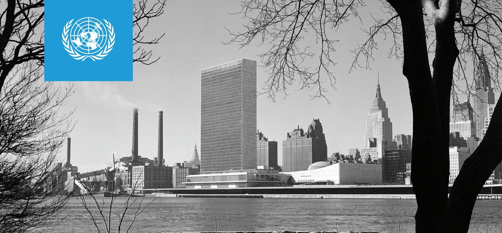
United Nations Headquarters, 1960