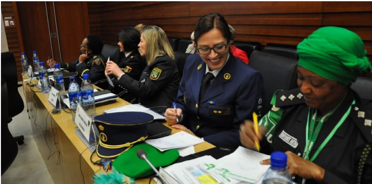
First Female Police Commanders Course, 3rd – 8th December 2017

This policy brief has outlined the opportunities for the digital inclusion of women in Africa's WPS Agenda, be it for preventative measures and early engagement to facilitating effective mobilisation that holds the potential to lead to political change towards peace. There have also been calls for the WPS Agenda to be less traditional in its thinking of security and be more conscious that emerging and new technologies also mean a need for more deliberate efforts towards improving cybersecurity. This is particularly important as surveillance and spying technology development will significantly impact the extent to which digital inclusion of women can be achieved. Whilst technologies like AI, Machine Learning,