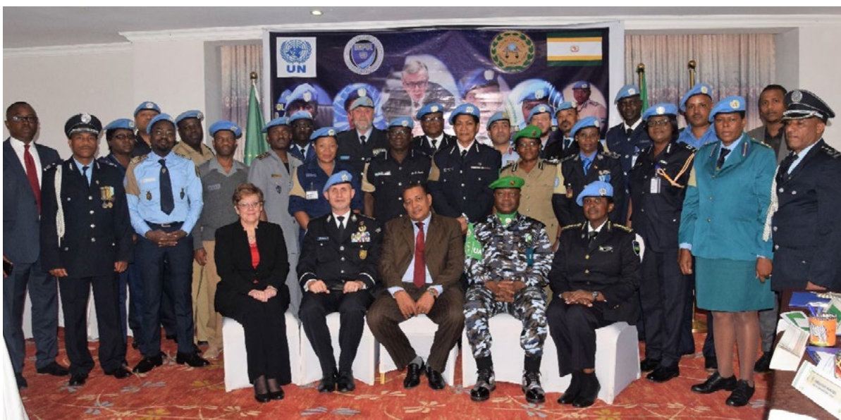
Heads of UN missions police chiefs meet in Addis Ababa at the 3rd Heads of Police Components retreat. 31 July – 2 August 2018.

Since the four pillars were established in 2000, initiatives such as Safe Cities and Safe Public Spaces for Women and Girls have emerged using digital tools as one of the implementation methods in local communities. In Maputo, Mozambique, school girls and boys have held workshops to discuss critical issues around making the city safe for women and girls. Following this activity, social media was used to promote the voices and suggestions of schoolchildren and policy changes to support new safety measures. Using social media made these suggestions public, increased