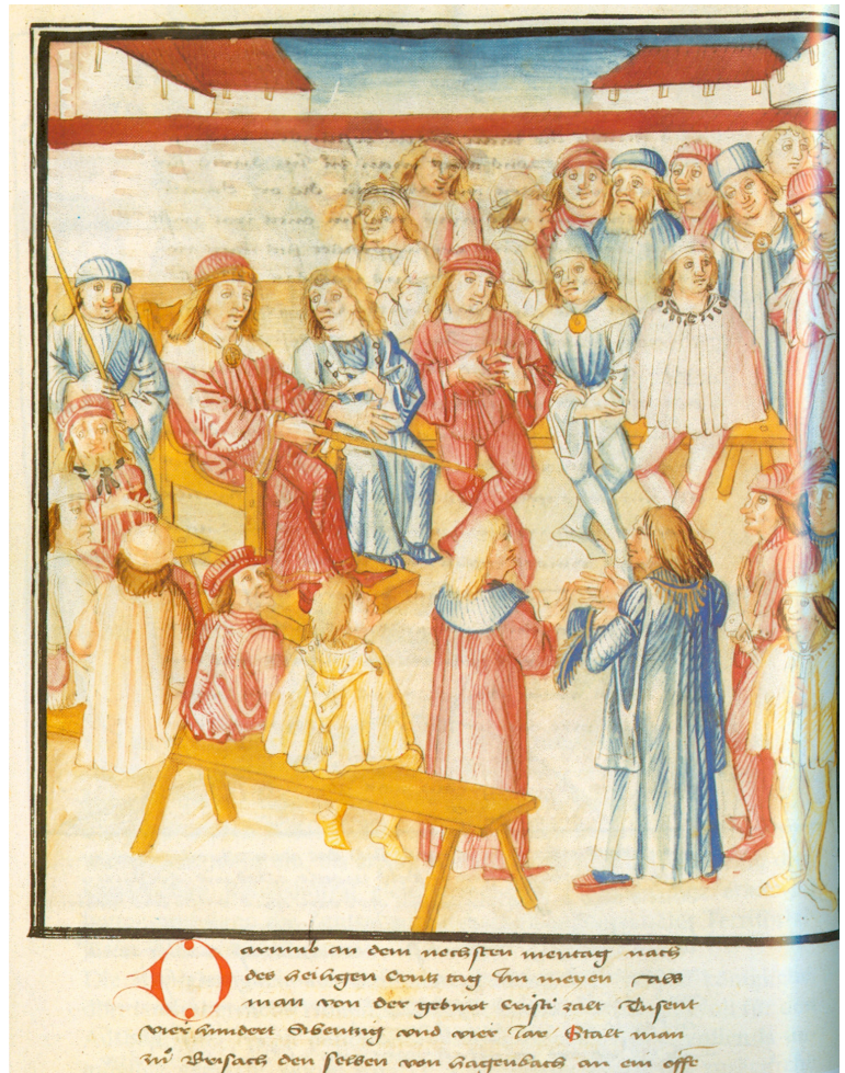
The first Trial for Sexual Violence in Conflict was likely 1474