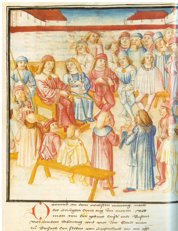
The first Trial for Sexual Violence in Conflict was likely 1474