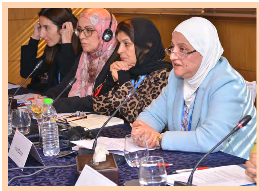
IDLO and the European Bank for Reconstruction and Development (EBRD) convened a forum in Morocco in December 2017 to lay the foundations for the first regional network for women judges.

At present, it is widely understood that countries with civil law legal systems are more open to female judges than common law inspired legal systems.