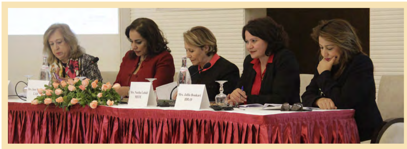
A regional workshop co-organized by IDLO brought together female judges, lawyers and academics in Sousse, Tunisia to discuss women's effective participation in justice delivery and policy making across the Middle East and North Africa region.

More broadly, improvements in women's numbers on the judiciary – an institution held in high esteem in many societies – may, in some cases, have a domino effect in that it contributes to women's entrance into other professions of authority. By challenging the institutional barriers to women holding positions of authority, such judges set the mark for other previously male-dominated professions, as poignantly explained when describing the impact of women judges in Brazil: "the simple fact of being a woman and a judge has important social consequences as it makes the female judge a point of reference for other women, especially in less developed districts, where problems of feminine submissiveness are more prevalent". 19 In short, by their presence in the judiciary, women judges play distinct roles as agents supporting women's economic independence and more broadly, social change. The presence of women moves society away from the mindset that men are the norm and that justice is not a job for women.