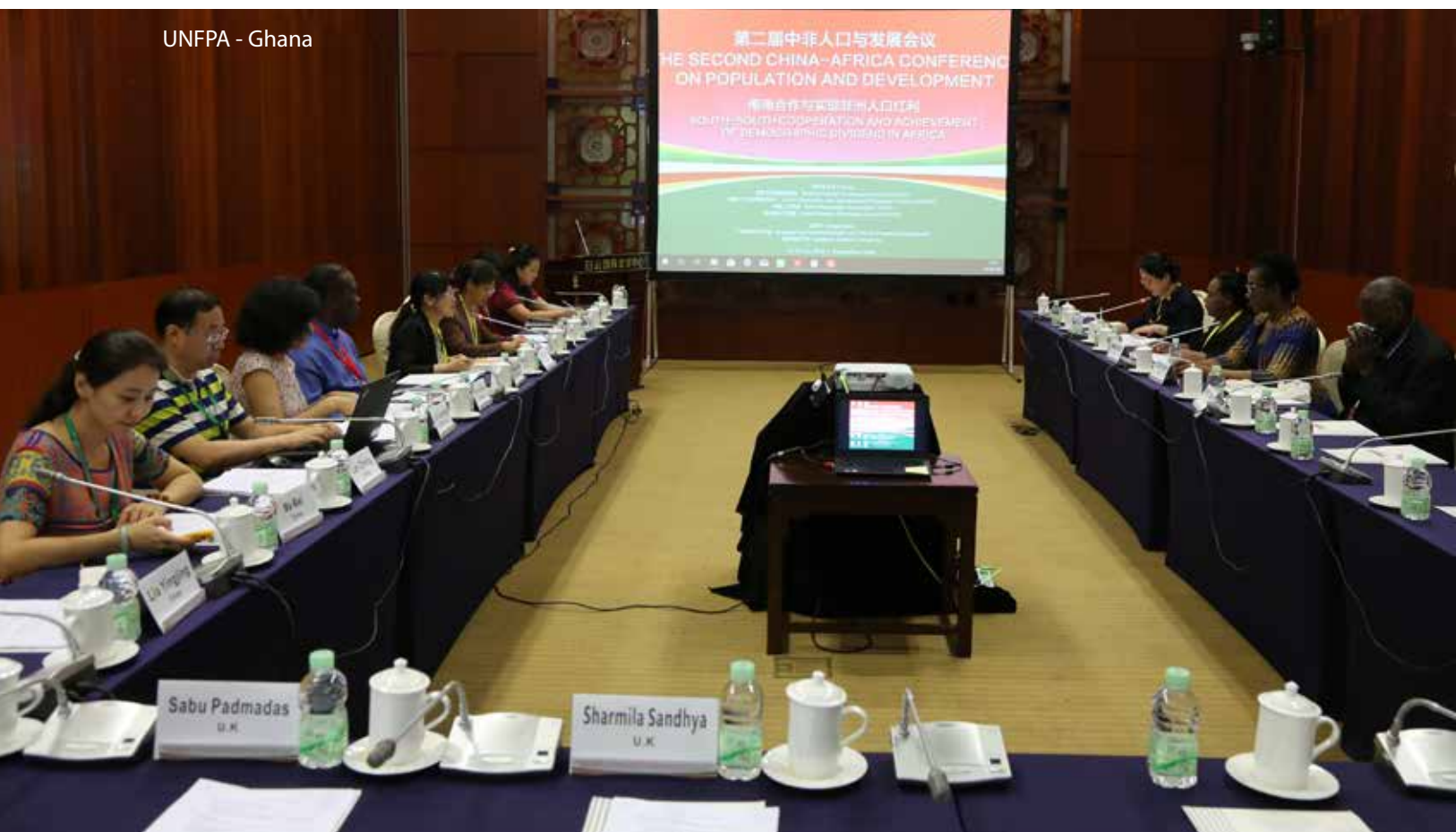
UNFPA - Ghana

Cooperation between Ghana and China, with support from UNFPA, started in 2014 and was aimed at demographic data collection, application, research and training on statistical