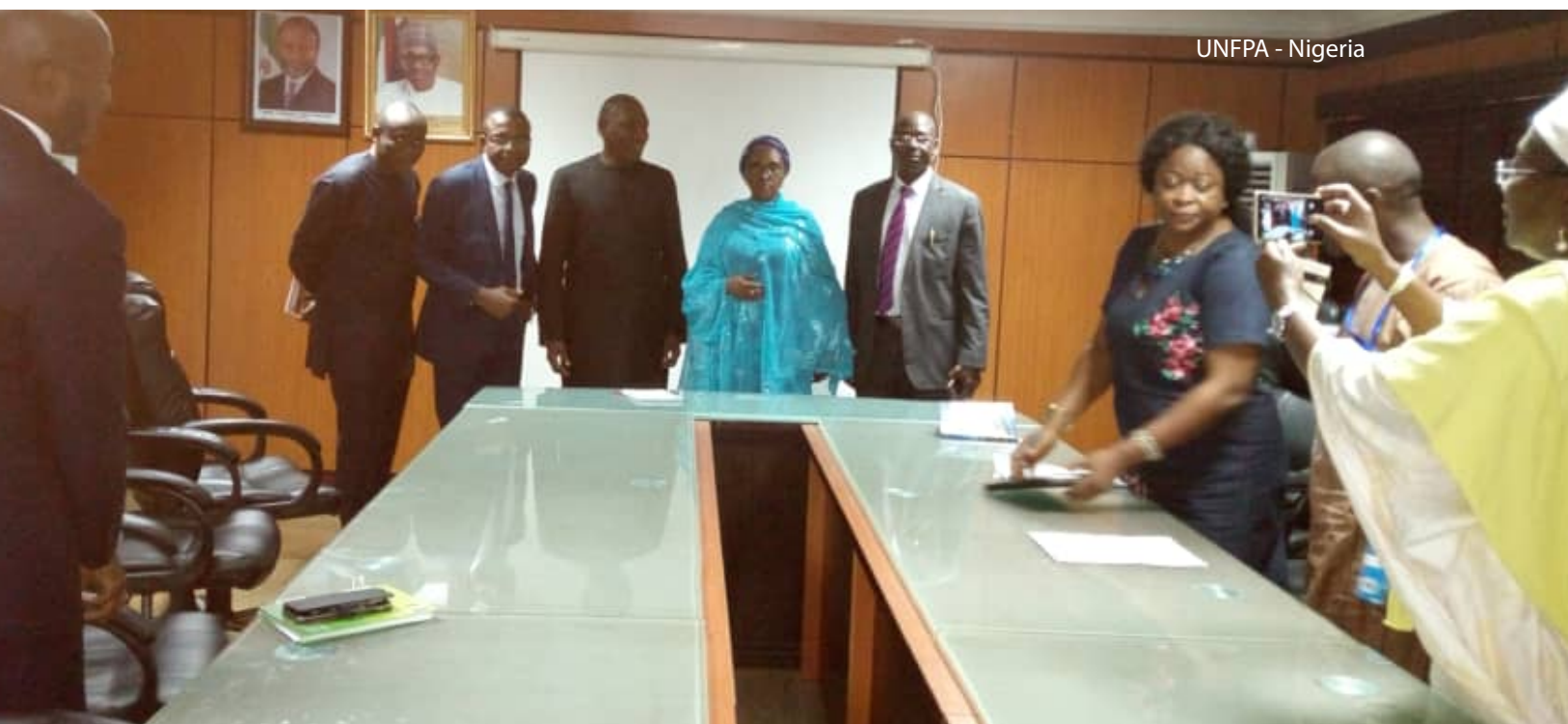
UNFPA - Nigeria

Nigeria, in partnership with PPD and with support from UNFPA, initiated a collaborative