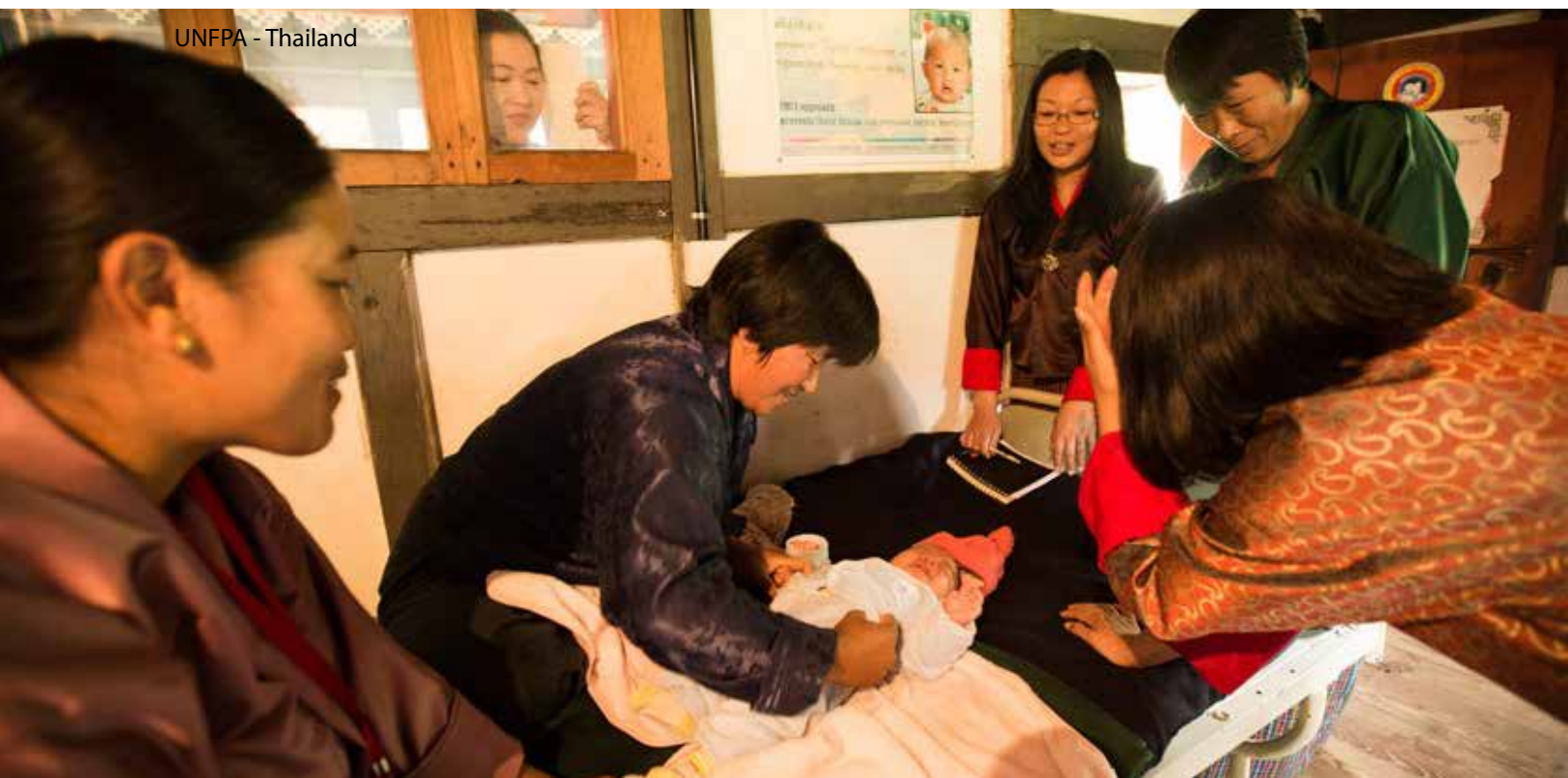
UNFPA - Thailand

rural and remote areas where there was a lack of services. Similarly, in the Lao People's Democratic Republic, maternal mortality was attributed to a low percentage of births attended by skilled health service providers, including limited access to emergency obstetric and newborn care. Through the facilitation of UNFPA, Thailand's knowledge and skills on maternal health care were tapped