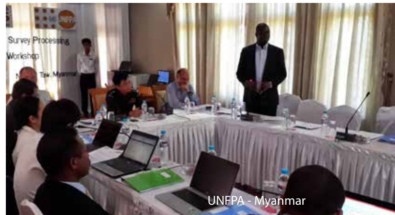
UNFPA - Myanmar

A number of technical assistance arrangements were put in place, including, among others: (i) capacity building on training methodology, and development of training guidelines; (ii) cross-country exchange of experiences and study visits to other Asian countries; (iii) regional workshop on census and survey processing system supported by UNFPA and the United States Census Bureau; (iv) sharing of Myanmar Census experiences in planning, technical, and managerial approaches for the Pakistan Population Census; (v) creation of a Census Observation Mission composed of national and international observers; and (vi) creation of an International Technical Advisory Board that included experts from various countries, officials from statistical offices, academics and independent consultants.