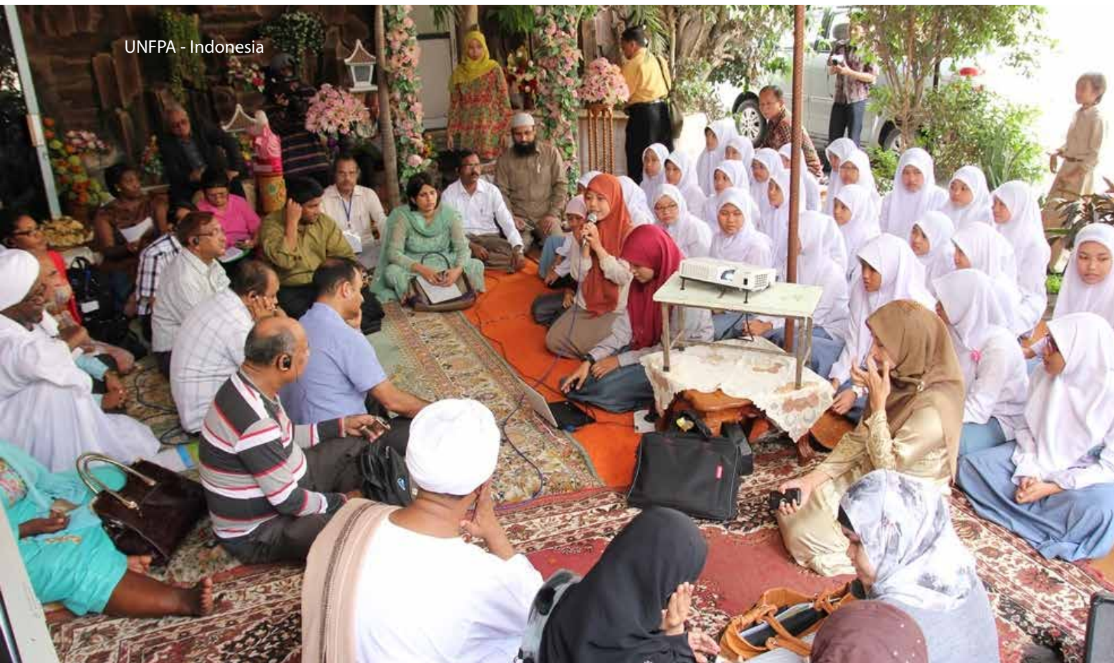
UNFPA - Indonesia

Encourage relevant UN agencies and international organizations to follow the example of UNFPA in establishing SSC as a programming strategy in its strategic plan. SSC elements should be incorporated into development and humanitarian programmes of the international organizations and into the national population and reproductive health programmes. Basic indicators such as national strategies, national task force, regular national budget line, and government-funded activities for SSC, as well as results indicators, should be established for monitoring and evaluation of SSC.