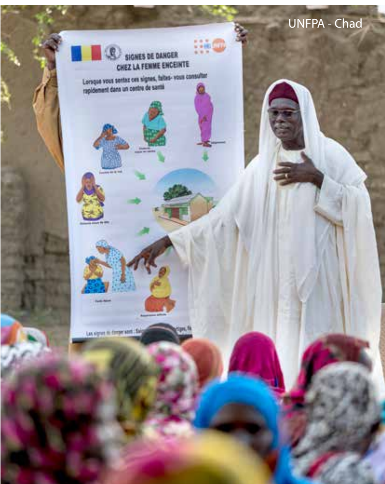
UNFPA - Chad

To counter the misinterpretation of religious texts related to family planning, the Council conducted campaigns to raise awareness on the