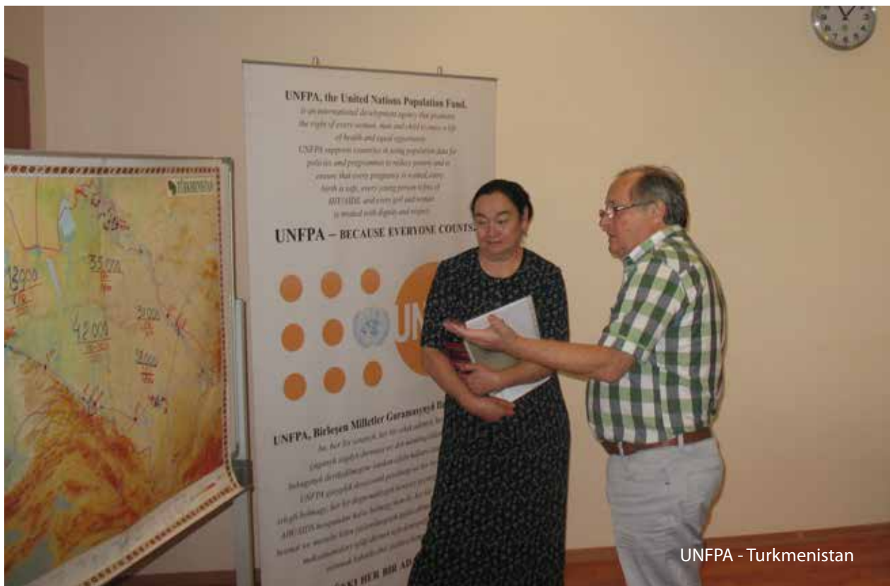
UNFPA - Turkmenistan