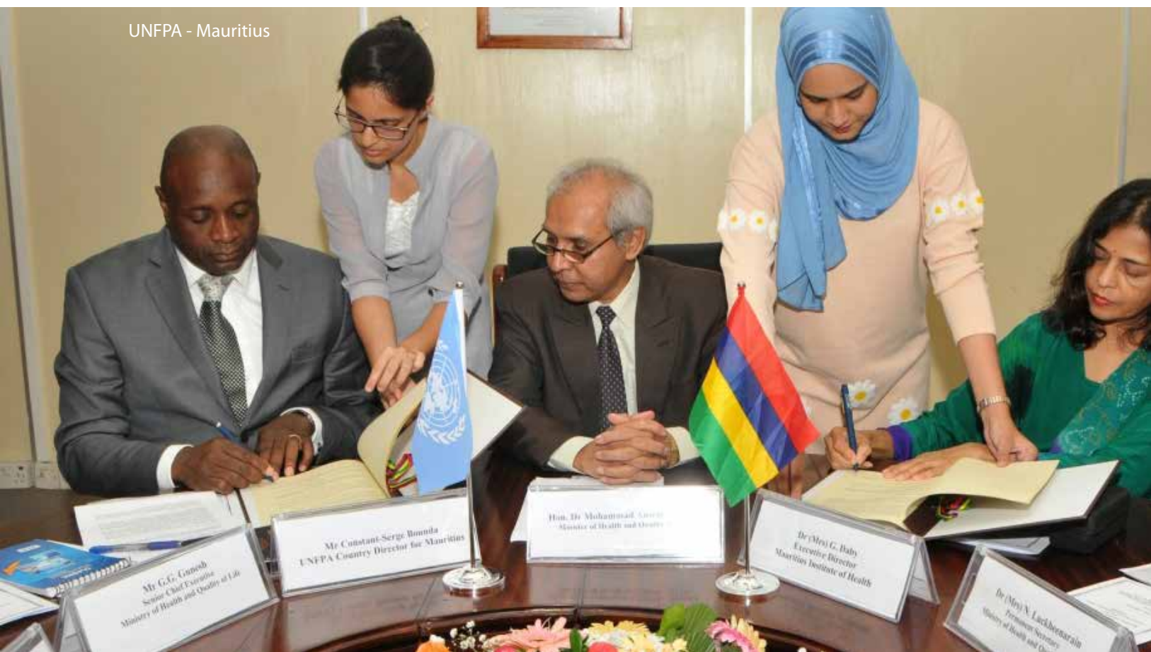
UNFPA - Mauritius

The training offered by MIH, including distance