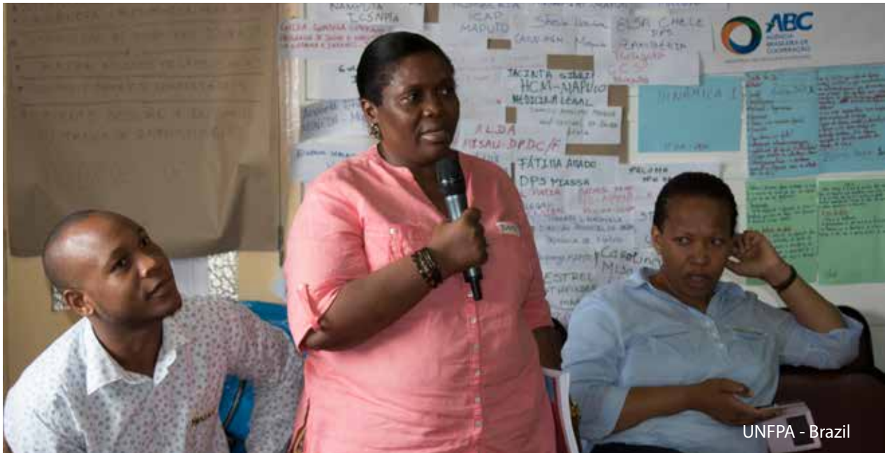
UNFPA - Brazil

equality and women's empowerment through legislation, policies and programmes were shared for adaptation, as appropriate. These include, among others, initiatives such as the Bolsa Família (conditional income transfer programme), "Mulher, Viver sem Violência"- a multi-sectoral programme to end VAW, and social policies targeting rural women.