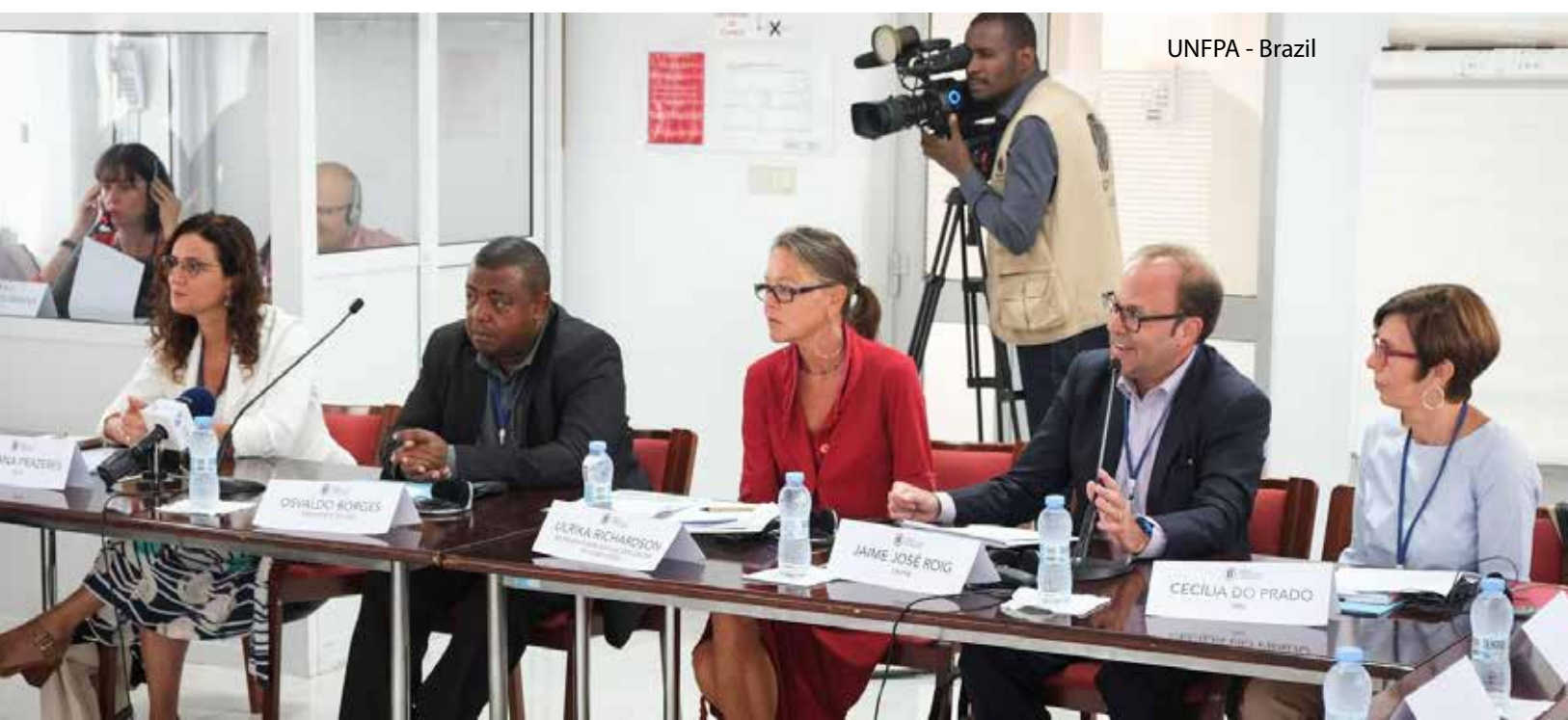
UNFPA - Brazil

This good practice was recognised as 5th-place winner in the 2018 UNFPA internal good practice competition on SSC.