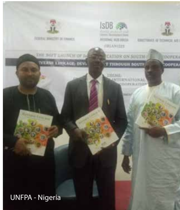
UNFPA - Nigeria