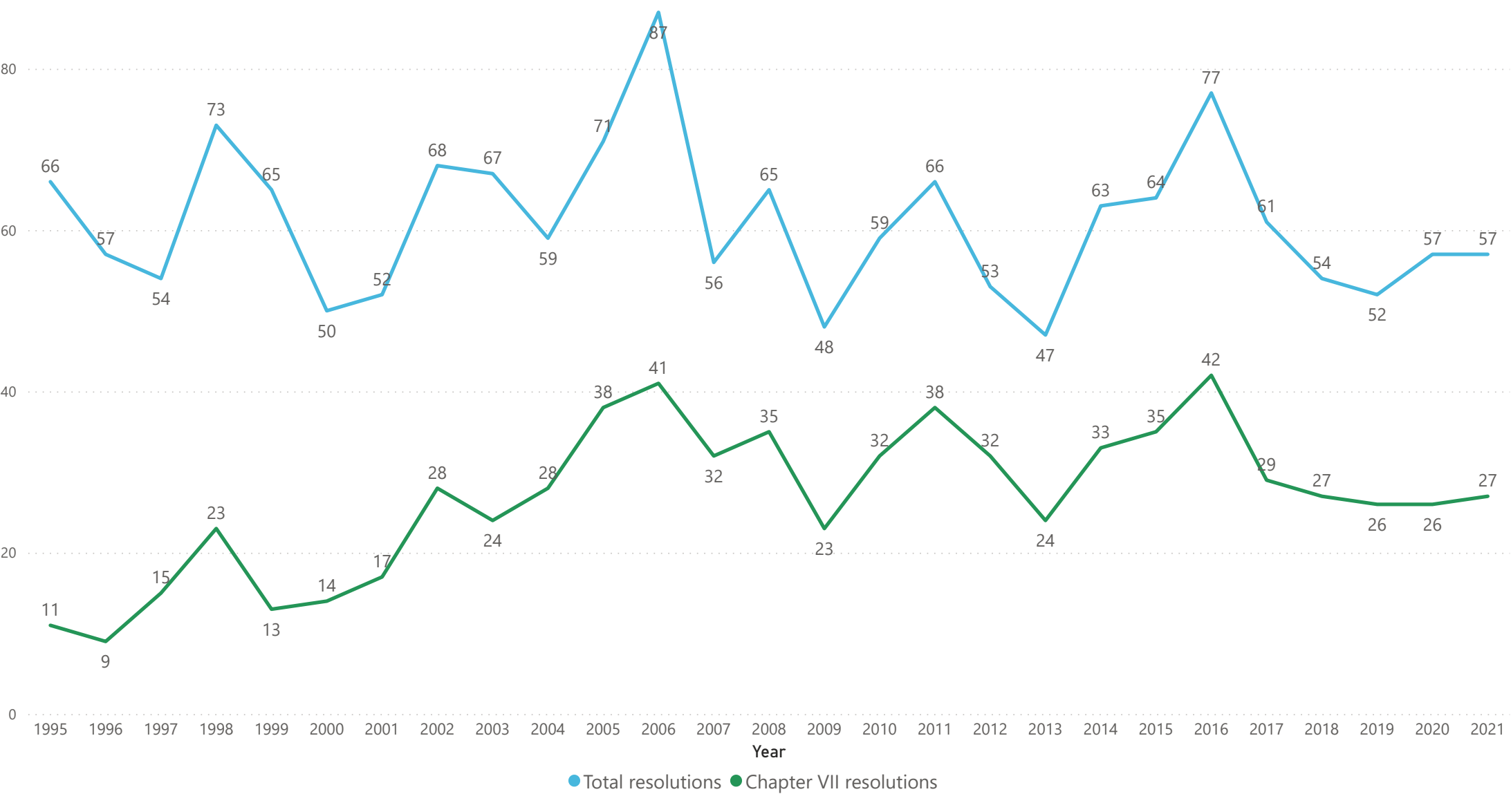
Chapter VII Resolutions and Resolutions by Year (1995-2021)