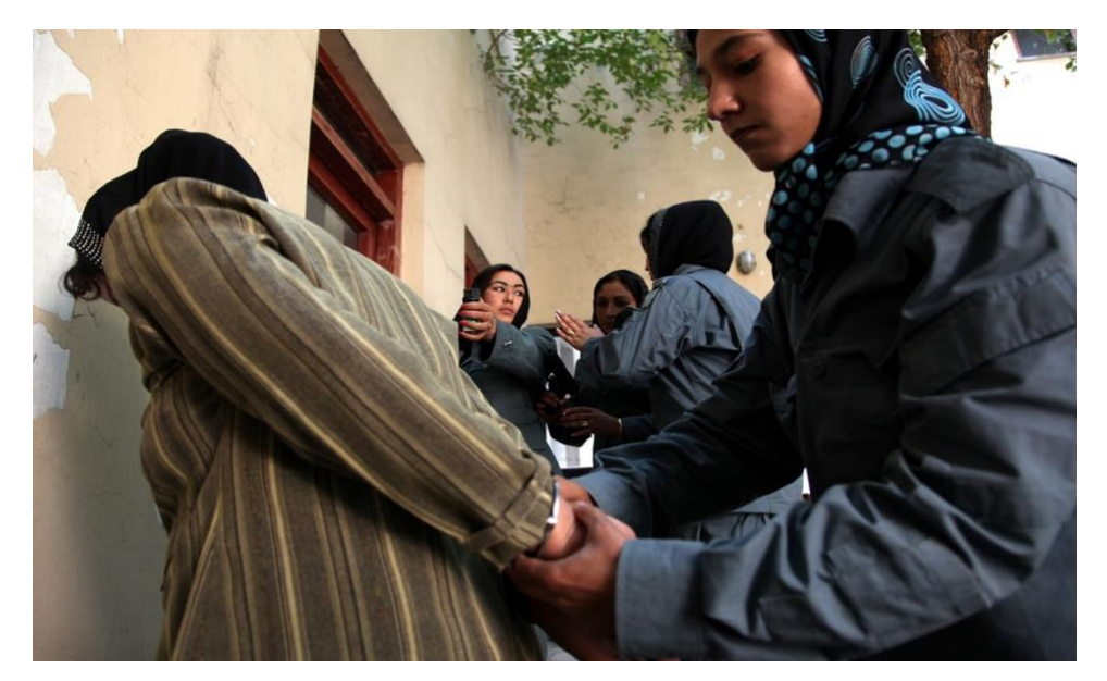
Policewomen from the Afghan National Police train at a police training centre in the capital, Kabul.

Researchers emphasize that building inclusive security and law-enforcement institutions by recruiting more women and elevating them into decision-making positions must be prioritized within an overall counter-