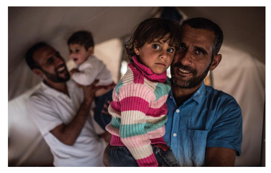
Positive male role models.

challenging. Nonetheless, research into effective ways to counter gendered messages remains limited. Several researchers note that the response so far lags behind ISIL's skilful and manipulative use of gendered narratives.<sup>43</sup> Lahoud suggests that, if the desire for empowerment and adventurism drives women to join ISIL, then counter-messaging initiatives should demonstrate that, in ISIL's worldview, neither empowerment nor adventurism are on offer for women. Others suggest that counter-narrative campaigns lack references to positive female experiences and role models.<sup>44</sup> Moreover, insufficient attention is paid to constructing alternative notions of masculinity.<sup>45</sup>