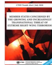
Trends Alerts and Trackers