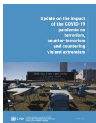
Update on the impact of the COVID-19 Pandemic on Counter-Terrorism and Countering Violent Extremism