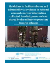
Military Evidence Guidelines