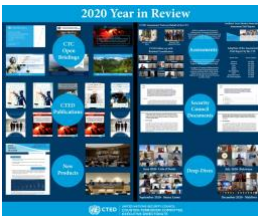
2020 Year in Review