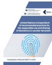
Compendium on the Responsible Use and Sharing of Biometrics