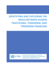
Identifying and Exploring the Human Trafficking, Terrorism, and Terrorism Financing Nexus