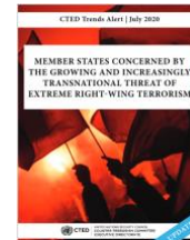
Trends Alerts and Trackers