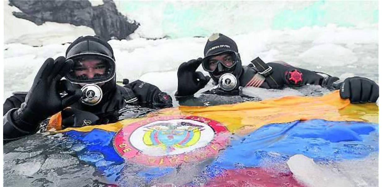
Thanks to CCO