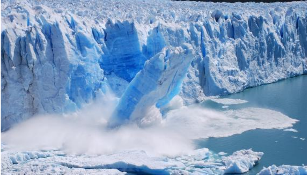
Thanks to Sandava