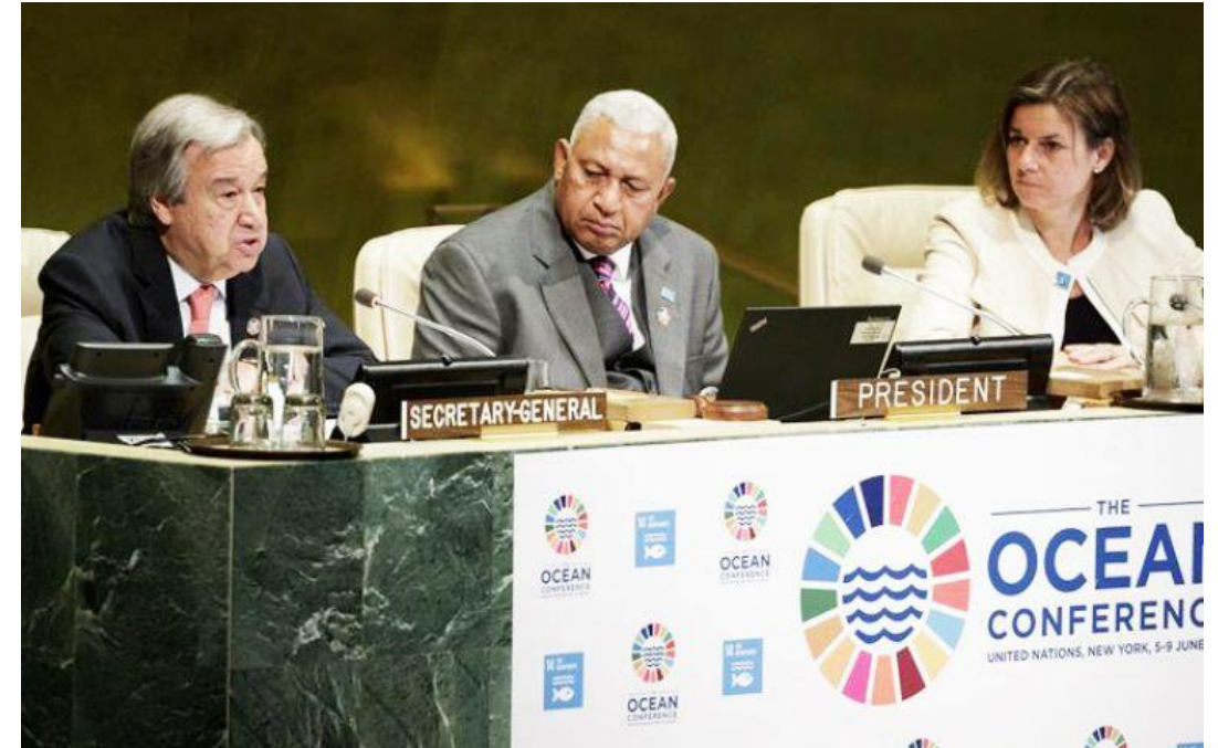
Thanks to UN