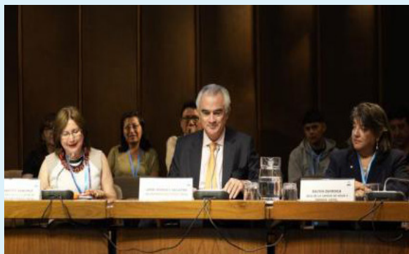
José Manuel Salazar-Xirinachs, Executive Secretary, ECLAC

vision and collective commitment to universal access to water and its integrated management, leaving no one behind and emphasizing this resource's central and indispensable role for life, health and sustainable development.