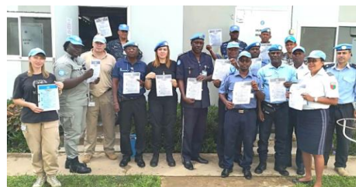
The flyer on the 10 points of the Code of Conduct for the Blue Helmet shown by UNPOL Sector LUBUMBASHI

This commitment is renewed with each extension obtained.