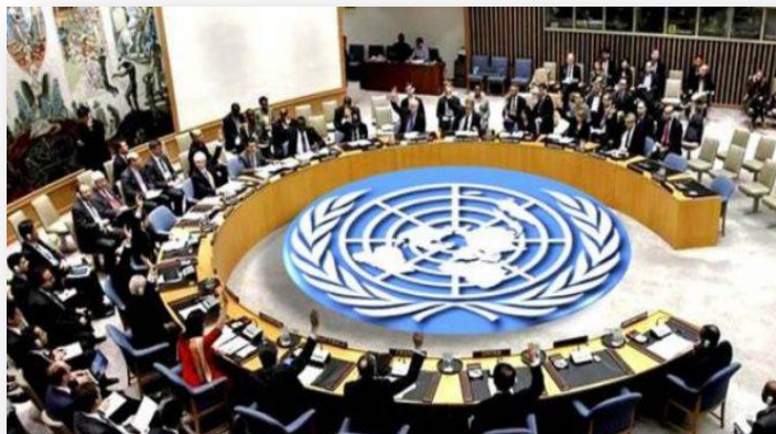
UN Security Council took a Resolution to stop Sexual Abuse and Exploitation in the Missions

Thus, at the strategic level, the hierarchy of the Police Component has put in place mechanisms and procedures, including several SEA Guidelines and measures to prevent, if not repress, and better eradicate them.