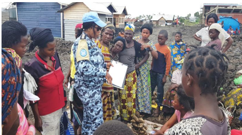
Discussion about Sexual exploitation and abuse are also shared with vulnerable social groups