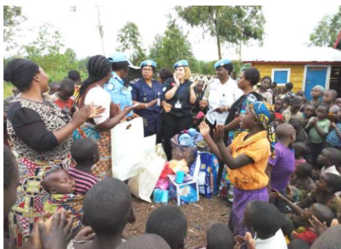
The children of the orphanage sing to express their joy and thank the UNPOL women of GOMA

On Saturday, December 8, 2018, Child Protection focal point, accompanied by all UNPOL female officers in Goma Sector offered donations to the orphanage known as "Women's Coalition for Full-fledged Promotion" in KIBATI, NYIRAGONGO territory.