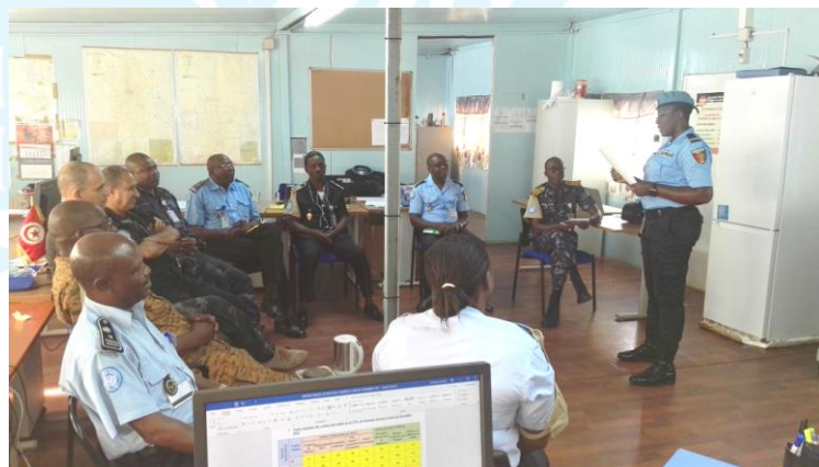
UNPOLs in all Sectors, Sub-sectors and Antennae are regularly raising each over in the fight against Sexual Exploitation and Abuse

For information, 4,482 sensitization sessions were organized, for 1,370 UNPOL personnel in 2018. 09 brochures (Fact-sheets and Flyers) were developed as part of the sensitization on SEA.