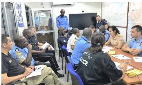
SEA awareness session of the Front Office in KINSHASA