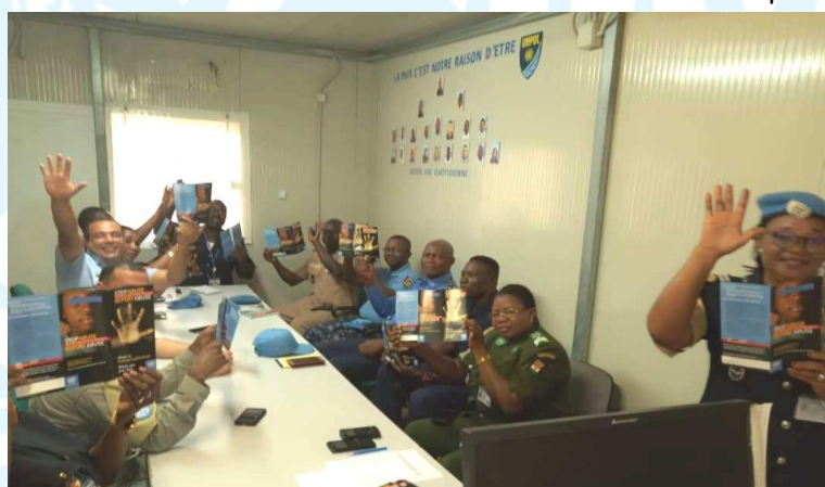
The joy of UNPOL in the sectors, with the announcement of "zero cases of SEA" for the year 2018 within the MONUSCO Police Component

From February 2016 to December 2017, the Police Component registered 02 cases of SEA and has been working hard to achieve "Zero Tolerance" cases. In the year 2018, it is done as MONUSCO Police Component has achieved "zero cases of SEA" and is quite happy about it.