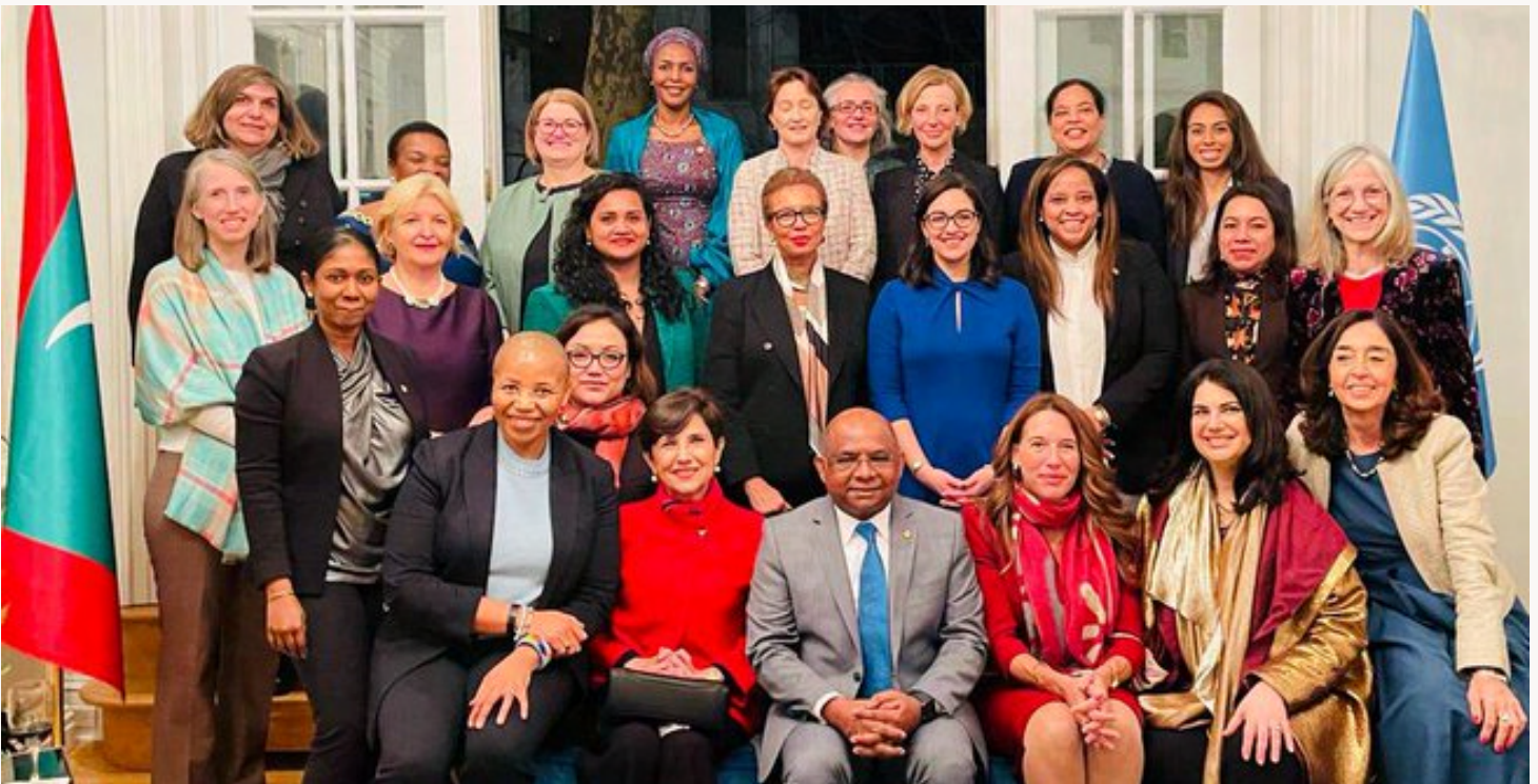
President Shahid hosted an informal gathering for Women Ambassadors on the occasion of the International Women's Day