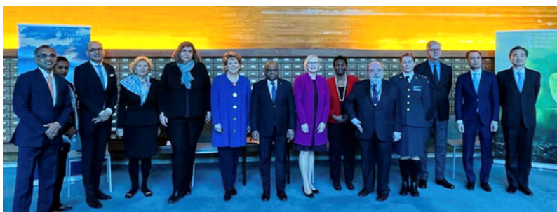
President Abdulla Shahid with PRs of Member States that participated in the 7th Holhuashi Dialogue