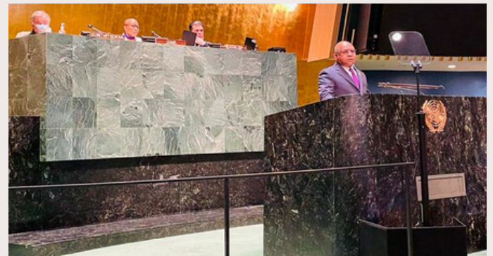
President Shahid delivering remarks at the opening of CSW66