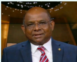
Dr. Roberta Bondar