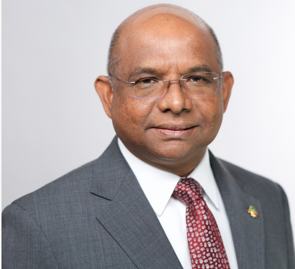
H.E. Abdulla Shahid

President of the 76th session of the United Nations General Assembly