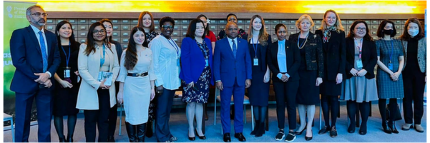
President Abdulla Shahid with women experts covering the six General Assembly main committees

11 February 2022: the sixth Holhuashi Dialogue, convened on the topic "Women in Diplomacy", highlighted the indispensable role of women in diplomacy. It was a first with women experts across the six committees. Despite the increasing recognition of women in decision making process, political life, and in multilateral processes, women are severely underrepresented in senior diplomatic positions. There was a call to recognize the role of women in diplomacy through the observance of an International Day of Women in Diplomacy.