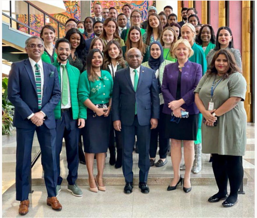
Team OPGA76 #BreakingTheBias in celebration of the IWD

While we acknowledge their contribution in these fields, we must also realize that women remain under-represented, under-supported, and unrecognized in the social, economic, and political fields needed for sustainable recovery."