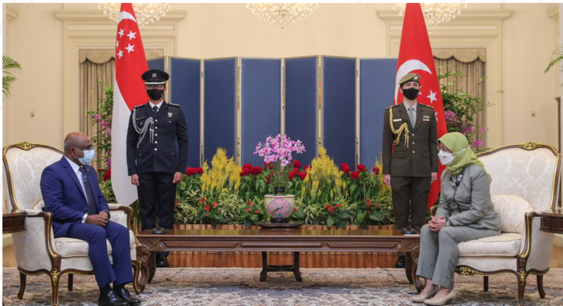
Calling on President H.E. Mdm Halimah Yacob