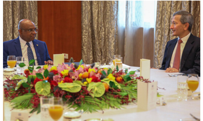
With Mr. Vivian Balakrishnan, Foreign Minister