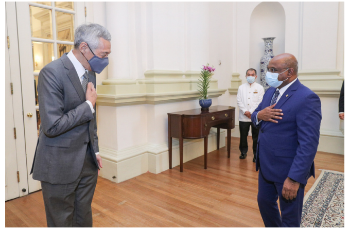
With Prime Minister H.E. Mr. Lee Hsien Loong

The President toured Singapore City Gallery – which highlights Singapore's dramatic transformation over the past 50 years, to become one of the most sustainable cities in Asia. The President also visited the UNDP Global Centre for Technology, Innovation and Sustainability based in Singapore.