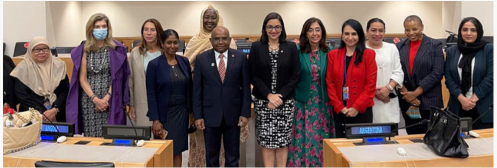
Members of the Circle of Women Ambassadors with the President of the General Assembly

It is my conviction that together we can write and act on that conclusion"