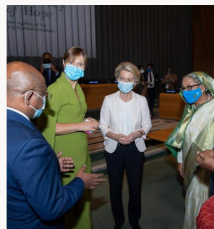
From left to right: H.E. Sheikh Hasina, Prime Minister of the People's Republic of Bangladesh, H.E. Samia Suluhu Hassan, President of the United Republic of Tanzania, H.E. Kersti Kaljulaid, President of the Republic of Estonia, PGA H.E. Abdulla Shahid, H.E. Maia Sandu, President of the Republic of Moldova, H.E. Ursula von der Leyen, President of the European Commission, and H.E. Mia Amor Mottley, Prime Minister of Barbados