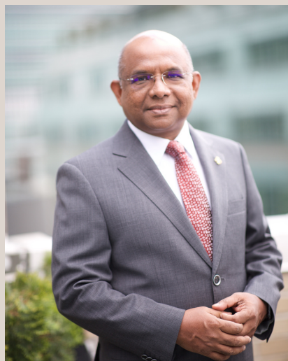
H.E. Abdulla Shahid President of the 76th session of the United Nations General Assembly

"When I took oath for office, I did so, determined to contribute to gender equality.