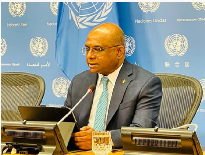
H.E. Mr. Abdulla Shahid speaking at the press conference convened at UN on 14 of December 2021

"I am a lifelong supporter of gender equality.