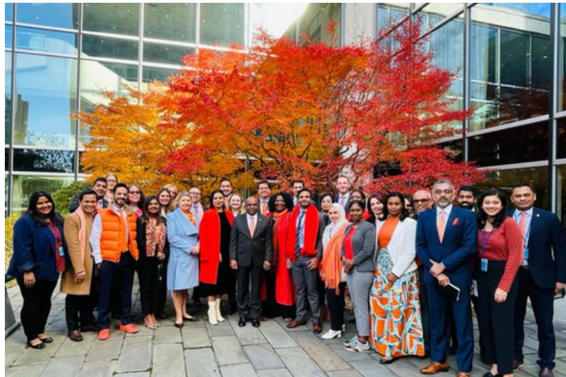
Team OPGA76 joining the #OrangeTheWorld campaign

- President Shahid's remark at the Commemoration of the International Day for the Elimination of Violence against Women