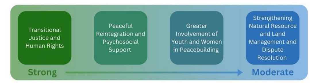
Figure 5.1 Achievement of Results by Strategic Area – At-a-Glance

The 2018 Eligibility Document in The Gambia outlines four strategic areas of support for the PBF, namely: 1) Transitional Justice and Human Rights; 2) Greater Involvement of Youth and Women in Peacebuilding; 3) Peaceful Reintegration and Psychosocial Support; and 4) Strengthening Natural Resource and Land Management and Dispute Resolution. The extent to which the PBF Portfolio between 2017 and 2022 has achieved its intended objectives and contributed to each of these areas is moderate-to-high, as seen in Figure 5.1, and discussed below.