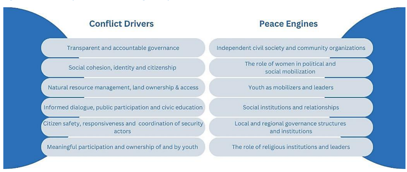
Figure 3.1 CDA Conflict Drivers and Engines of Peace