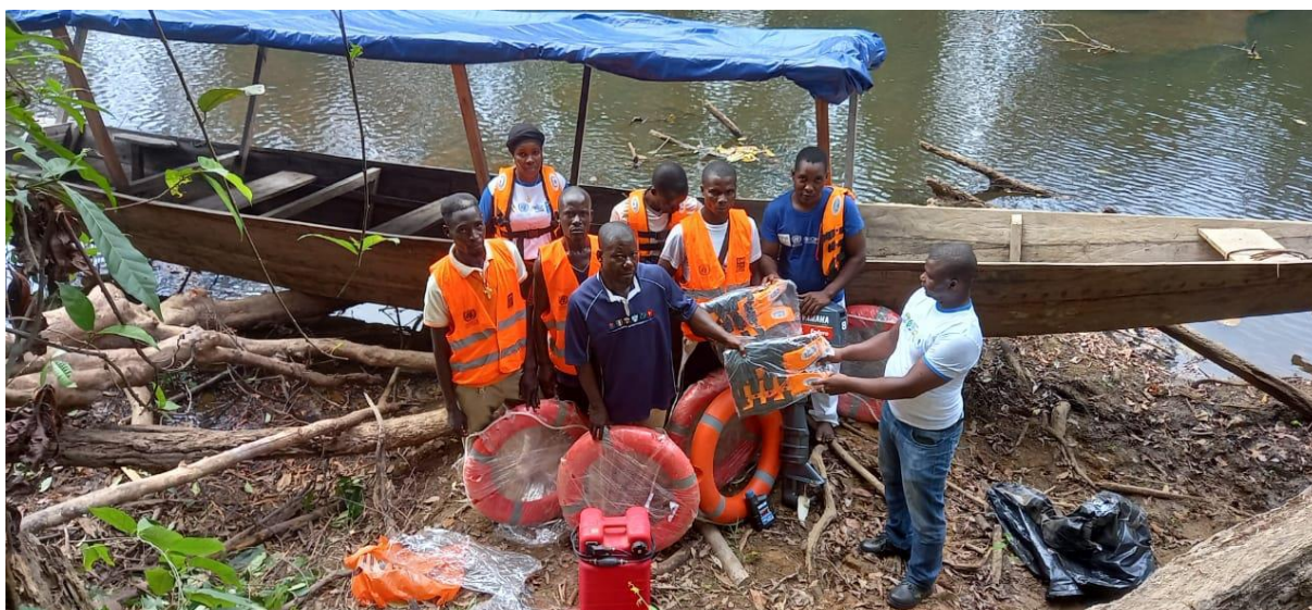
Photo: Handover of life jackets to the managers of the Klaon motorboat

Importantly was the project's focus on women's empowerment through training on leadership, enhancing their roles within peace committees and support to income generating activities. Cross border trade was strengthened through provision of a warehouse in Loguato which helped to reduce losses, enhance security of goods and led to increases in income generation.