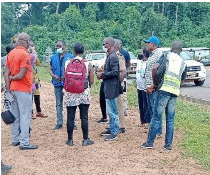
Photo: Site visits in preparation of simulation exercise