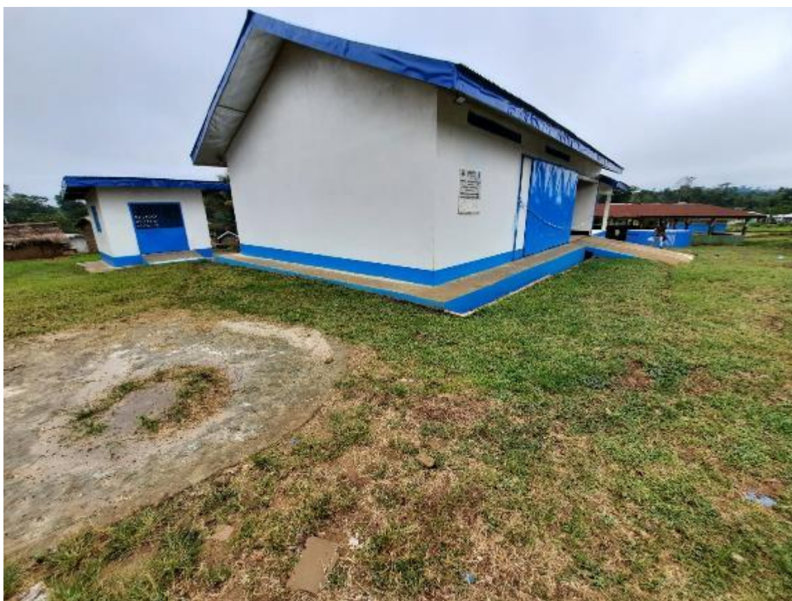
Photo: Newly constructed warehouse in Loguato

Importantly was the project's focus on women's empowerment through training on leadership, enhancing their roles within peace committees and support to income generating activities. Cross border trade was strengthened through provision of a warehouse in Loguato which helped to reduce losses, enhance security of goods and led to increases in income generation.