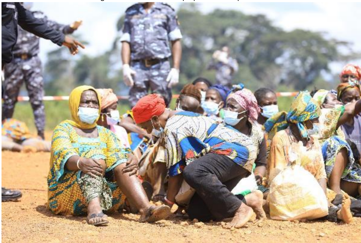
Photo: Simulation exercise

The objective was to strengthen the technical capacities of authorities and communities to deal with a cross-border crisis that would lead to a massive displacement of populations. The action was delivered under the supervision of the Operational Command Center (OCC), of the Danané Departmental Security Committee (DSC). Several authorities of different status were mobilized, including prefectural authorities, local elected officials, and traditional leaders. Through this exercise the project further enhanced joint reflections on the issues that could arise in the event of mass movement of people during a crisis. SIMEX enabled the local authorities to identify potential challenges and formulated recommendations to various agencies to enhance their preparedness to potential crisis events.