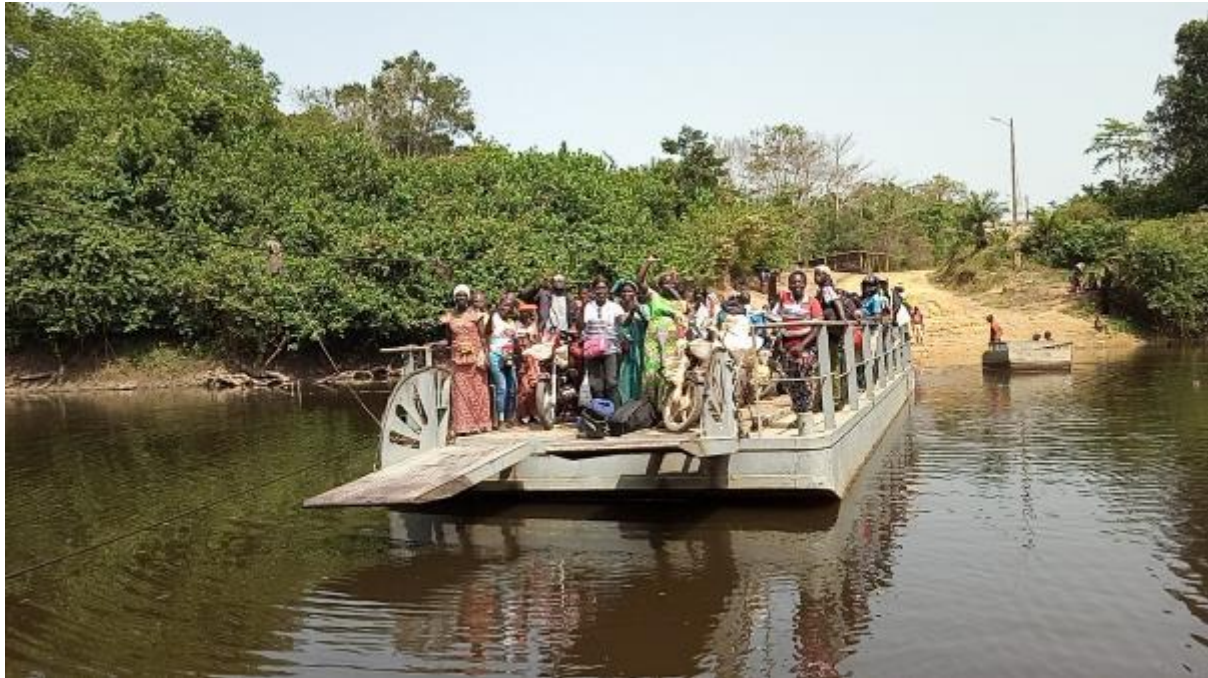
Photo - Butuo crossing point

In terms of unintended impacts , respondents from Liberia raised concerns about the management of proceeds emerging from the ferry and canoe over the Cestos River in Butuo, Behwallay and Glio Tempo. Although the evaluation team did not access any data on the income generated from the activity, “the unilateral holding of the canoe” by Ivorian counterparts was unfair creating tensions amongst communities. Respondents also highlighted the fact that there was no complaints mechanism built into this project which did not allow them to raise their grievances to IOM/UNDP. Such a mechanism could also support project monitoring and management and increase the interest and contribution of local partners and beneficiaries in project implementation.