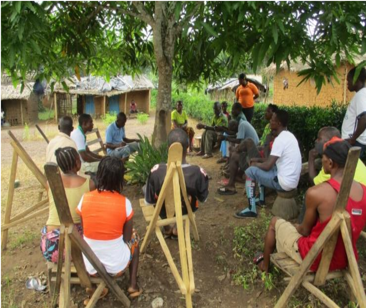
Photo: CPC Conducting Mediation in Tempo, Grand Gedeh County: Courtesy of SEWODA

To further highlight the role of these committees, the Burkinabé and the Baoulé have settled in Tai to carry out agricultural activities. There are boundary disputes over land parcels. These committees have been able to mediate on some of these issues and helped to deescalate them before they turn violent. Another incident emerged from when an Ivorian used an unmanned point to cross from Cote d'Ivoire to Liberia. Unfortunately, the Ivorian got drowned as he could not swim after the raft capsized while other Liberians survived. The tensions around the matter were resolved amicably by the Joint Committee considering that these committees include chiefs and elders from mirroring communities. Prior to this project, this incident would have been a big recipe for border conflicts with grave consequences on cross-border relations. Without this local conflict management mechanism, these conflict cases could have escalated to outright confrontations between communities. With limited state presence in terms of the judiciary and other law enforcement officials, this action fully complements national law enforcement efforts. In its absence, the local legal or traditional legal systems could be overwhelmed.