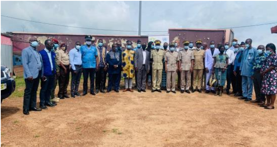
Photo: SIMEX Preparatory meeting