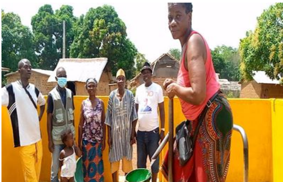
Photo: Rehabilitation of the koarho -ziouebly- toyebli hydraulic pumps

In the same vein, the project has enabled the implementation of community-building activities such as cultural fairs and socio-sport activities. These activities have further consolidated peaceful cohabitation between the communities living in the mirror villages. Multi-ethnic teams were formed as part of the organisation of football tournaments. This approach strengthened the social ties between the natives, non-natives and non-natives (Liberians and Ivorians) who were in the same teams. Youth teams from Luguatuo and Behawally in Nimba Liberia played football matches against their counterparts in Gbeunta and Toulepleu respectively. Through sport, the project contributed to the transmission of values such as: tolerance, respect, honesty... As one of the youths points out: "The football matches allowed the mixing of communities because mixed teams were formed. Moreover, they included young people from the different communities in the villages. Firstly, this strengthened social cohesion between young people from the different communities in the villages. Secondly, these matches enabled the populations of the Ivorian and Liberian villages to work together again and to strengthen fraternity and social cohesion" (Youth focus group, Tabou)