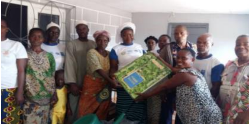
Photo: Delivery of materials to women's groups in Tiobly

commodities to perish and leading to loss of vital incomes. By allowing traders to buy and sell huge quantity of goods without fear of storage and loss, the facility contributes to increased volume of cross border trade.