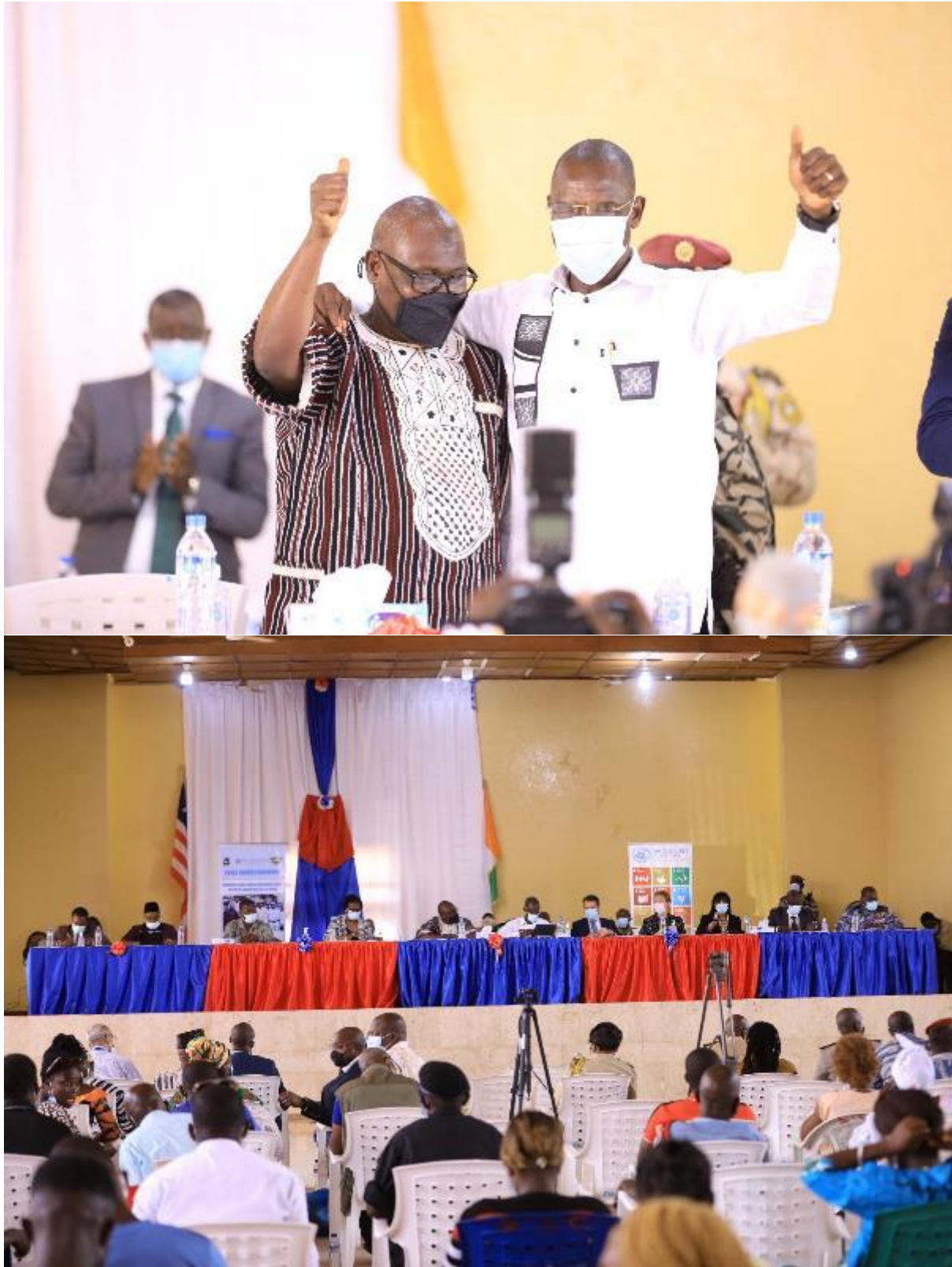
Photos of high level meeting in Sanniquellie, Liberia October 22 nd 2021

Liberian authorities valued the contribution of the project and restated their commitment for collaboration with their Ivorian counterparts. Authorities stated that to foster the gains even further, it will be important to work on policy advocacy to ensure that commitments are enshrined in national legislation. One stated, "... is to have IOM/UNDP through the UN Resident Coordinator discuss with the political leaders of the need to have these initiatives sustained through the national budget as our voices as technocrats might not be heard at some