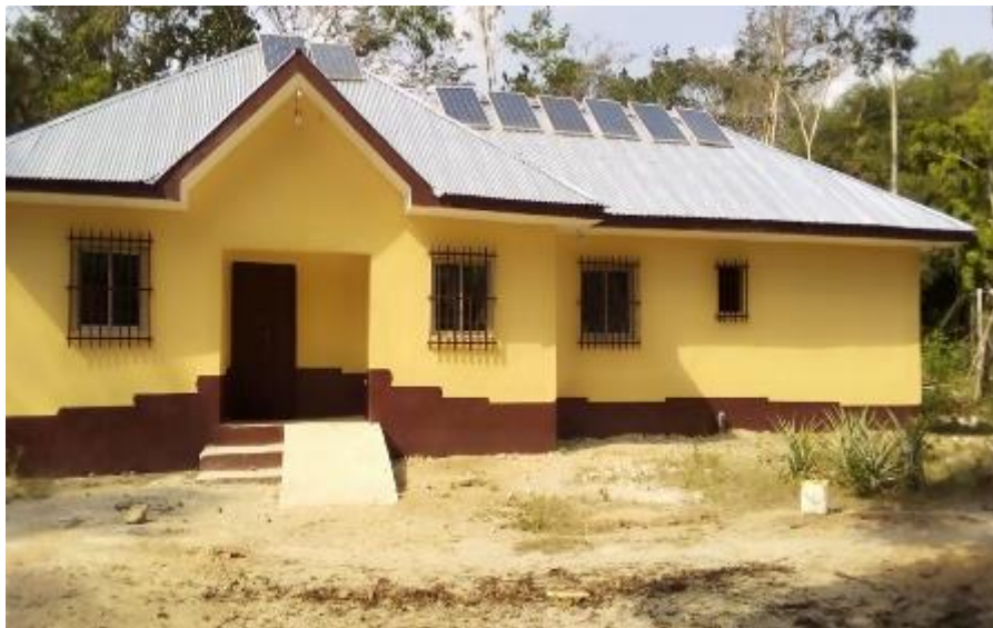
Photo: Newly constructed border post Glio Tempo

The project rehabilitated infrastructures in three places, Kenlay, Butuo and B'Hai border in Liberia as well as construction of new facilities in Luguatuo (warehouse) and Glio Tempo (border post).