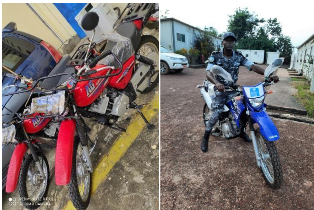
Photo: Motobikes donated in both countries

on Customary land, Tax Awareness, Border Management and Conflict Mediation, for local authorities, joint security agencies, and community leaders. Other sessions focused on Conflict Management/Resolution/Peacebuilding, Alternative Dispute Resolution (ADR) Method and Techniques; Gender Based-Violence, Land Rights Law and Education; Early Warning and Response (identifying potential conflict hot spots along the borders and mitigating violence issues including land dispute along the Ivorian-Liberian border); Monitoring, Reporting and Committees' Plan of Action.