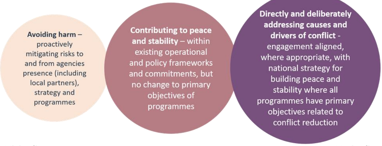
Figure 2: Minimalist-Maximalist approaches

Approaches build on one another. In all cases, the minimum standard of DNH must be met, where conflictsensitive approaches informed by at least a 'good enough' context and conflict analysis are foundational. Figure 2 outlines minimalist to maximalist approaches for actors working across the HDPN.