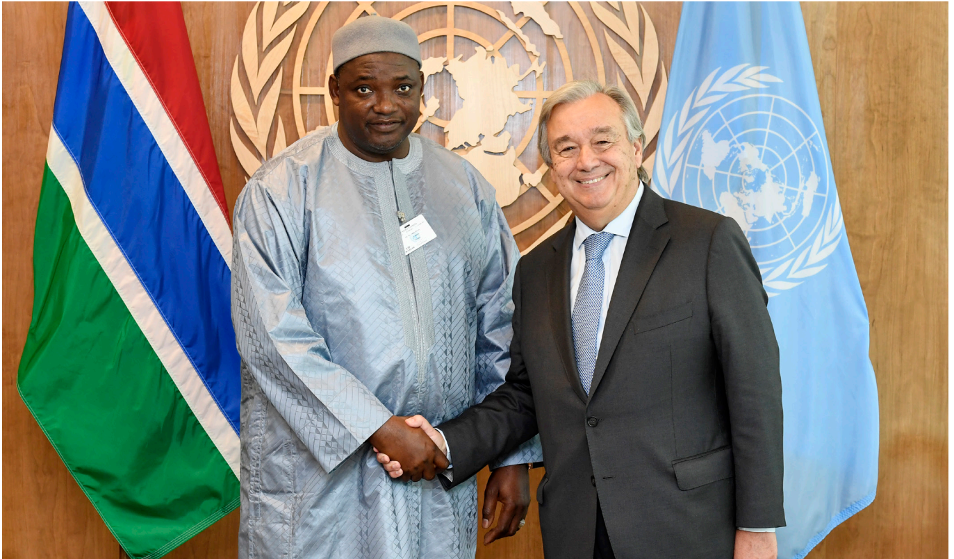
UN Secretary-General António Guterres meets with Adama Barrow, President of the Republic of the Gambia.