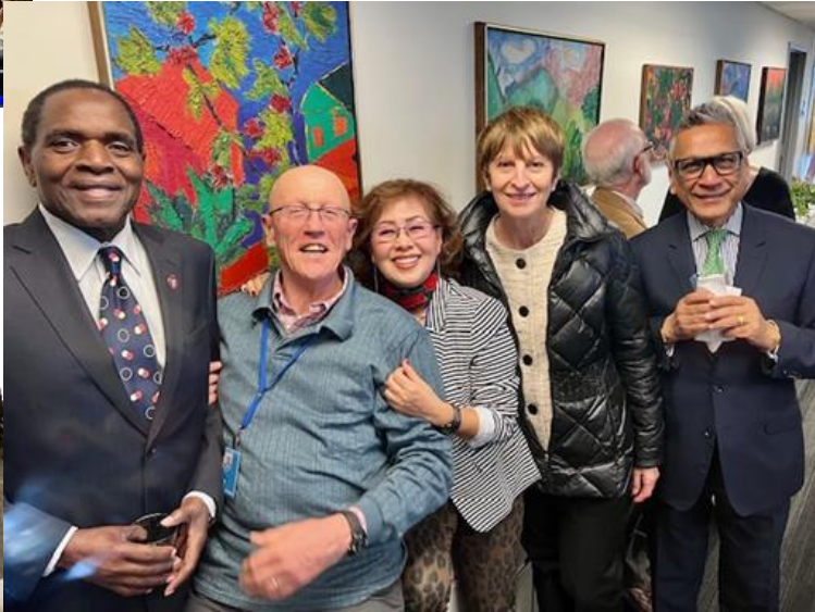
Top left: President's remarks at AFICS/NY General Assembly (May 2023) Bottom L & R: Reception at the new AFICS/NY premises following the Assembly