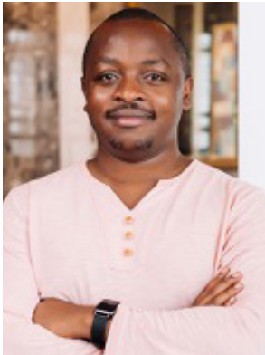
SHIKAMA DIOSCORE Founder and CEO