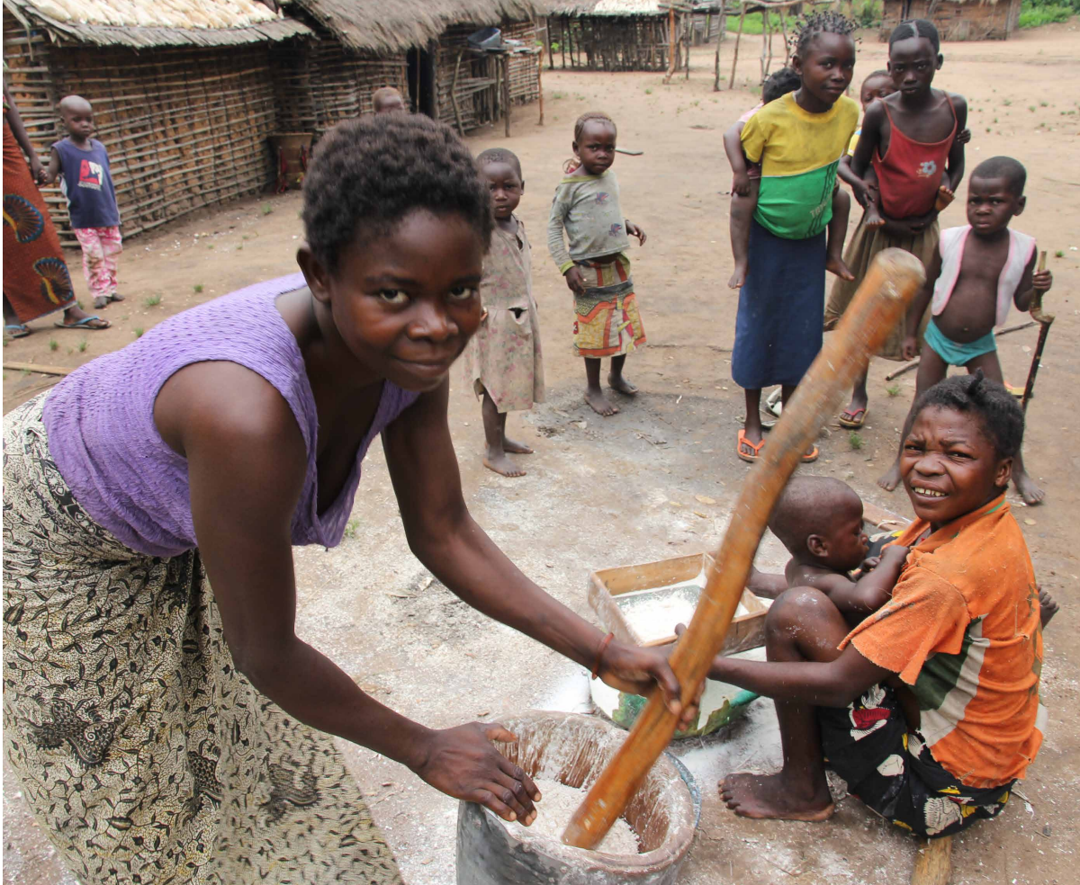
A woman pounding cassava in Tsakala Bamba, Bandundu Province, Democratic Republic of Congo (DRC). According to the World Food Programme (WFP), in October 2021, the number of acutely food-insecure people stood at 26.2 million , making access to food a daily struggle for a significant part of the Congolese population.

Substantial amounts of resources have been spent in Africa in the fight against famine. The investments by donors and Governments had been guided by the ad-hoc relief approach, which was costly and unpredictable, until the introduction and expansion of social safety net programmes. With the ambition to break from the short-term-oriented relief approach, several Governments in Africa have collaborated with donors to develop social safety net programmes, particularly since the late 1990s.