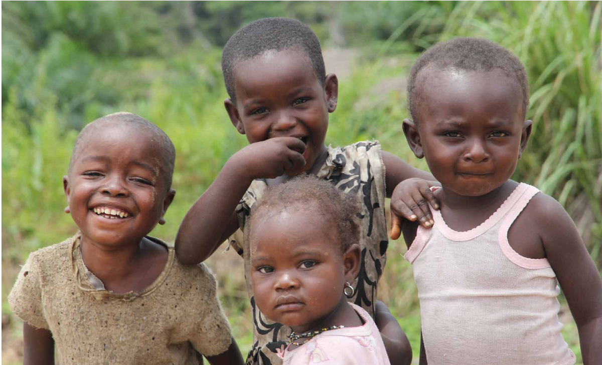
Children in Popokabaka village, Bandundu Province, Democratic Republic of the Congo (DRC). According to the World Food Programme (WFP), by October 2021, an estimated 3.3 million children in the country were acutely malnourished, according to the World Food Programme (WFP).