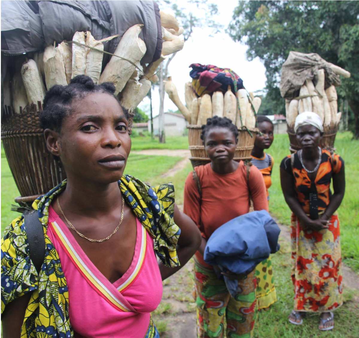
Women carrying baskets full of manioc to sell in the local market in Popokabaka, Bandundu province, Democratic Republic of Congo (DRC). According to the World Food Programme (WFP), millions of people in parts of DRC faced food insecurity in 2021 following a recent drought.