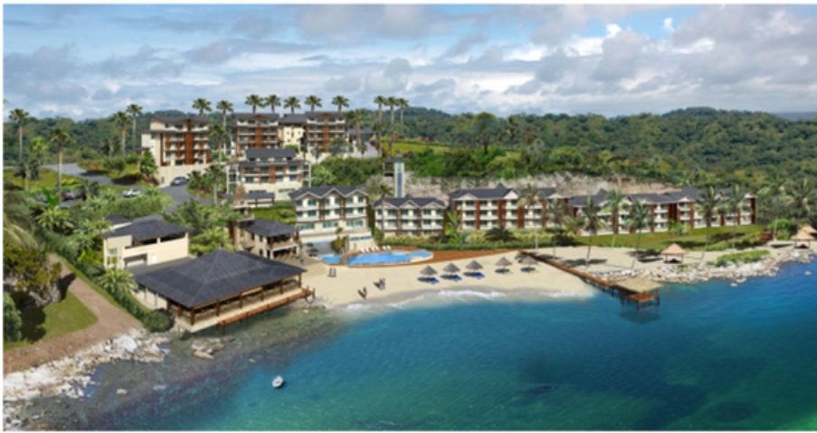
Image 2 View of the Ramada Resort by Wyndham

Email: events@ramadaresort.com.vu Http://www.ramadaresort.com.vu