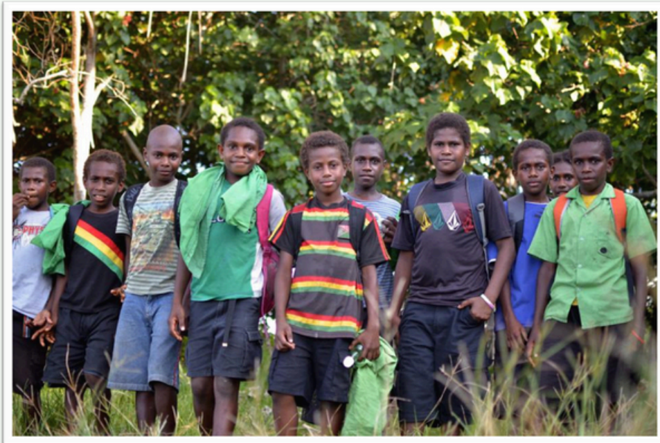
Image 1 Return from the school, Malekula Island, Vanuatu.

“Coherent Implementation of the ABAS – strengthening the role of the SIDS NFP Network”