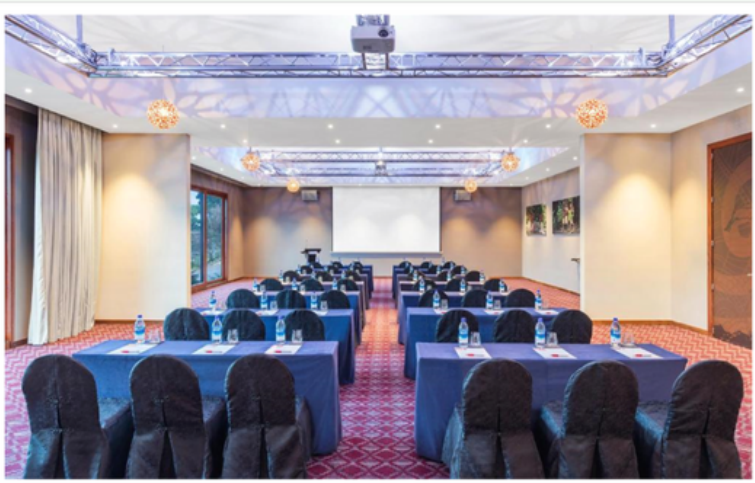
Image 3 Torba conference Room, Ramada Resort