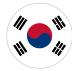
Rep. of Korea