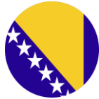
Bosnia & Herzegovina