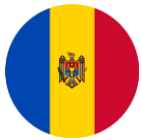
Rep. of Moldova