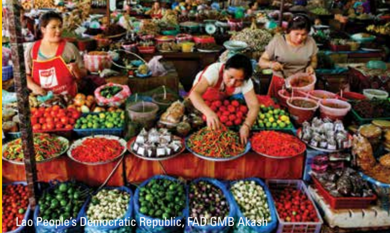
Lao People's Democratic Republic, FAD GMB Akash