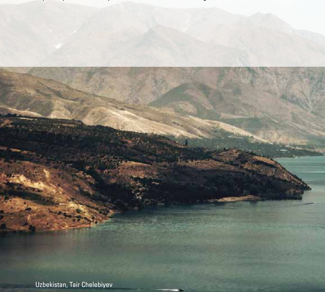
Uzbekistan, Tair Chelebiyev