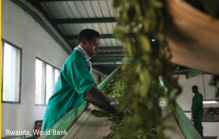
Rwanda, World Bank