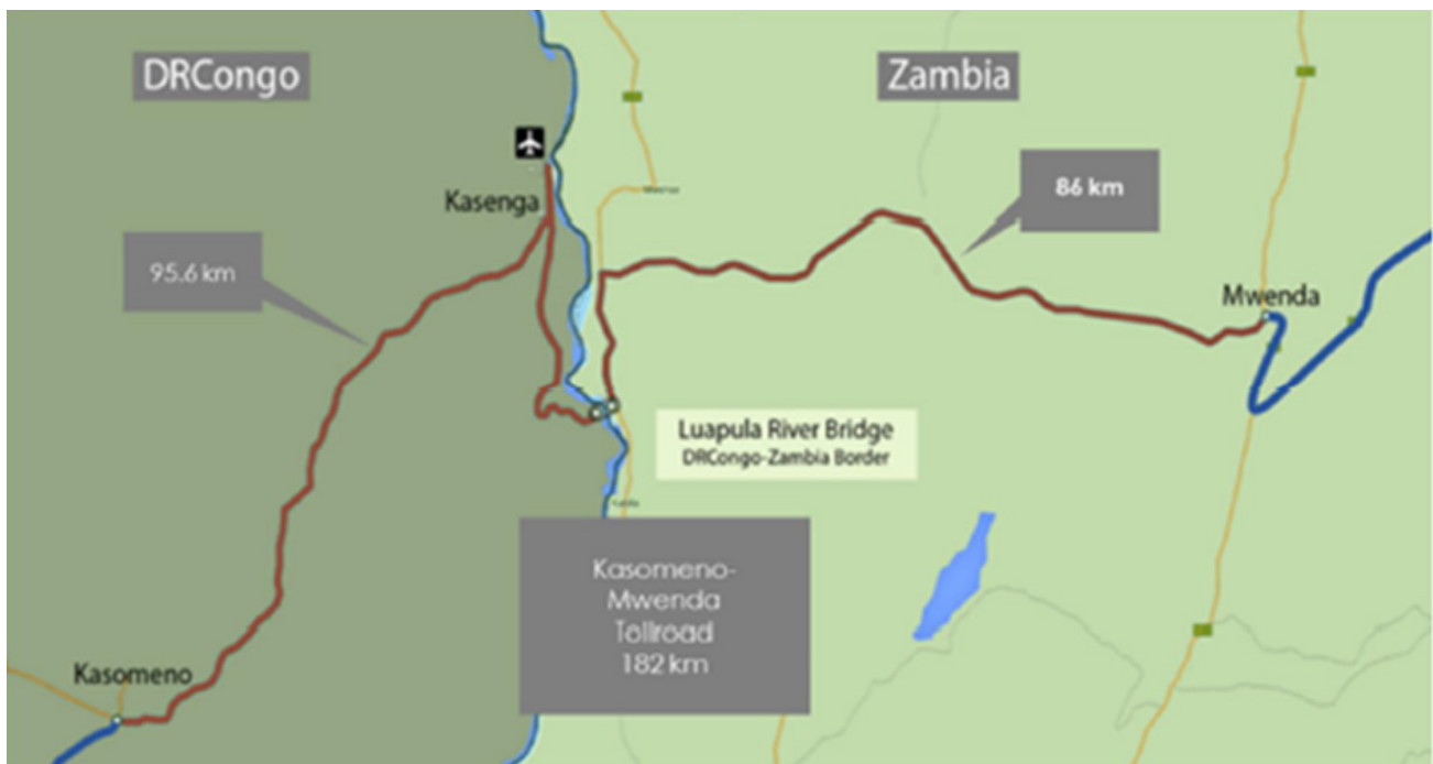
Figure 1.3: Location of the Proposed Kasomeno-Mwenda Toll Road

The Kasomeno-Mwenda Toll Road and associated One Stop Border Posts are located in the Democratic Republic of Congo (DRC) and Zambia. The project is currently undergoing its development cycle which has included the preparation of a pre-feasibility study (2017-2019), full feasibility bankable study (2019-2020) and fund raising (2020). Implementation of the project is expected to commence in April 2021 through a PPP regime with a 25-year concession given to the private sector after which the road and ancillary infrastructure will revert to the governments of DRC and Zambia. The project preparation studies were funded by the Development Bank of Southern Africa (DBSA) (Athari Advisory Group, 2020). The winning Concessioner and financier is Groupe Europeen de Development Africa (GED Africa) together with another equity investor from Hungary, Duna Aszfalt Investments (Athari Advisory Group, 2020).