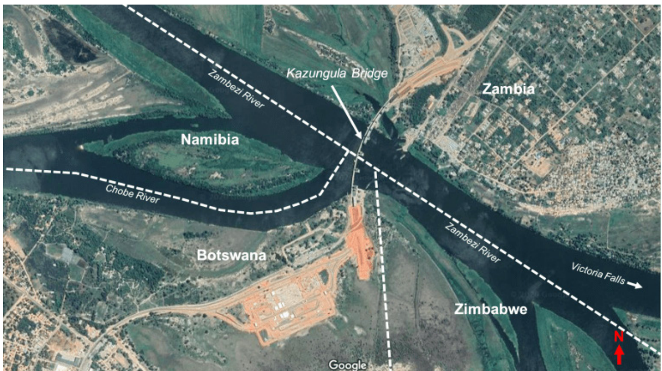
Figure 1.1: Location of the New Kazungula Bridge Project