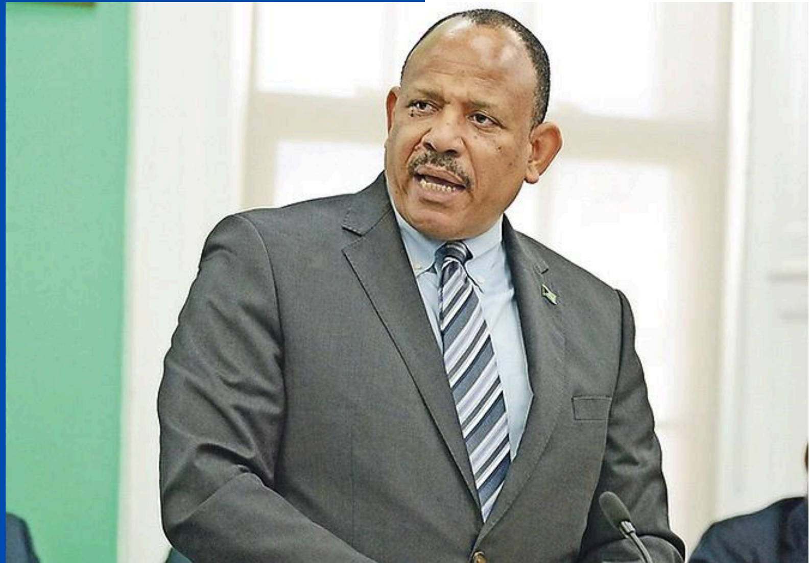
Dr. the Hon. Duane E. L. Sands, M.P. former Minister of Health HOUSE OF ASSEMBLY 18TH March, 2020

"The Bahamas must also strike a balance to protect the health, economy, social and human rights of each Bahamian. As each new and evolving situation raises its ugly head, the Ministry of Health stands resolute to tackle each issue one at a time."