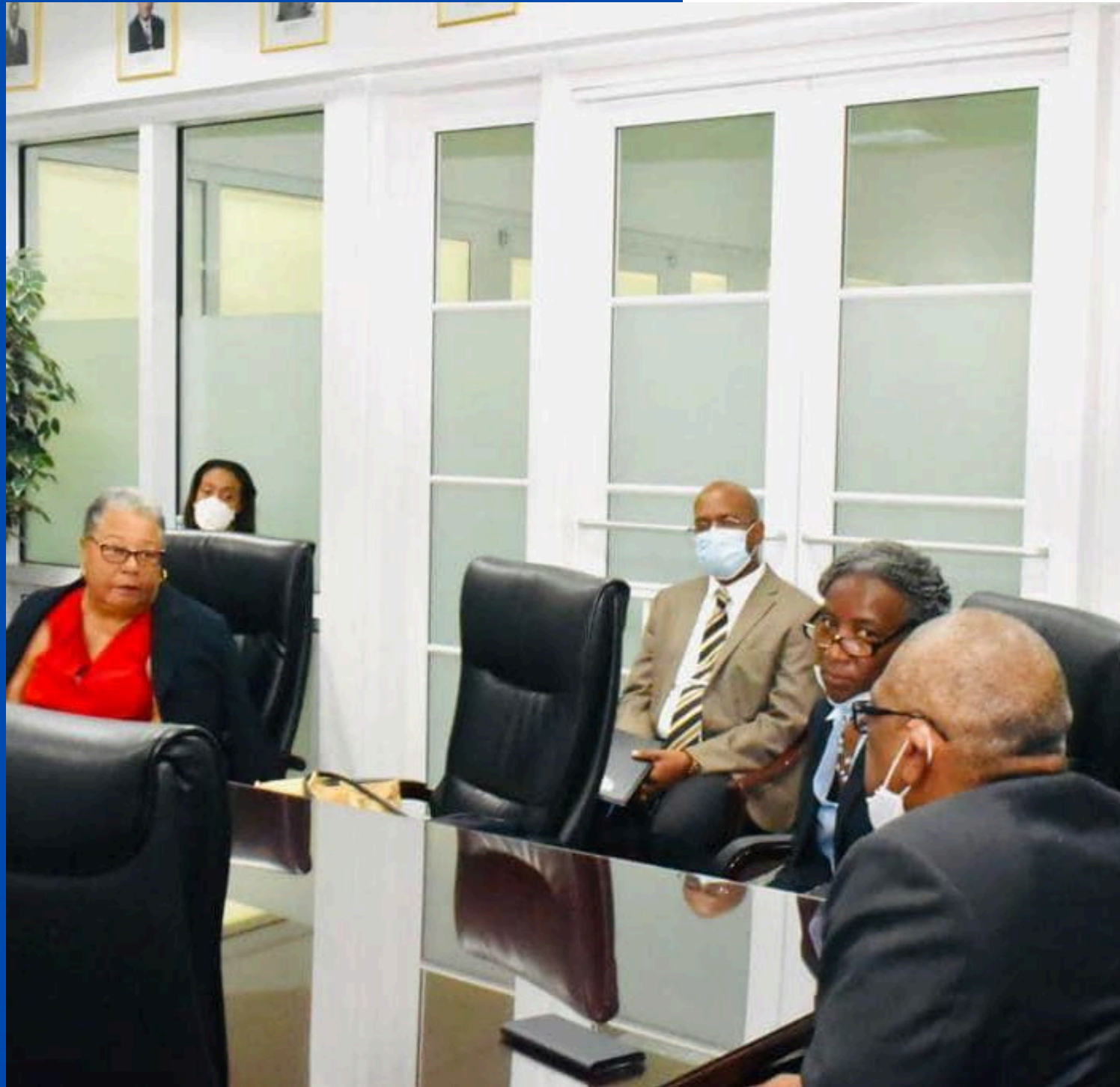
Ministry of Health Team