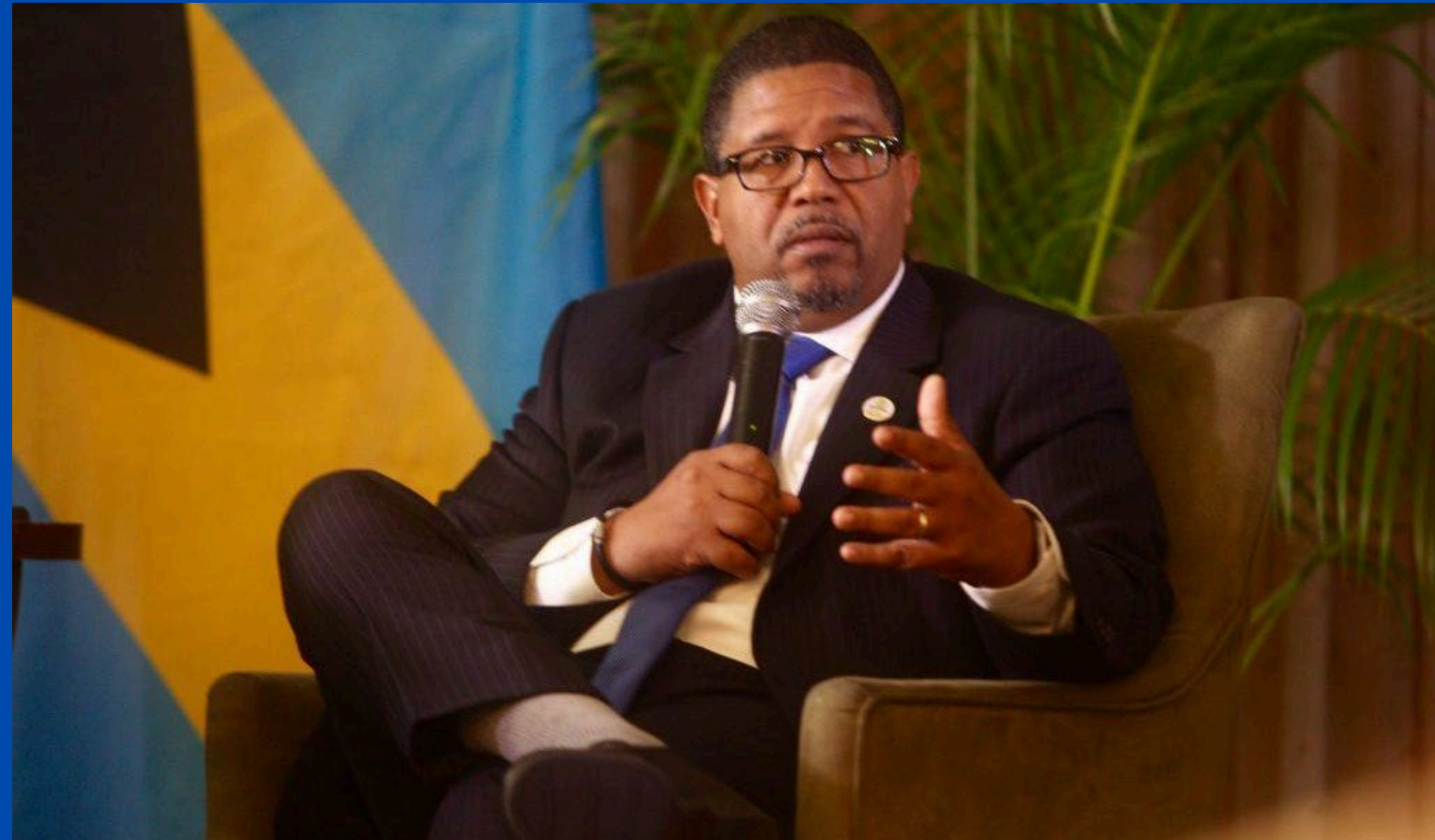
The Hon. Peter Turnquest, M.P., Deputy Prime Minister & Minister of Finance

“We may be shifting from the traditional big volume, big box tourism. We are seeing a move to a more specialty product; a more indigenous product which we anticipate will have even more benefits to Bahamians.”