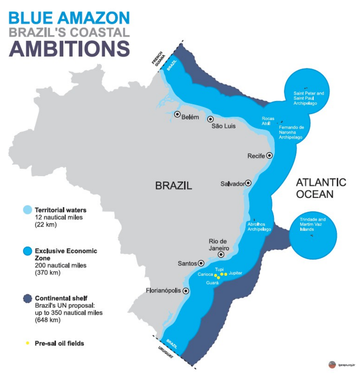
Figure 1. Brazilian Territorial Sea, EEZ and Continental Shelf extension required ("Blue Amazon")<sup>8</sup>

Brazil holds more than 7,400 km of coastline (around 9,200 km considering its curves and indentations) facing the Atlantic Ocean, located between the Oiapoque River (04°52'45" N) and Chuí River (33°45'10" S). The Coastal Zone was defined by the Decree