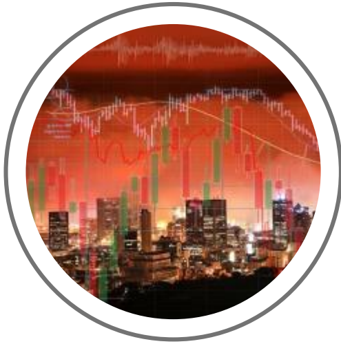
A global economic crisis