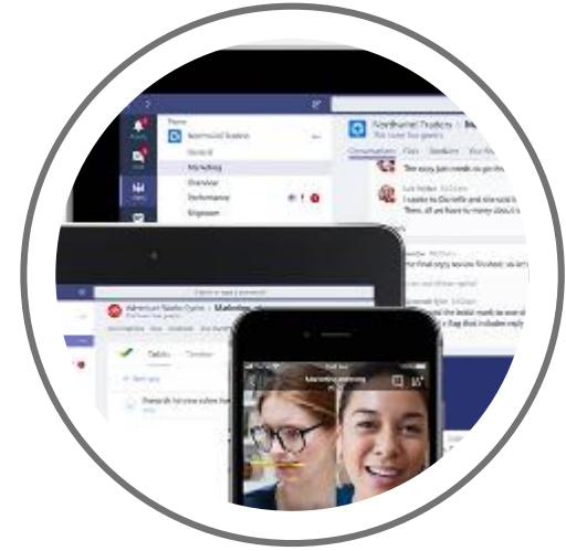
An intensified skilling challenge