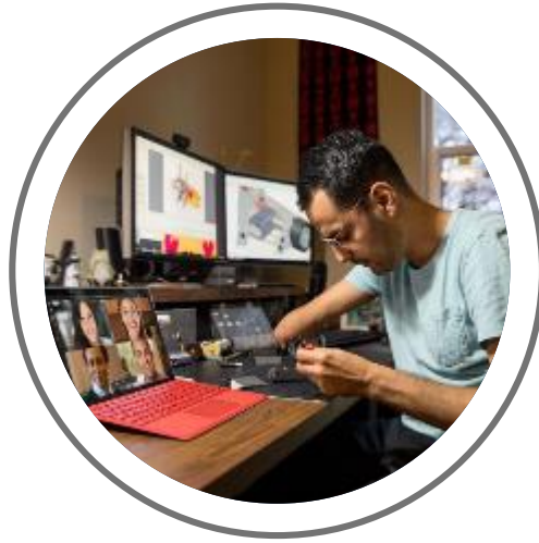
Returning to a different economy