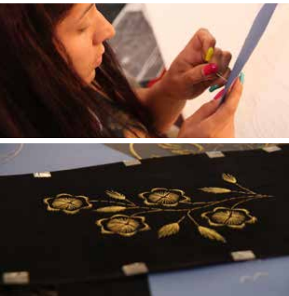
Golden lining workshop

Tradition is a bridge between the past and the future.