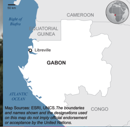
The boundaries and names shown and the designations used on this map do not imply official endorsement or acceptance by the United Nations.