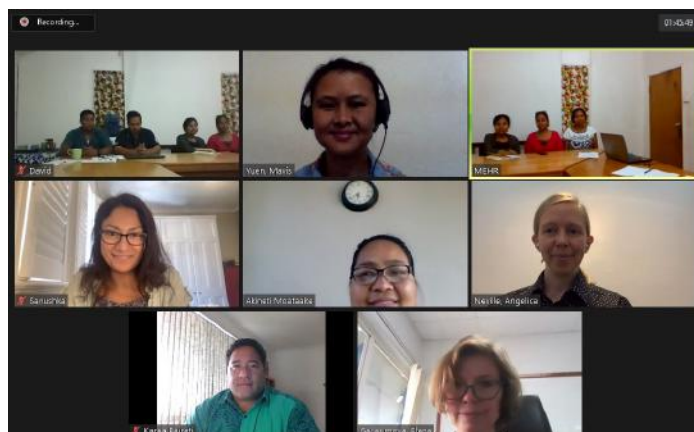
People-centred activity: standard employment contract consultations workshop with Kiribati stakeholders.