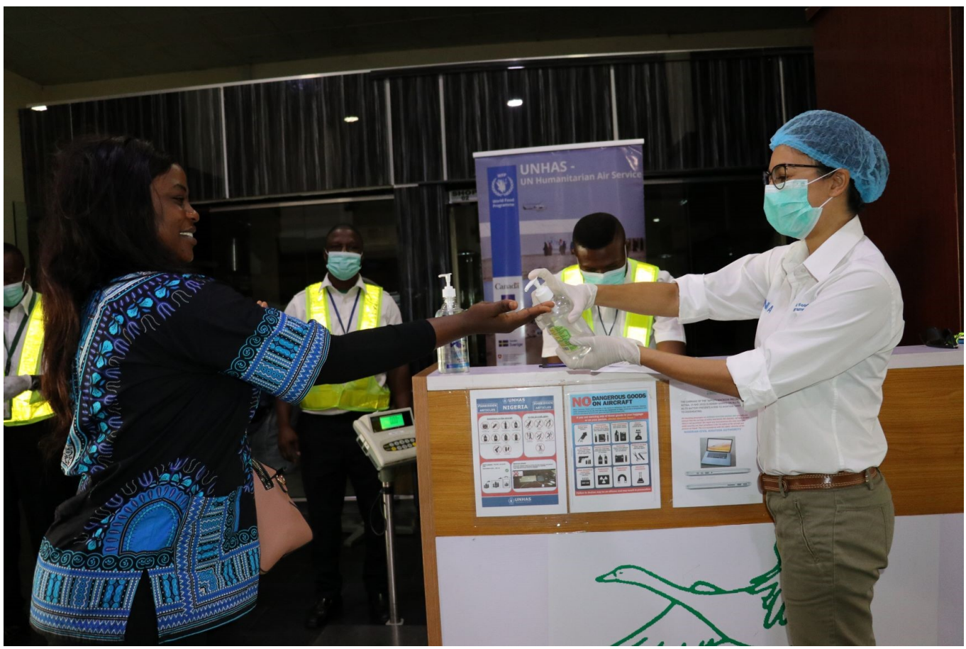
UNHAS staff members enforce COVID-19 preventive measures at the Nnamdi Azikiwe International Airport, Abuja.

s Nigeria grapples with the outbreak of COVID-19, the government has initiated measures including lockdowns and closure of borders to contain the spread of the virus. In the North East of the country, the main airport in Maiduguri, Borno State, is closed to all air traffic, except for military aircraft and flights operated by the United Nations Humanitarian Air Service (UNHAS). The service, managed by the United Nations World Food Programme (WFP), received a special presidential clearance to continue its emergency operations.