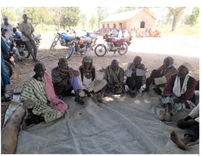
Cross-Section of Cattle Herder Elders in Nasarawa State

To ensure that the two main target populations are adequately captured, key interventions such as the establishment of fodder banks will be made accessible to pastoralists. Key groups including youth and women will be trained on pasture and fodder management for community members. The targeted initiatives focus on livelihood and the empowerment of community members by promoting farming, livestock activities and establishing synergies between these industries.