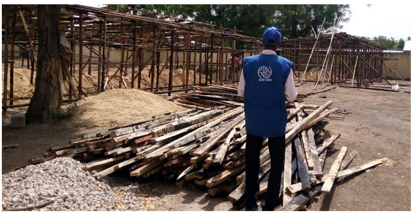
A quarantine shelter under construction

onflict-affected communities in north-east Nigeria are increasingly vulnerable to the COVID-19 pandemic as cases begin to be reported in Borno State. An outbreak would have devastating consequences for millions of internally displaced persons (IDPs) throughout the region, a majority of whom live in overcrowded and underserviced camps.