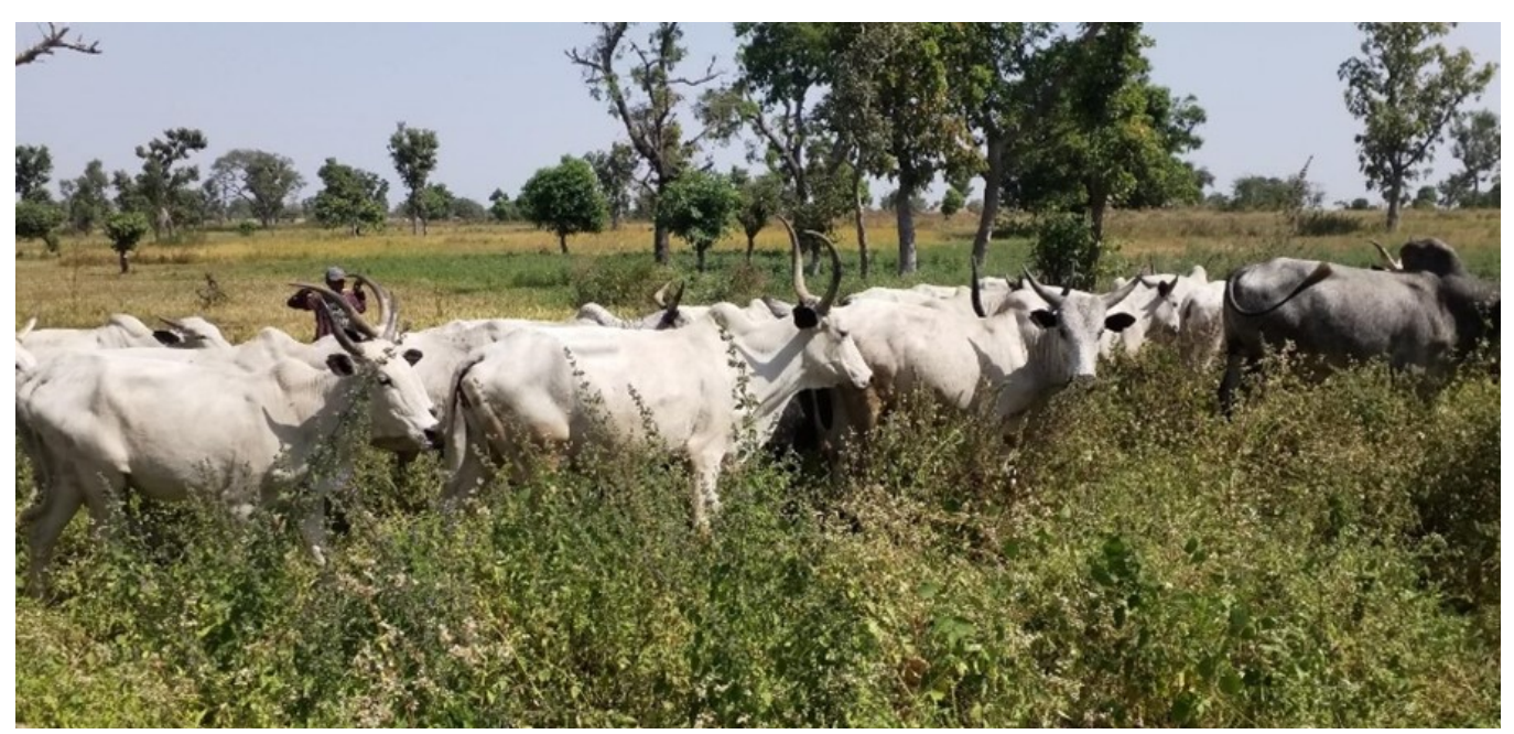
Herd of Cattle Grazing Openly on a Pastureland

The competition for scarce resources between farmers and herders has had devastating impacts on communities in Nigeria's Middle-Belt region. These disputes stem from the struggle for the use and management of resources including water, land, crops, livestock, and grazing routes. The conflict has resulted in the loss of lives and property, as well as the displacement and disenfranchisement of many.