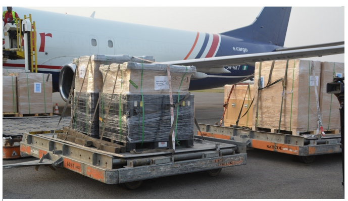
The consignment of essential medical supplies on arrival at the Nnamdi Azikiwe International Airport, Abuja on 13 April.

On 24 April, the UN intensified its support to the government and people of Nigeria in the fight against the coronavirus pandemic when it once again handed over to the government some essential medical equipment and supplies including an ambulance, over 4.7 million gloves, 10,000 face shields, over 19,000 face masks and thousands of other clinical management, surveillance and preventive and control items. Handing over the supplies, UN Resident-Coordinator Edward