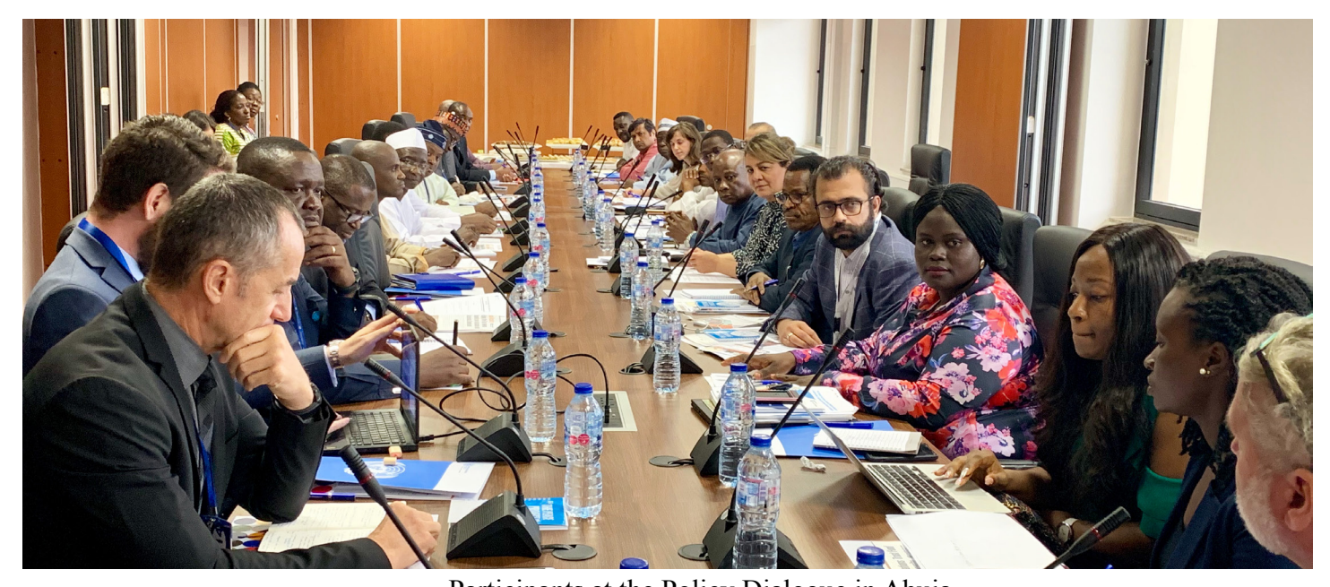
Participants at the Policy Dialogue in Abuja