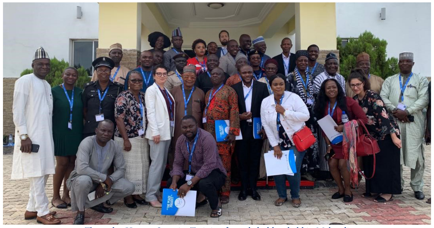
Three-day Human Security Training for stakeholders held in Makurdi