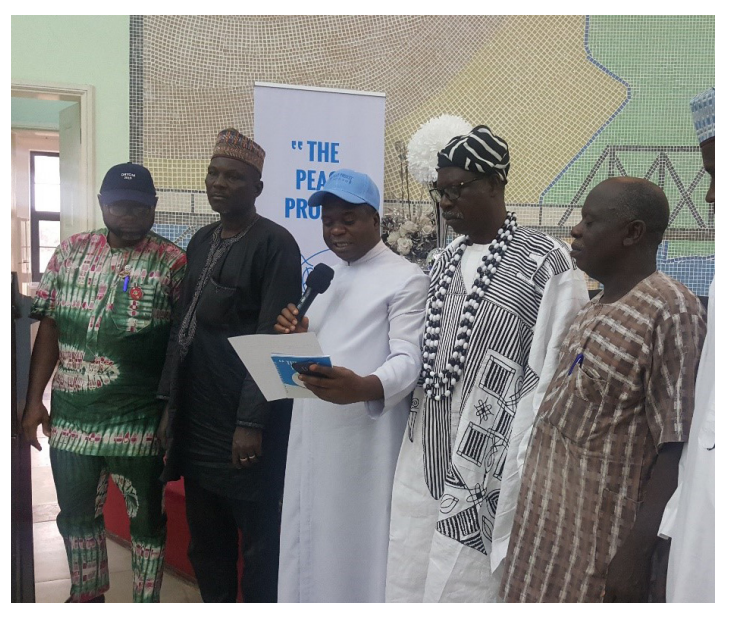
Representatives of the Benue State Government, Miyetti Allah, Farmers Association, Traditional Rulers and Religious Bodies committing to establish the Farmer- Herdsmen Peace Forum.

The project team motivated the state and local government authorities to provide 402.21ha of land needed for new farms and residential buildings with allocation of land in Guma, Logo, Kwande, Buruku and Agatu, for project use.