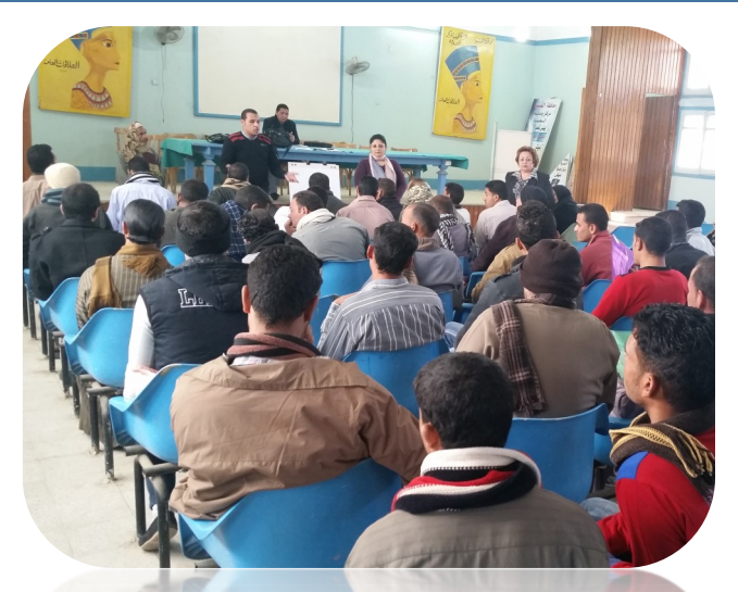
Young job seekers from El-Edwa during one of HAYAT's career counseling workshops