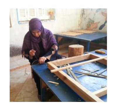
Local entrepreneurship programs enjoy special dedication from the different UN agencies operating in Egypt

The United Nations in Egypt is committed to ensure a high quality of life for all women, men, boys and girls living in Egypt (regardless of race, color, sex, language, religion, political or other opinion, national or social origin, property, birth or other status) by developing national capacity and building strong partnerships with the Government, civil society, the private sector, academia, think tanks, media and other national/international stakeholders.