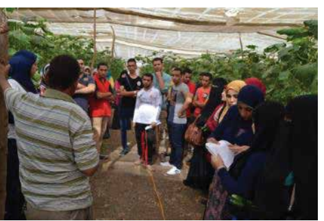
HAYAT's economic development activities are complemented by social and educational initiatives targeting youth and children.