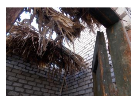
A decayed rooftop in the Baskaloun Village (El-Edwa, Minya) in need for restoration

In order to allow for a quick start up and buy in by the host communities, the project designed rapid interventions aiming at creating a high rapport within the targeted communities and deliver tangible results within a quick time. These priority project initiatives aim at involving the community to design and implement urgent initiatives benefitting vulnerable community members in line with the project scope and envisaged activities.