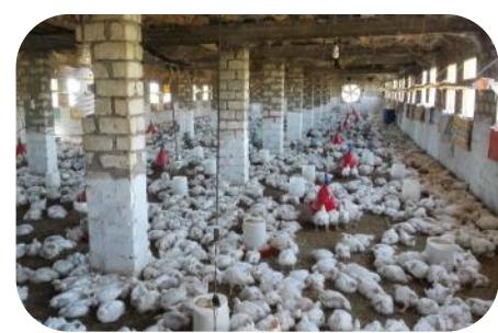
HAYAT is improving the livelihoods of rural communities by upgrading local productive value chains.