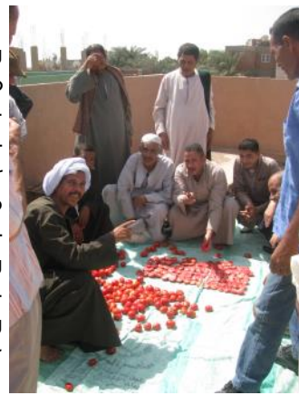
Edwa farmers applying simple tomato sun-drying techniques

In addition to that, around 175 farmers benefited from basic agribusiness training events to enable them adding value to their raw materials by following simple manufacturing techniques. HAYAT has also facilitated the participation of 13 lead farmers from Minya at the Sahara Agricultural Fair in order to link them with service providers and to allow a better transfer of knowledge.