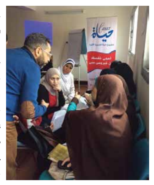
At the forefront of HAYAT's awareness campaign - local healthcare providers coached on effective HCV infection control and prevention.

Egypt has the largest epidemic of Hepatitis C Virus (HCV) in the world. With more than 11 million Egyptians infected, the prevalence of HCV in Egypt amounts to almost 15% of the population. New drugs subsidized by the government offer hope to millions of HCV patients. However, the lack of public awareness on disease transmission and effective prevention often pose an additional challenge to successfully eradicate HCV. In partnership with the Ministry of Health, the Governorate of Minya, the World Health Organization and AGYAL Foundation, HAYAT has launched its HCV community awareness campaign aiming to reach out to every household in the selected target areas in El-Edwa and Maghagha. Central attention is given to local healthcare providers (physicians, dentists, nurses, lab assistants, etc.) and youth volunteers receiving intensive coaching on universal hygiene precautions, HCV infection control and prevention in order to transfer the acquired knowledge to the local communities in a number of awareness raising events thereafter.