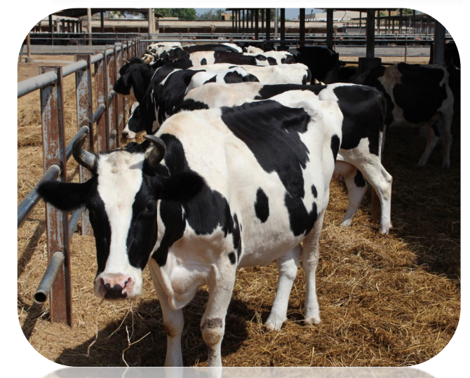
Artificial insemination is applied to improve local breeds of cattle for better meat and dairy production