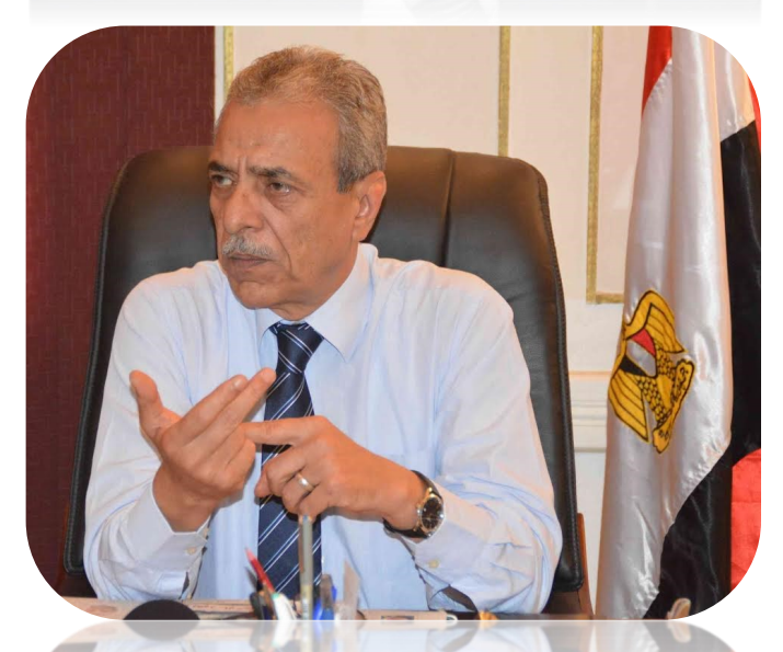
General Salah Zeyada, Governor of El-Minya