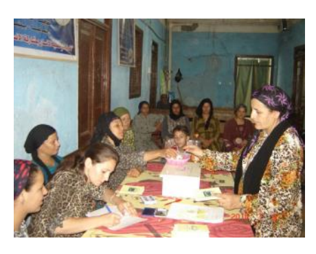
Rural VSLAs empower women to systematically manage their savings and realize productive income generating activities (such as raising livestock) by internally offering solidarity loans to group members.

To support these groups in the field and ensure proper oversight and technical assistance, 17 field officers were recruited and trained on the VSLA methodology as well as on managing and leading VSLA orientation meetings. To ensure a proper understanding by the local communities, HAYAT has furthermore provided tailored training and capacity building sessions on the VSLA approach to more than 600 community members and natural leaders.