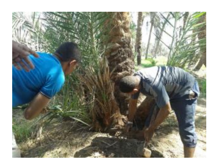
Rural communities in El-Edwa and Maghagha are the main beneficiaries of HAYAT

HAYAT has kicked off in June 2013 and is funded by the United Nations Trust Fund for Human Security Fund (UNTFHS), the Swiss Development Cooperation (SDC) and the Government of Japan. The program is jointly implemented by the United Nations Industrial Development Organization (UNIDO), the International Labour Organization (ILO), the United Nations Human Settlements Programme (UN-HABITAT), the United Nations Entity for Gender Equality and Empowerment of Women (UN Women) and the International Organization for Migration (IOM).