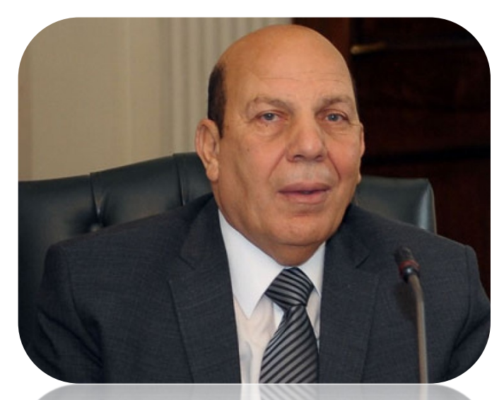
General Adel Labib, Minister of Local Development