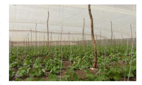
Cucumber cultivated inside one of HAYAT's greenhouse demonstration models in El-Edwa

Allowing for higher productivity on small-sized lands and in order to overcome the challenge of land fragmentation, HAYAT has constructed the first two greenhouses in the history of El-Edwa. Meant as exemplary models for small farmers, HAYAT is promoting protected agriculture by demonstrating the benefits of greenhouse cultivation in expanding the production season, thereby resulting in a more controllable input intensity (water and pesticides), higher productivity and better product market prices. The two greenhouses installed in the village of Atf Haidar and in proximity to the Edwa Administration Unit have already attracted hundreds of curious farmers dropping by every day. Several local farmers, convinced of its economic advantages, have already started replicating the model with their own savings and with technical support from HAYAT's agriculture team.