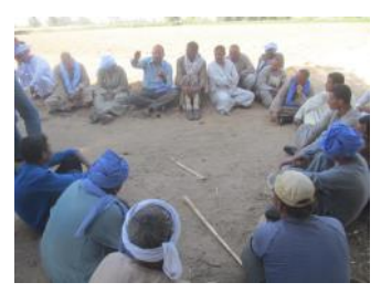
Participatory management is an essential tool for empowering local communities.

The Territorial Analysis (TA) was launched to ensure a continuous participation of target groups (farmers, youth, women etc.) in the implementation of the program, strengthening thus the ownership of HAYAT through local stakeholders and empowering local communities to realize development visions