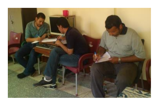
"Forsa" allows young job seekers from Minya to browse local vacancies online and access training and skill enhancement services regularly.

"Forsa" will provide job seekers with the ability to register, create, update, and upload profiles on the portal using their National ID Card. Users will also be able to browse job vacancies as well as relevant trainings. Employers on the other hand can register a company profile directly online, post any number of job vacancies, and receive an online shortlist of recommended candidates. "Forsa" is also accessible to service providers (training centres, NGOs, etc...) where they can post upcoming events and trainings. Job seekers are automatically notified of recently posted trainings.