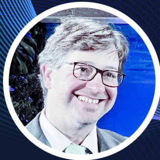
Alexander Caldas UNEP