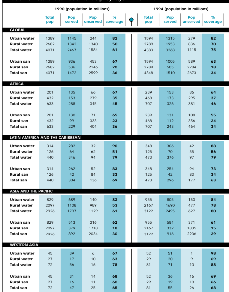
Table 1.5 Water and sanitation coverage by region 1990-1994

Source: World Health Organization, Water Supply and Sanitation Collaborative Council, and United Nations Children's Fund, Water Supply and Sanitation Sector Monitoring Report, World Health Organization, 1996.