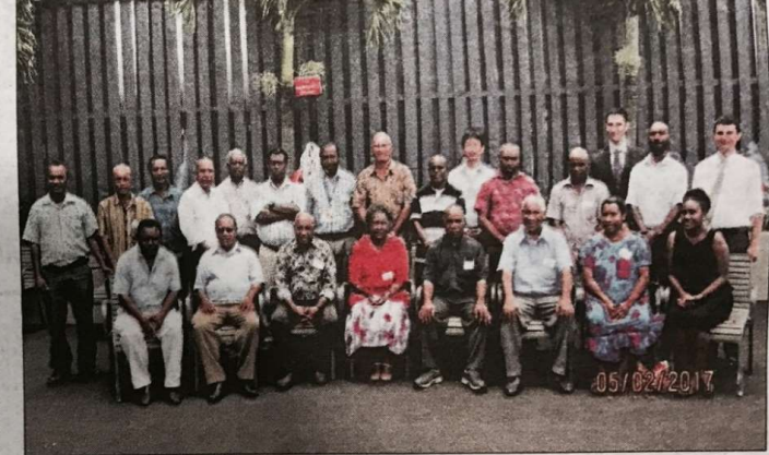
PARTICIPANTS of the first ever UNFF workshop in collaboration with PNGFA which is currently underway in Port Moresby.

She said the basic idea of this workshop is to get government officers to identify and formulate a project pro-