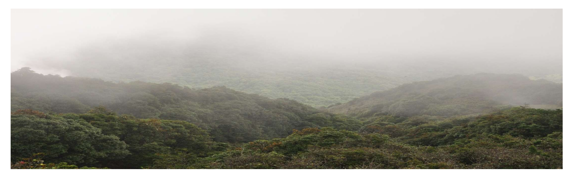
Thank you for your attention