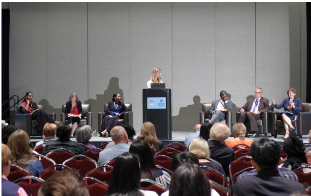
Thematic Session “Enhancing the Role of Civil Society to Monitor Implementation of SDG 11.”