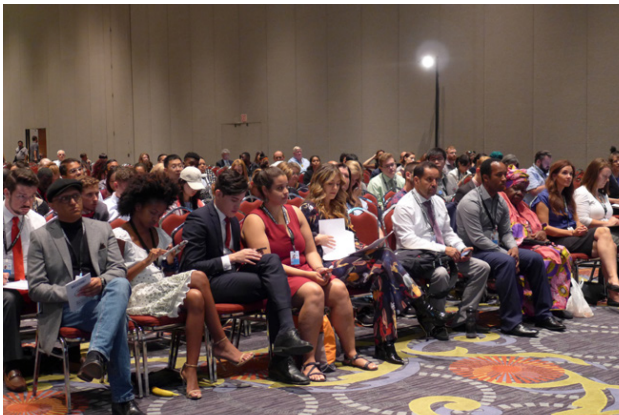
Audience at the youth-led Thematic Session “Creating Opportunities and Economic Success for Youth.”

for marketing or influencing, for example, whereas youth wield these tools to great effect in influencing ideas and creating constituencies.