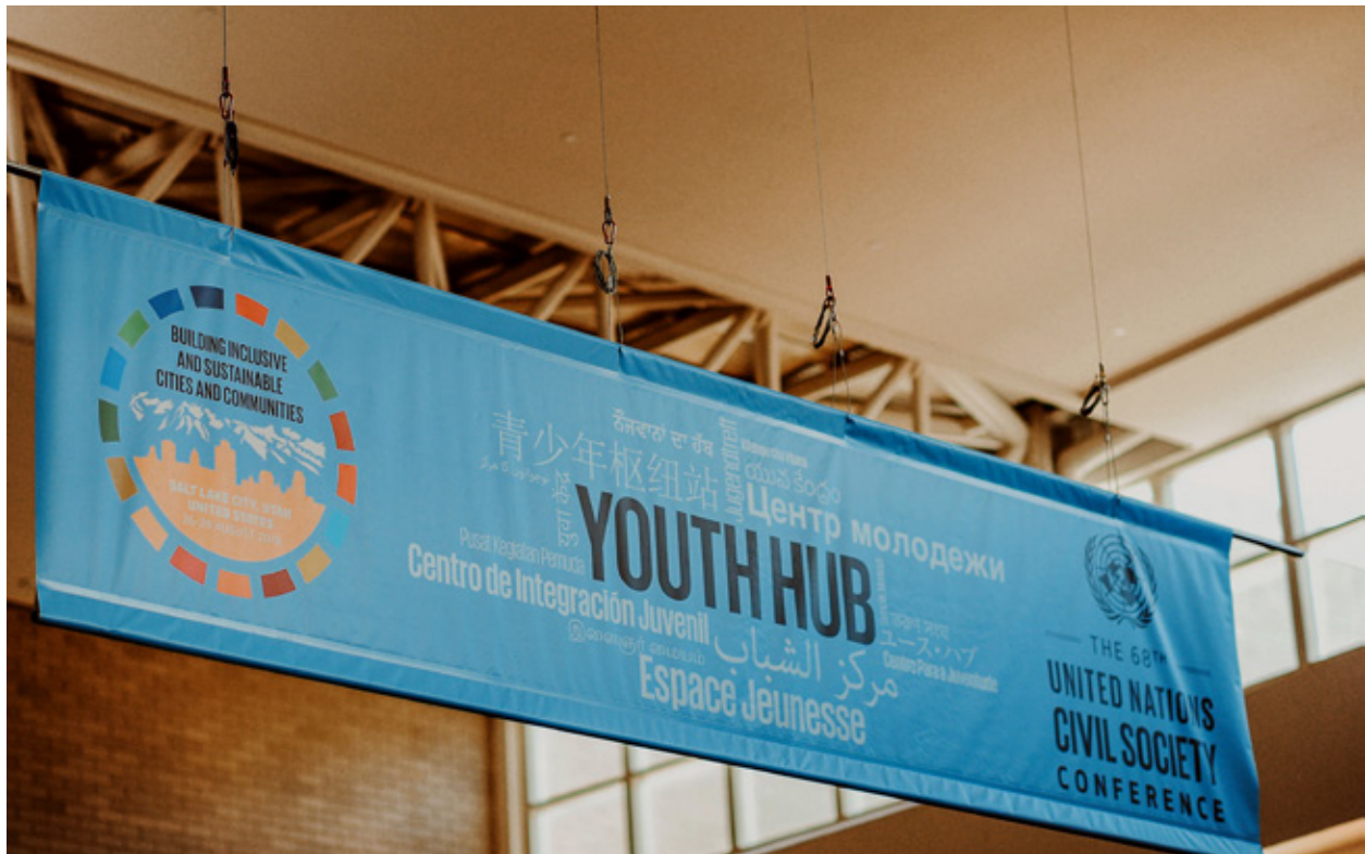
Sign of the Youth Hub at the 68 th UN Civil Society Conference.