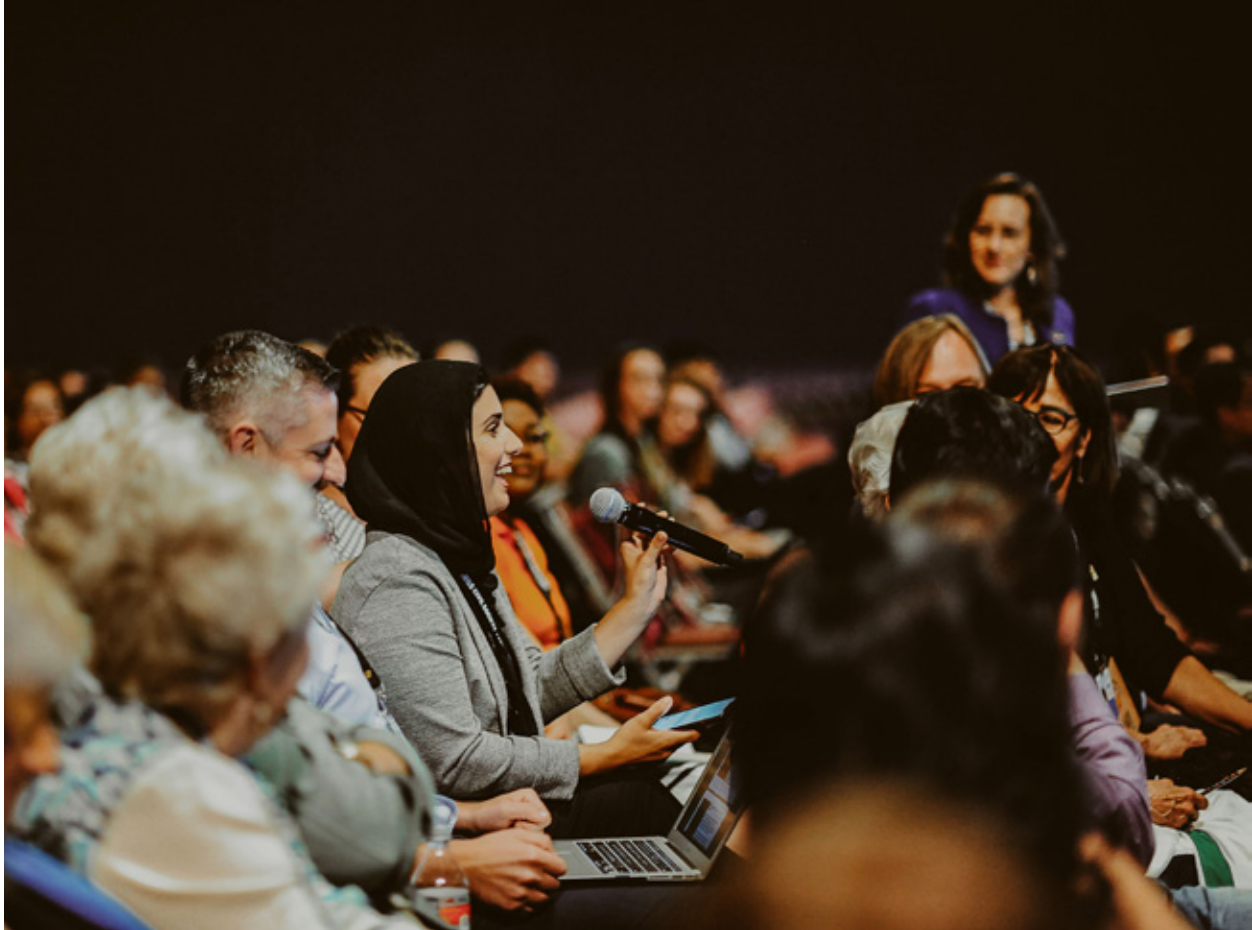
During the question and answer period of the Thematic Session “Inclusive Communities - Leaving No One Behind.”

Ms. Hassan addressed global education and its significance in rural communities. She noted the centrality of language and the connections it builds in communities. When students learn a common language, a world of opportunity is opened to them.