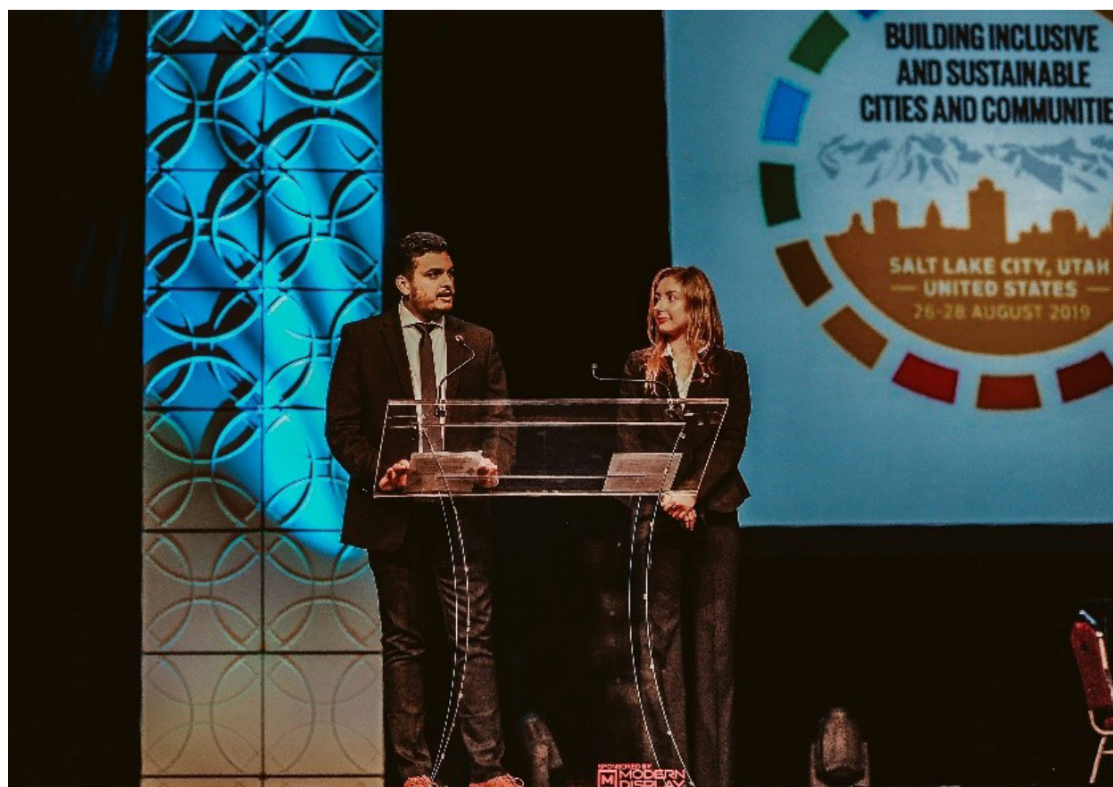
Civil Society Youth Representatives reading the Youth Climate Compact at the closing plenary session of the 68th UN Civil Society Conference.