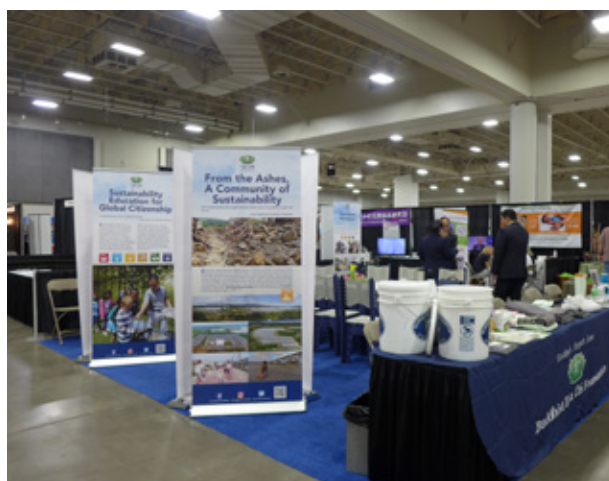
Exhibit of Tzu Chi Foundation at the 68 th UN Civil Society Conference.