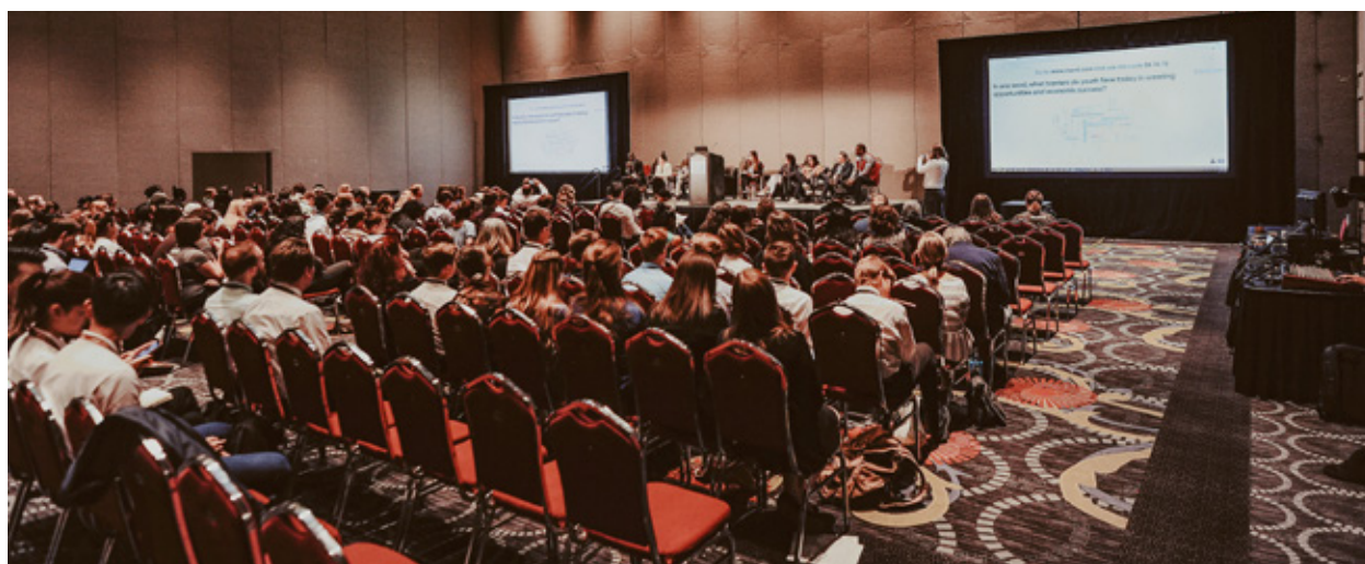
A Civil Society Workshop.