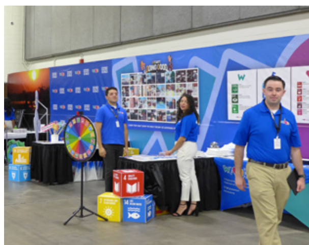
Exhibit of We Love U Foundation at the 68 th UN Civil Society Conference.