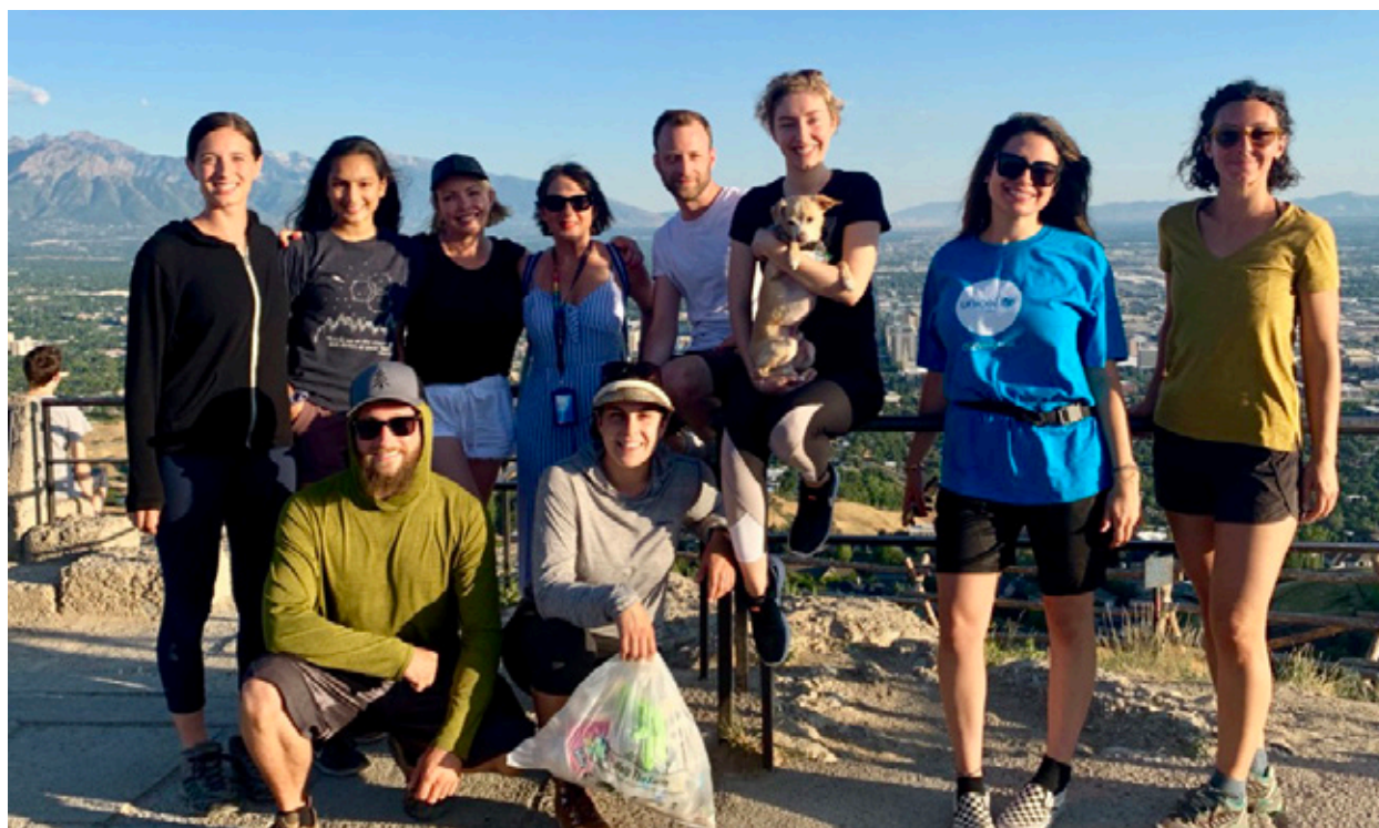
Salt Lake City Hike and Clean-up, 20 June.