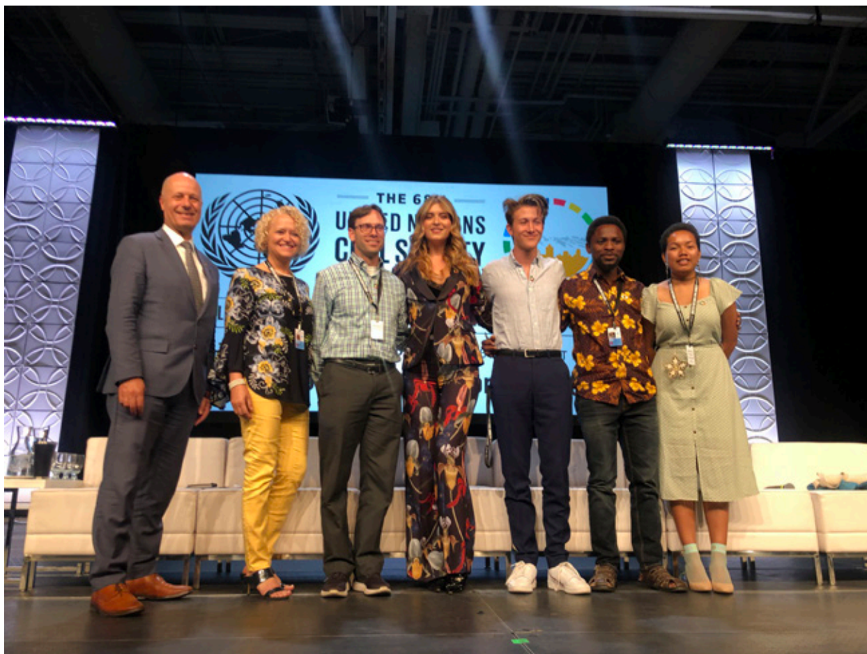
Panelists of the Thematic Session “Climate Change - Cities and Communities in Action.”