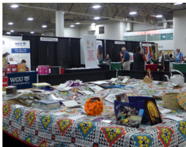
Exhibit at the 68 th UN Civil Society Conference.