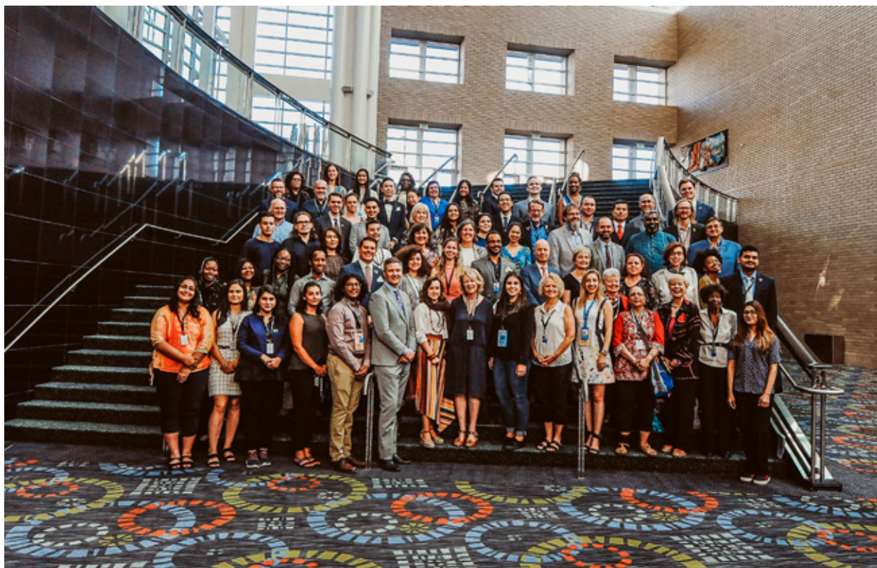
Planning Committee of the 68 th UN Civil Society Conference.