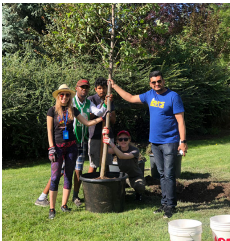
Pre-Conference Activity - Tree Planting, 24 August