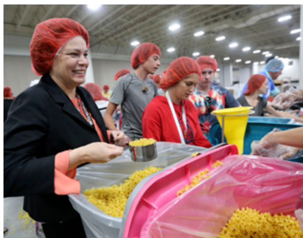
Sister Sharon Eubank, first counselor in the Church of Jesus Christ of Latter-day Saints Relief Society General Presidency, packages pasta dinners for a service project during the 68 th United Nations Civil Society Conference at the Salt Palace Convention