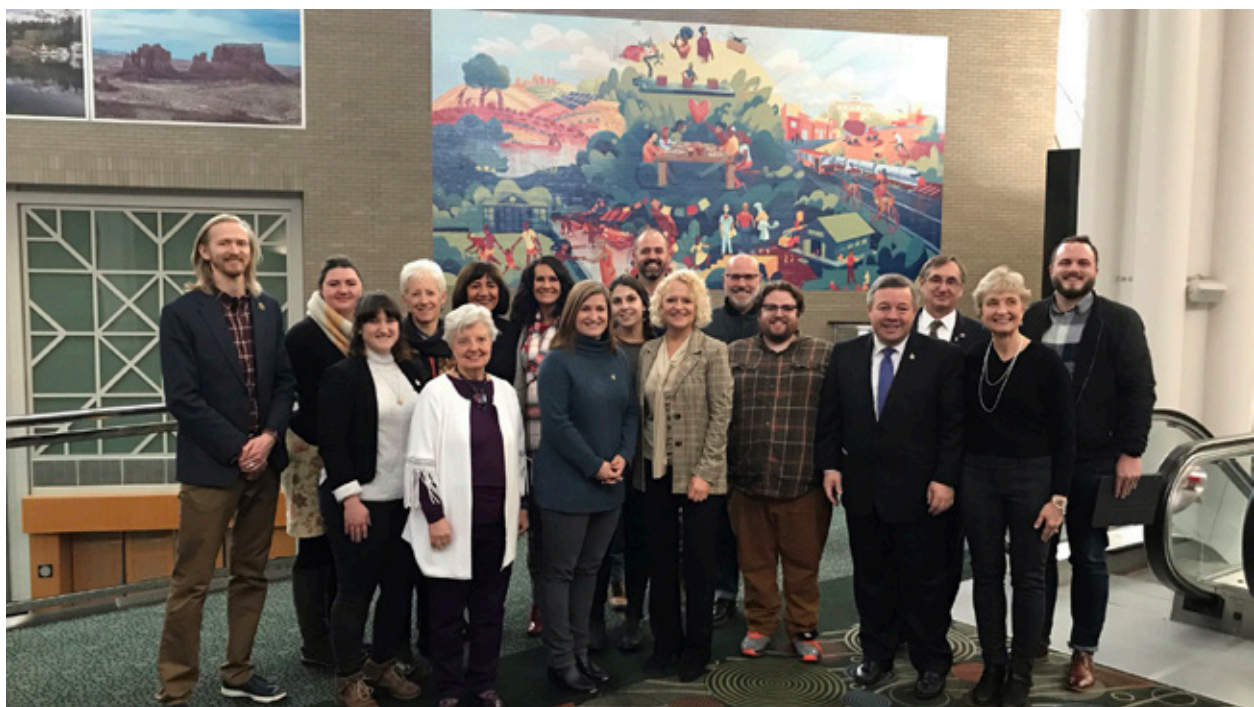
The illustration of the Outcome Statement of the 68 th UN Civil Society Conference was presented as a mural now displayed in the Salt Palace Convention Center on 30 December 2019, where it will be on permanent display.

We thank the people and the governments of the United States of America, the State of Utah, and Salt Lake City for the kind welcome and gracious hosting they have given to the 68 th United Nations Civil Society Conference and for their efforts to achieve the United Nations Sustainable Development Goals.