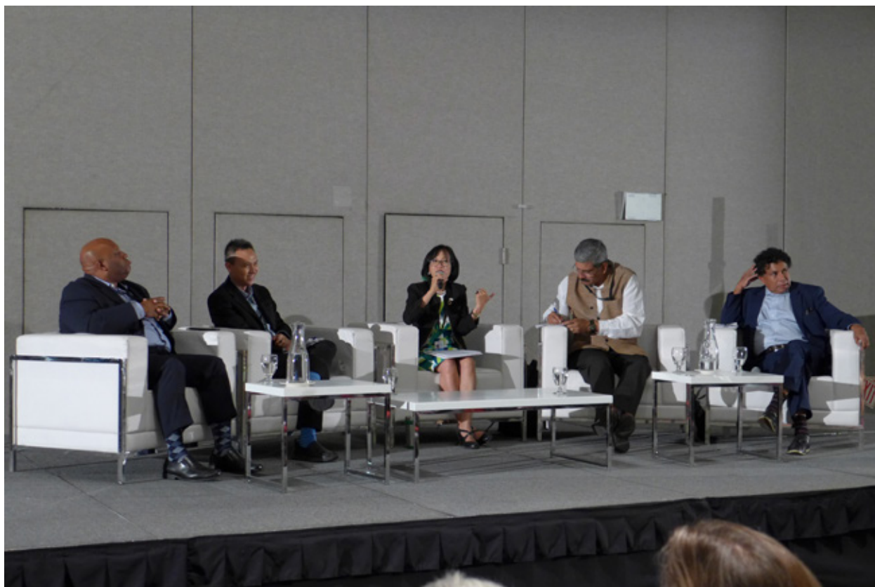
Thematic Session “Building Inclusive Communities Through Education.”

Mr. Damodaran noted two important phrases are often used in the United Nations realm: 1. The dignity and worth of the human person. 2. Unite our strength. We begin with the individual and then combine our strength to make great accomplishments. How does education fit into this? The UN is rich in the use of acronyms. When he saw the word “UTAH,” he said he thought it might stand for: “Unleashed Truth and Hope.” Truth and hope are the two things we need today which education can provide – truth in what is and can be, to counter ignorance, error, deception and hate; and hope for progress and a better future.