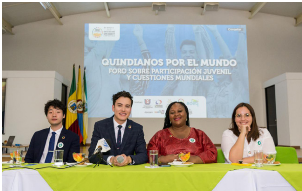
Youth Participation Colombia Pre-Conference.