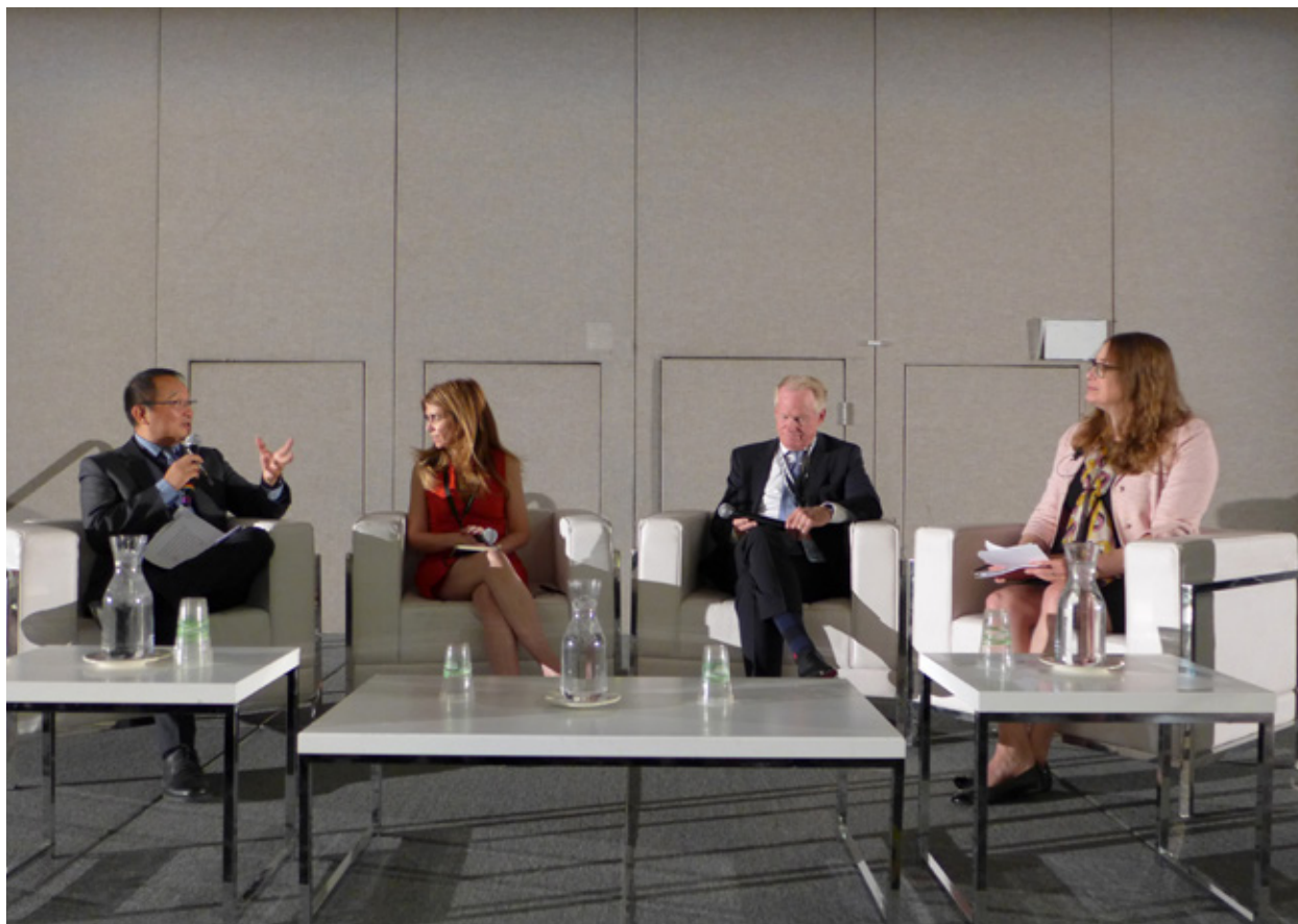
Thematic Session “Impact Investing: Financing the SDGs.”