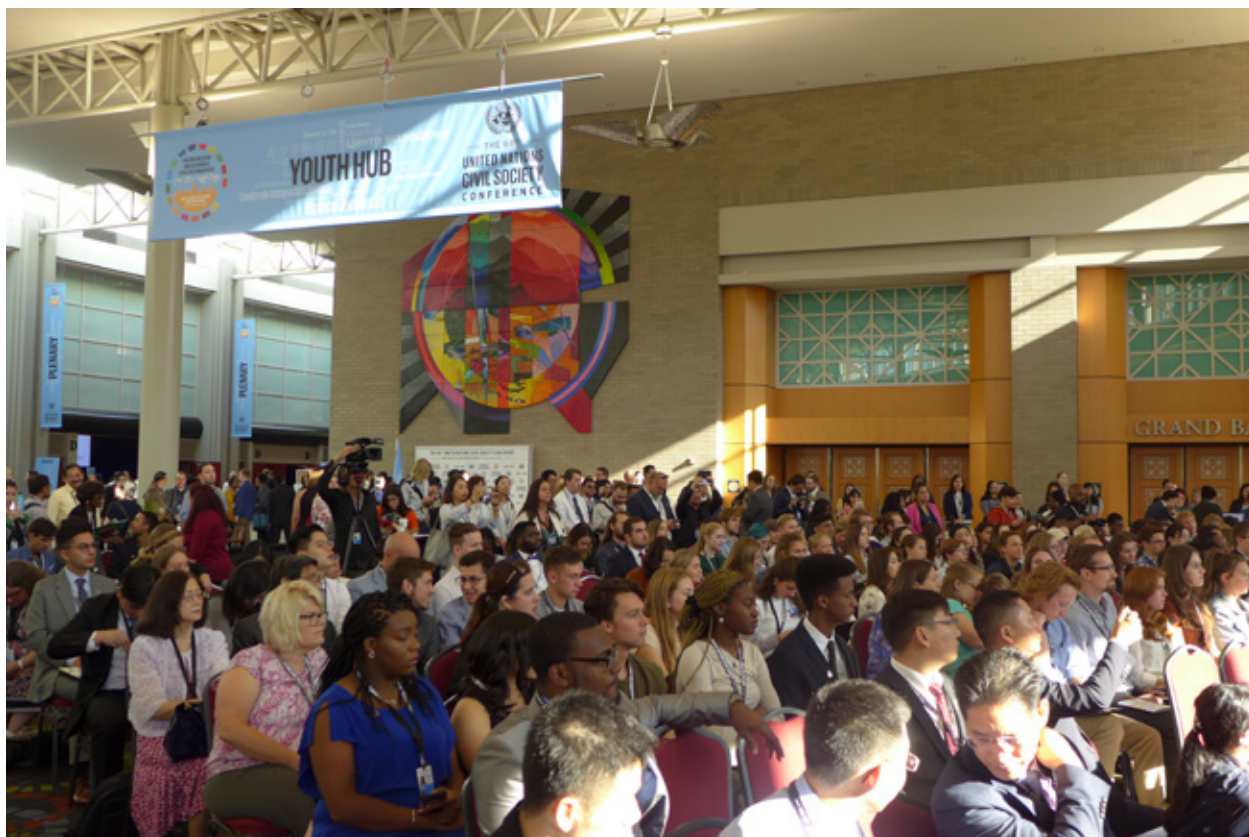
Audience at the Youth Hub of the 68 th UN Civil Society Conference.